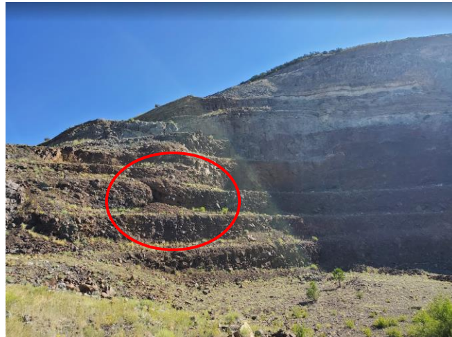
View to the northwest of highwall. Erosion channels can be seen on the north end of the pit highwall.