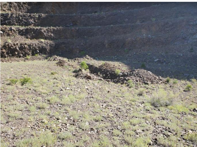
View to the northeast of trench on the pit floor.