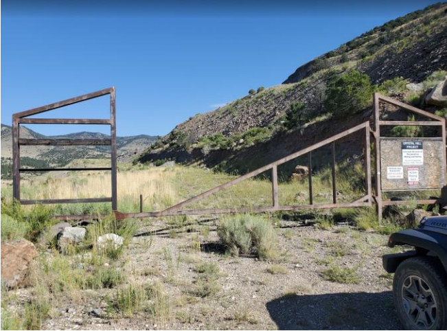
View to the north of gate that secures access and the proper Mine ID signage.