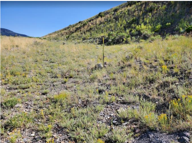
View to the north of t-post that marks permit boundary