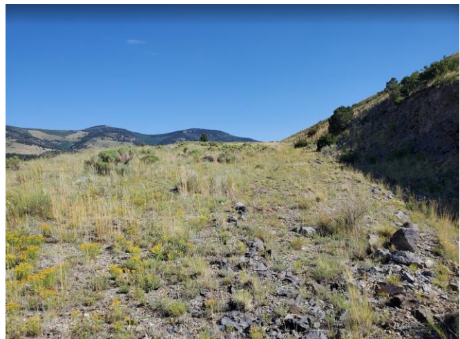
View to the north of the Waste Dump Area. No material has been placed here.