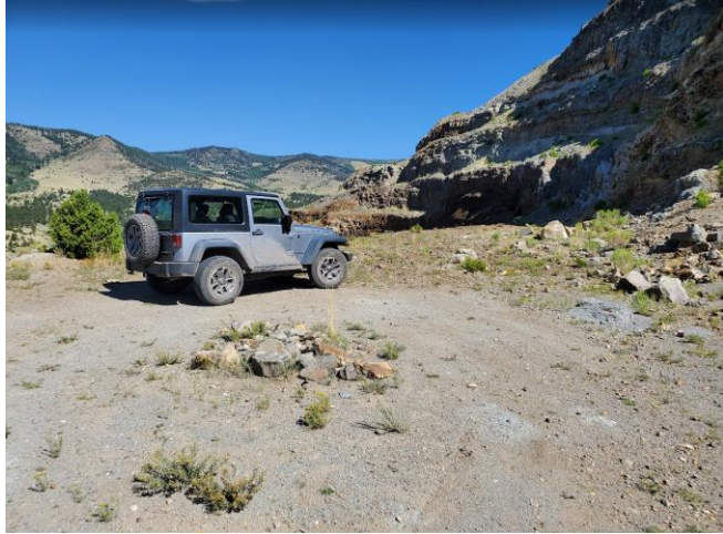
View to the north of upper road that ends above highwall. No gate or signs in the area and a fire pit can be seen in the foreground.