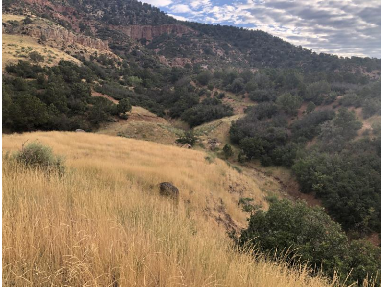
Old Waste Disposal Area, and drainage above