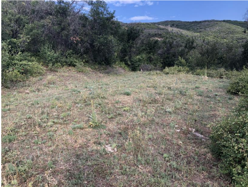
Pad for drill hole DH-67