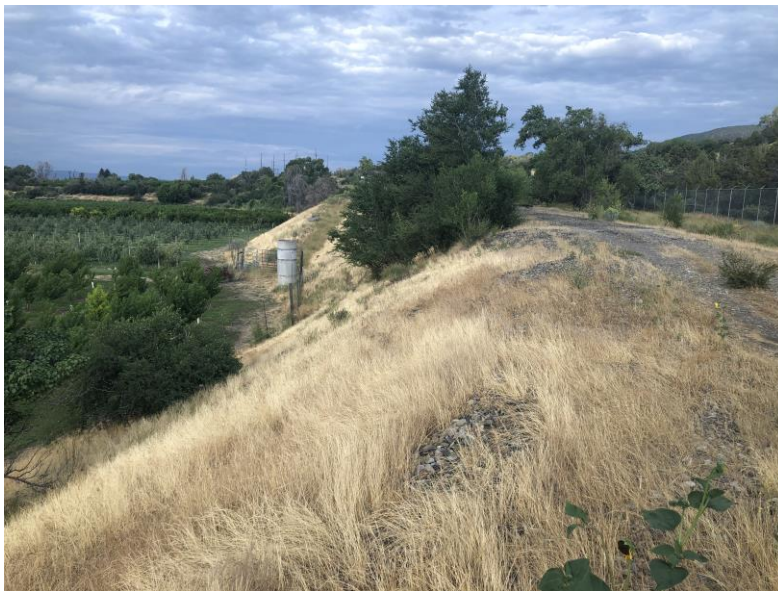
Hillside below the loadout

Number of Partial Inspection this Fiscal Year: 1