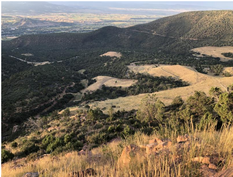
Lower East Mine – RDA, Old Waste Disposal Area, and drainage below

Number of Partial Inspection this Fiscal Year: 1