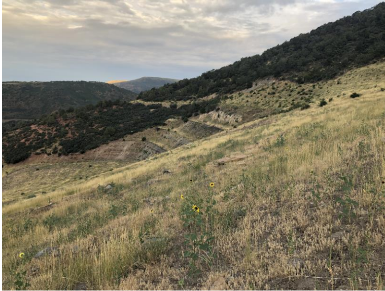
Steep slope on upper part of East Mine