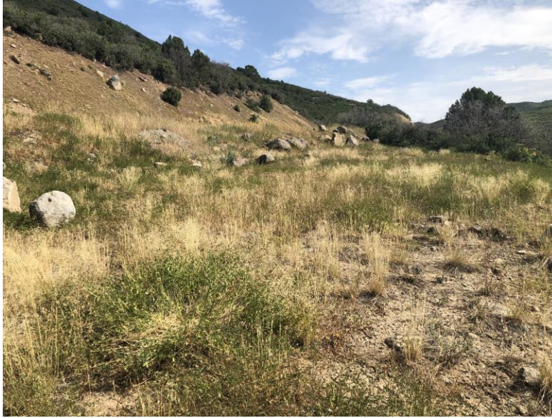
Pad for drill hole DH-92