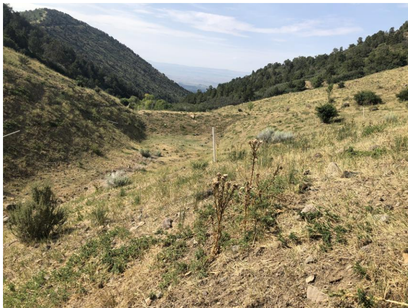
Upper pond at West Mine (note sprayed thistle)