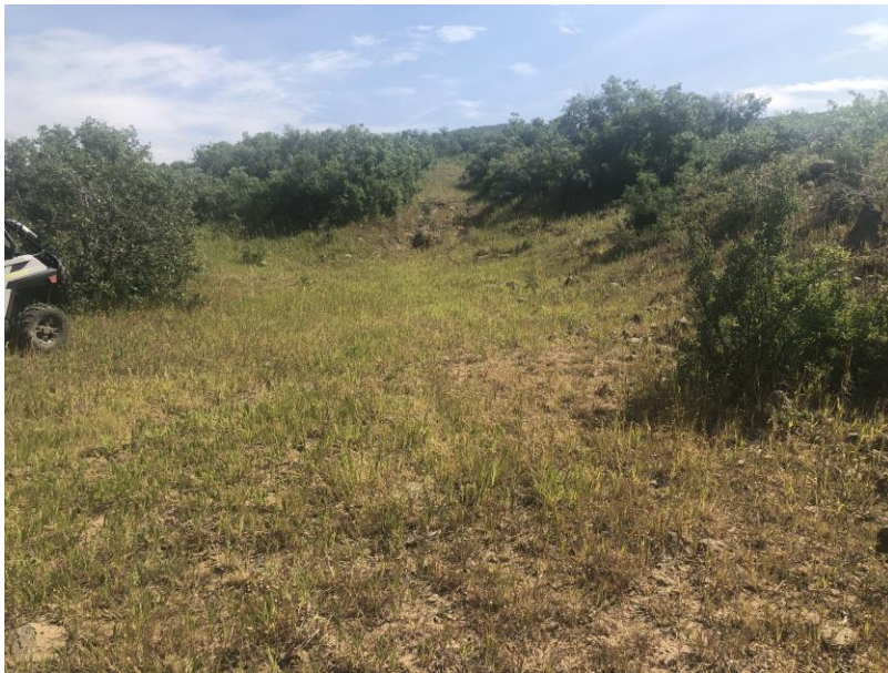
Pad for drill hole DH-41

Number of Partial Inspection this Fiscal Year: 1