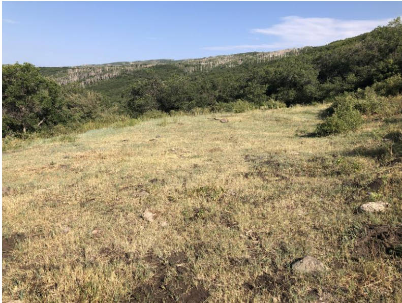
Pad for drill hole DH-55

Number of Partial Inspection this Fiscal Year: 1