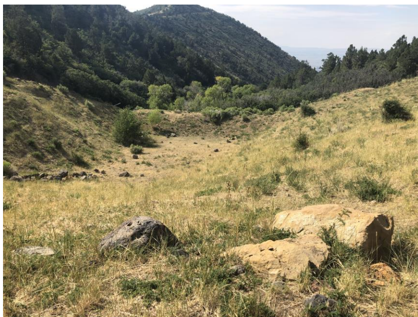
Lower pond at West Mine

Number of Partial Inspection this Fiscal Year: 1