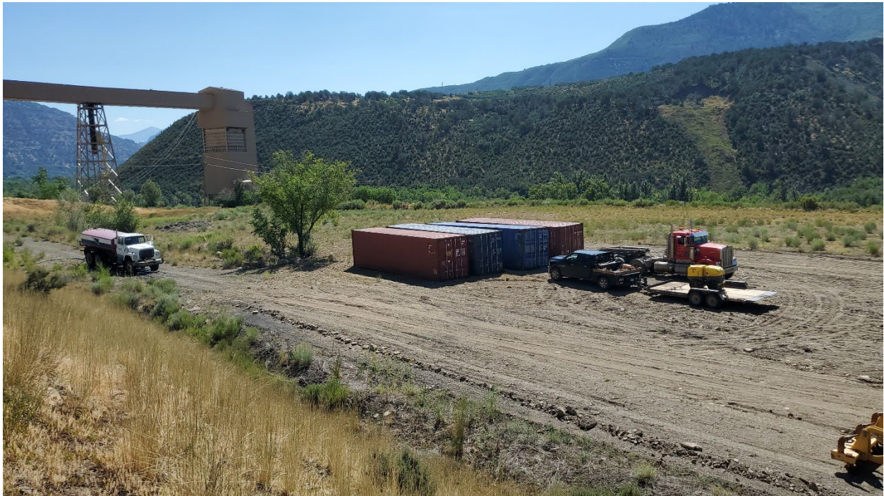
Figure 1: Four containers, water truck, mini compactor