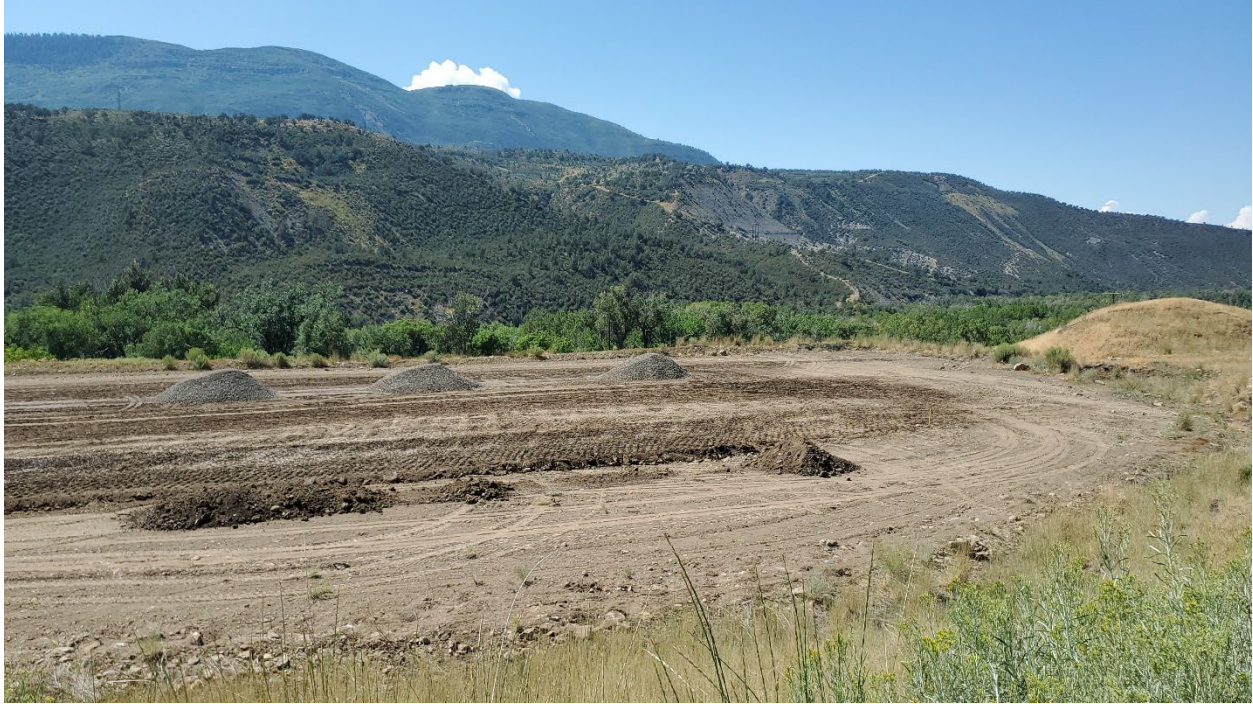
Figure 3: Regrading and compaction in progress. Gravel being brought to site

Number of Partial Inspection this Fiscal Year: 1