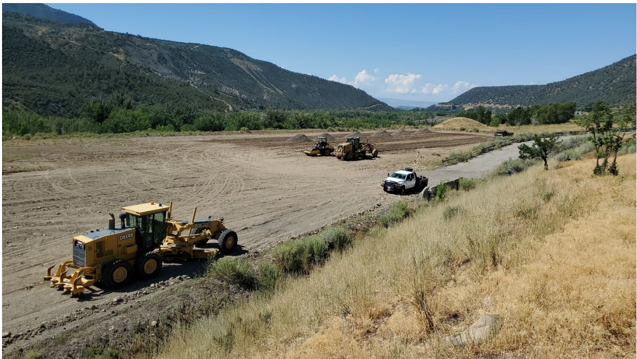
Figure 2: Two graders, sheep's foot compactor and dump truck

Number of Partial Inspection this Fiscal Year: 1