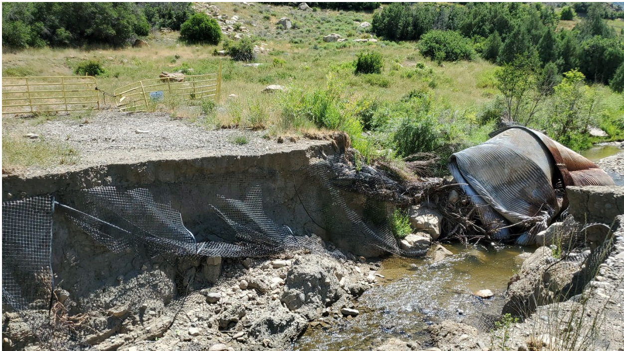
Figure 1: Blown out access to Hubbard Creek fan-site

No enforcement actions were initiated as a result of this inspection, nor are any pending.