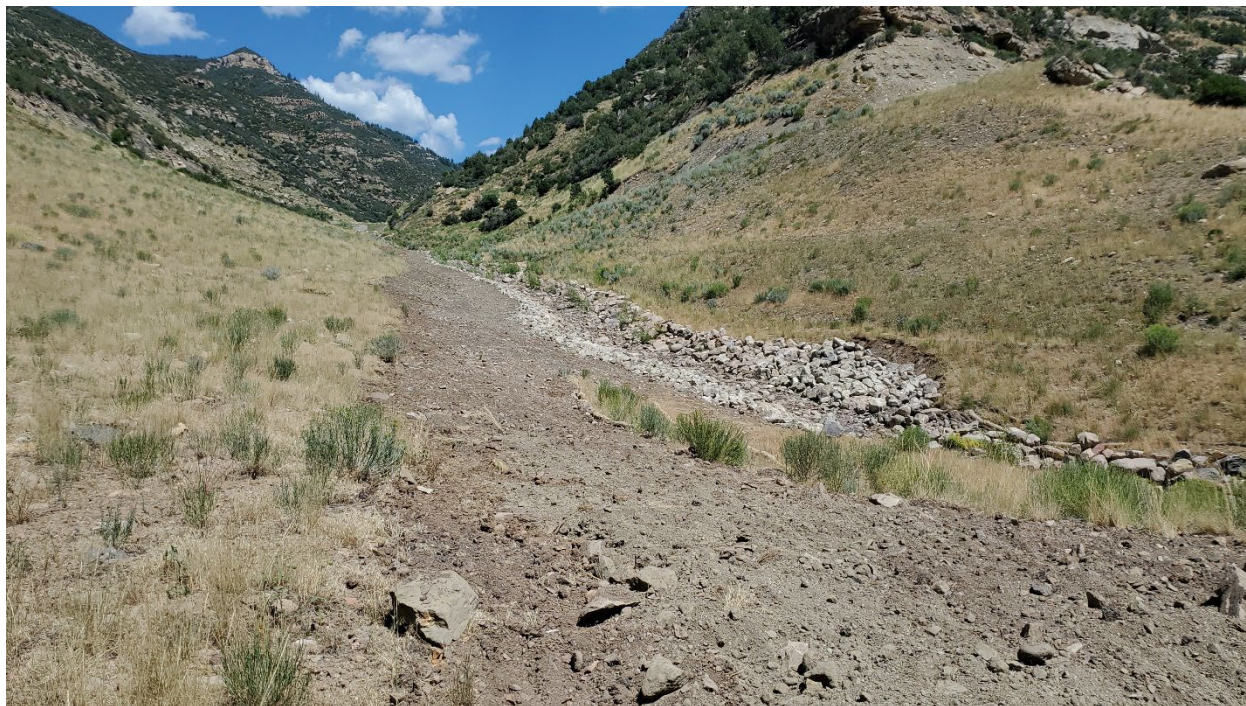
Figure 4: Regraded access to Elk Creek stream channel