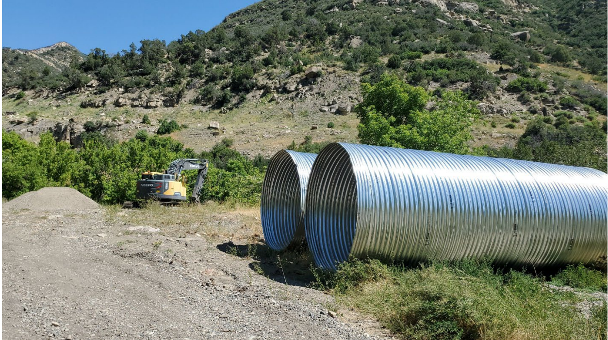
Figure 2: Material and equipment staged for repairs