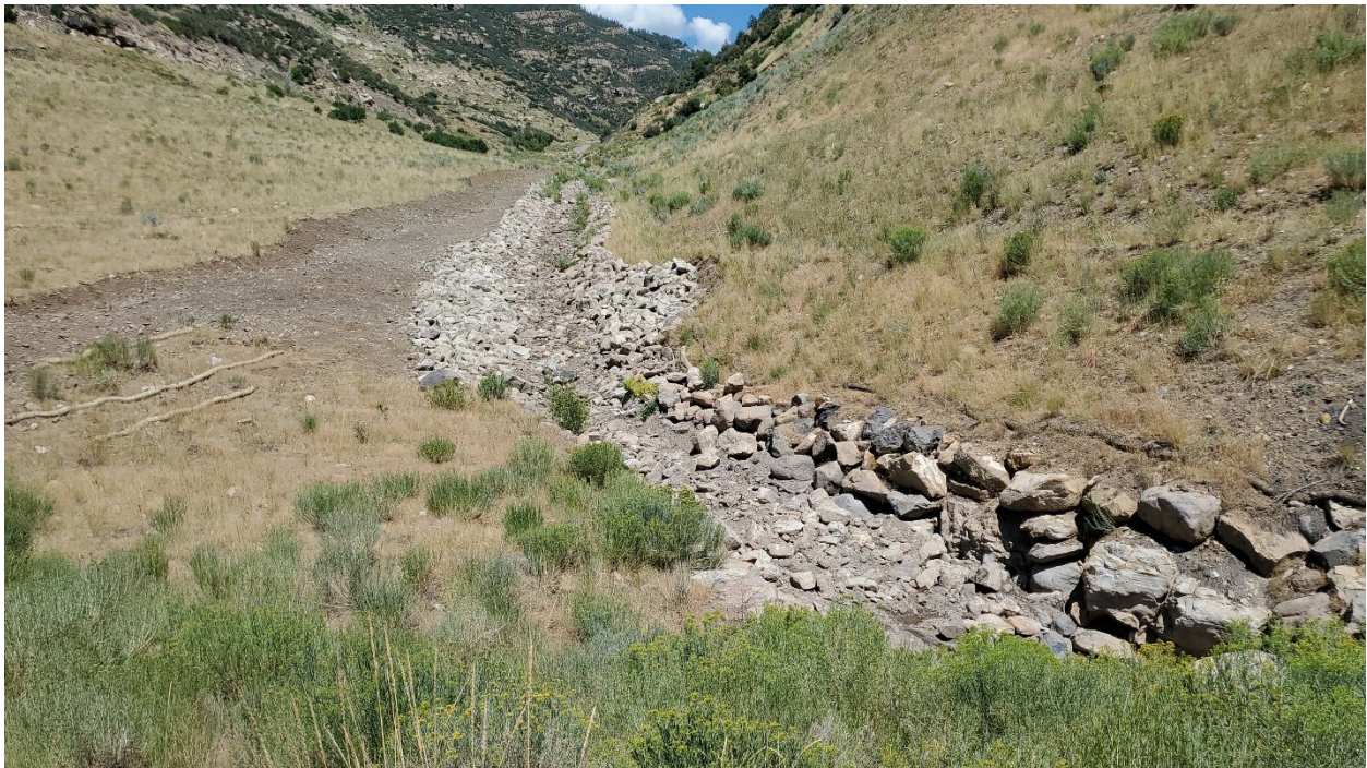
Figure 3: Repaired Elk Creek stream channel

Number of Partial Inspection this Fiscal Year: 1