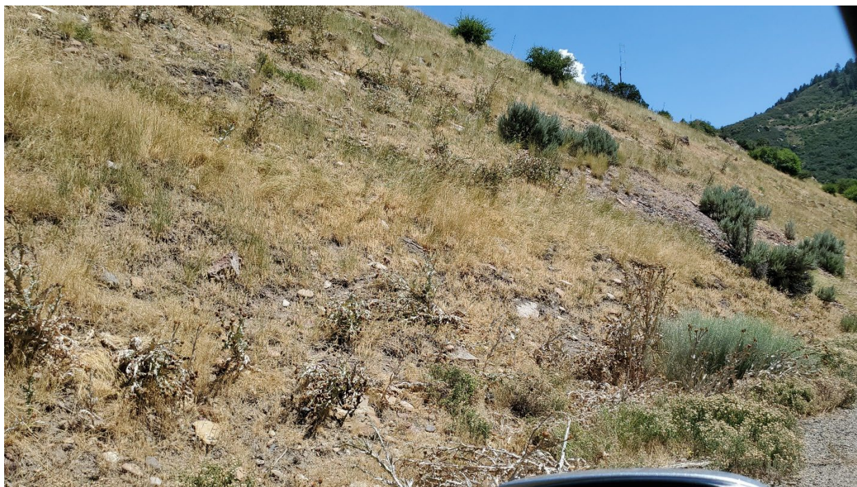
Figure 5: Treated Scotch Thistle

Number of Partial Inspection this Fiscal Year: 1