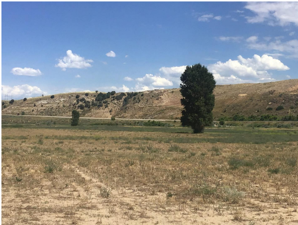
Photo 3: Cropland area along the Williams Fork River, looking north.

Number of Partial Inspection this Fiscal Year: 1