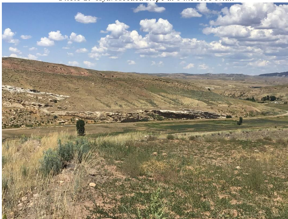
Photo 2: Overview of the cropland area along the Willliams Fork River looking northwest from above.

Number of Partial Inspection this Fiscal Year: 1