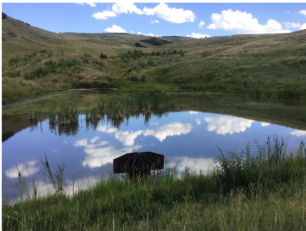
Photo 2: Pond 12, looking (east) up the slopes awaiting final bond release.