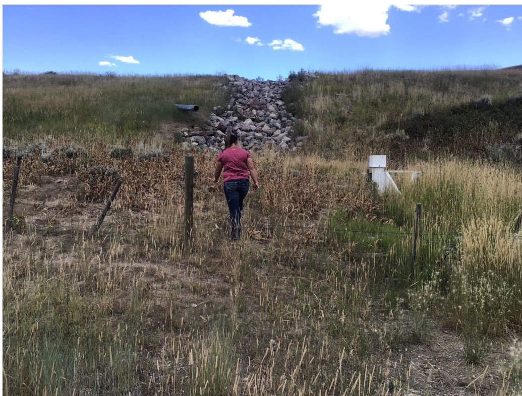
Photo 3: Pond 13 discharge structures viewed from the County road.

Number of Partial Inspection this Fiscal Year: 1