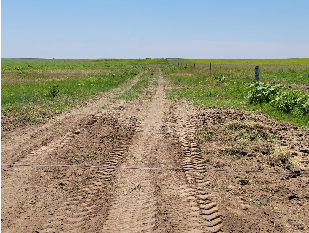
Photo 1: Looking south from the entrance. Two track road leads to mining area.