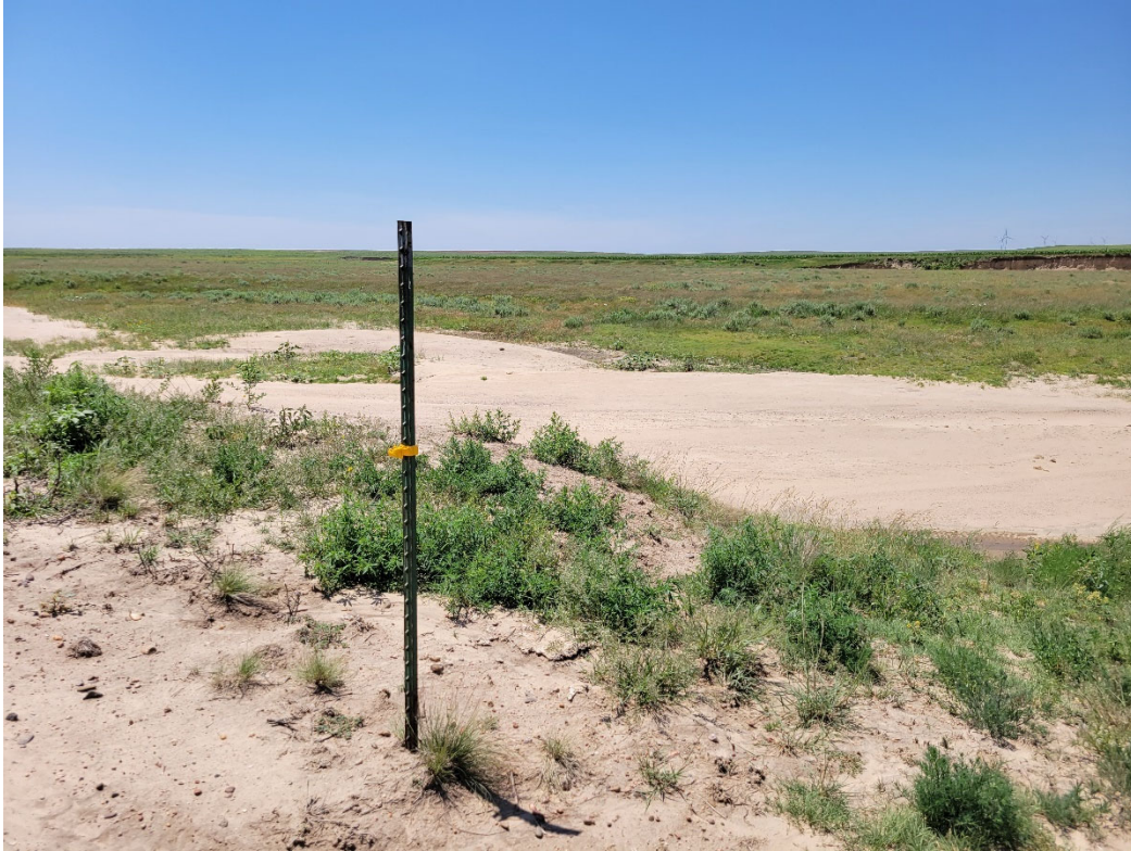
Photo 7: Looking south from the northeastern corner of the permit area.