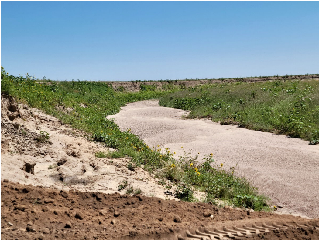
Photo 4: Looking northeast at Big Timber Creek from road crossing location. Ephemeral creek flows around proposed mining area. The creek bed will be unaffected by mining.