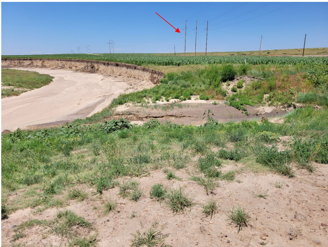
Photo 9: Overhead electric lines along the county road, outside the permit area.