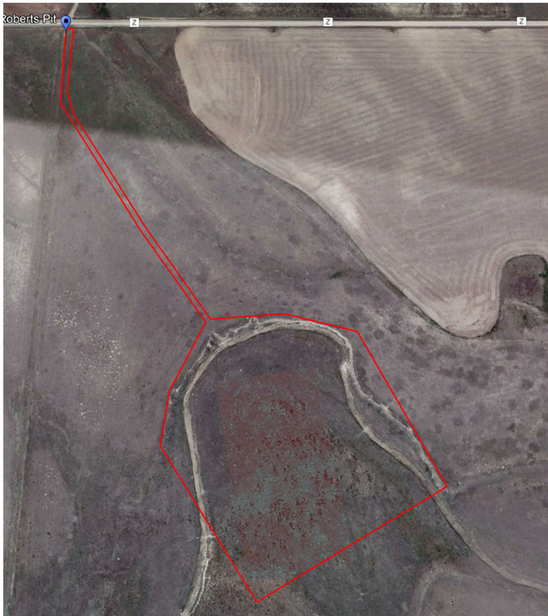
Photo 10: Approximate permit boundary. Google earth imagery 04/2020,