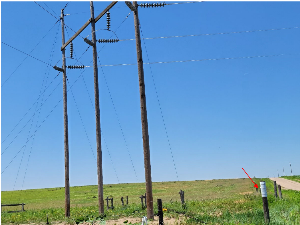
Photo 2: Powerline at the entrance to the site. Arrow points to posted notice sign.