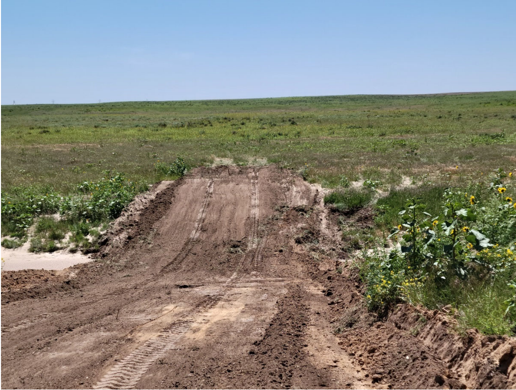
Photo 3: Graded dirt crossing of Big Timber Creek. Proposed mining area in the background.