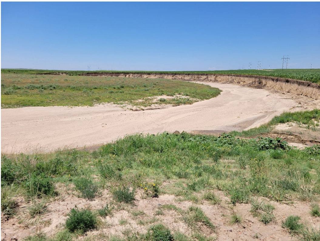
Photo 8: Looking west along the northern permit boundary. A 90' buffer/berm is proposed along around the south side of the creek to protect the mining area from flooding from the creek.