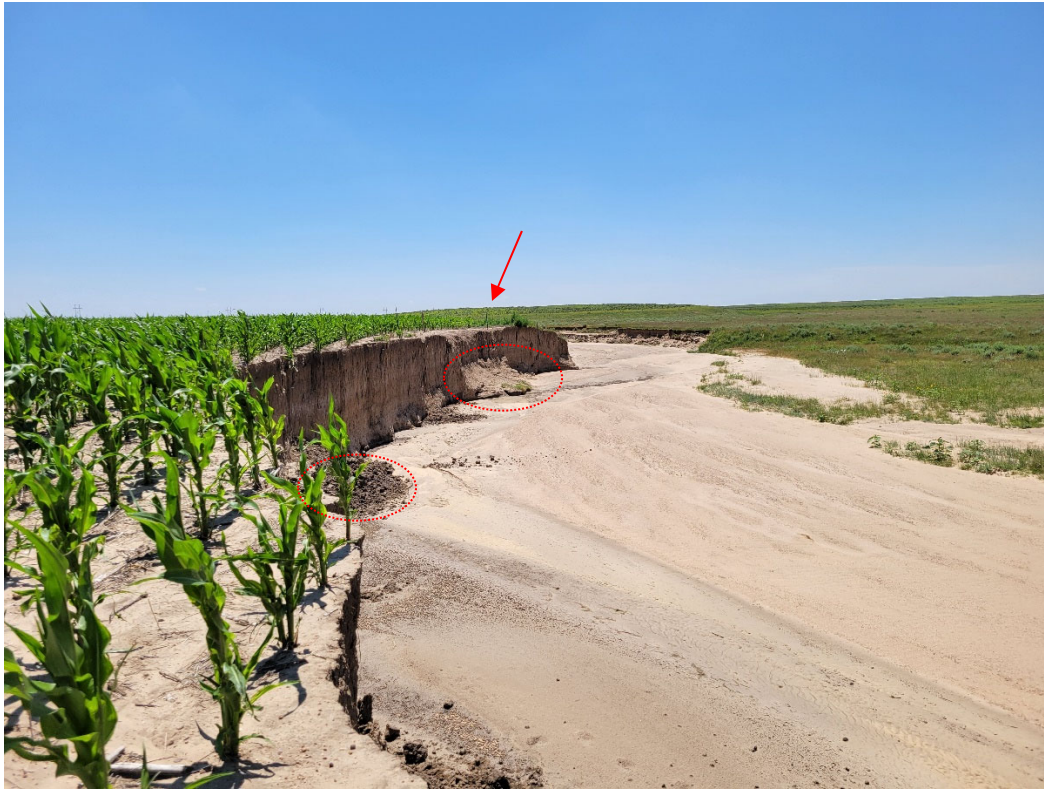
Photo 9: Big Timber Creek from the northeastern permit boundary. Slumping and erosion is noted here. Arrow points to the permit boundary marker on the edge of the creek.