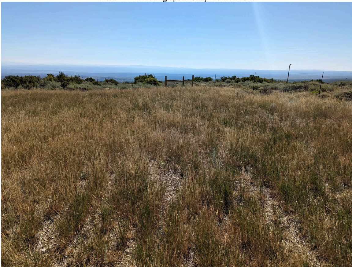
Phot Two: overview of established grasses