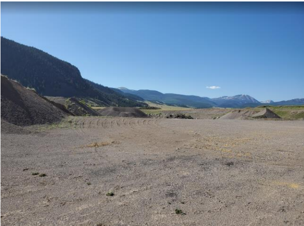
View to the southeast showing processing area on the pit floor.