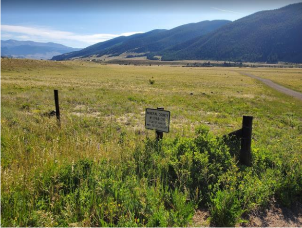
View to the east showing proper Mine ID signage posted at the entrance to the site.