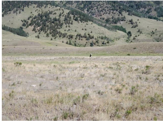
View to the west showing example of post that marks the permit boundary.