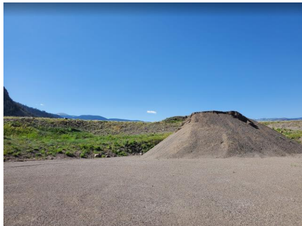
View to the southeast showing reclamation grade on pit slopes