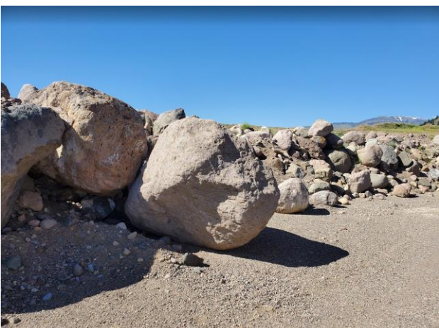
View to the west of oversized material. Boulders are as large as 3 foot diameter.