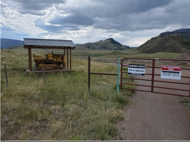
View to the west showing proper Mine ID signage posed at the entrance to the site.