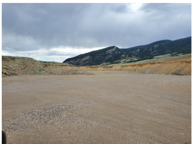
View to the north showing mining area and 15 foot highwall.