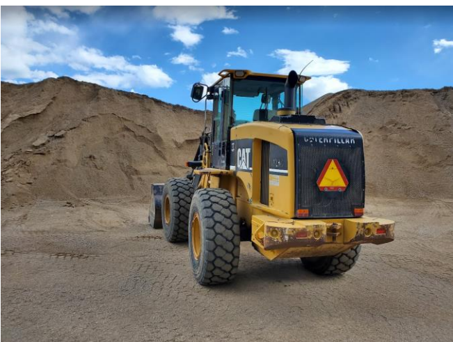
View to the south showing loader next to road base stockpile.