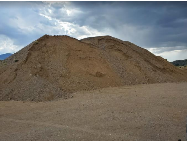
View to the south showing 2 inch product stockpile