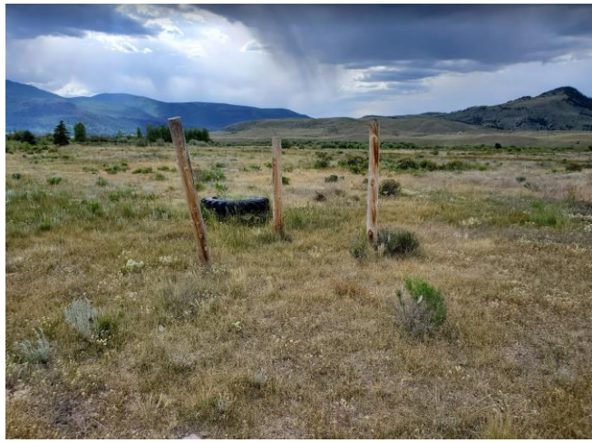
View to the southwest showing example of posts marking boundary.