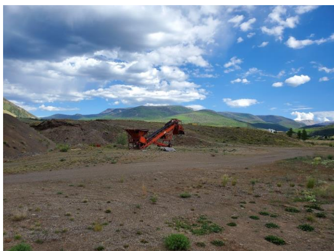
View to the south showing screening equipment on site.