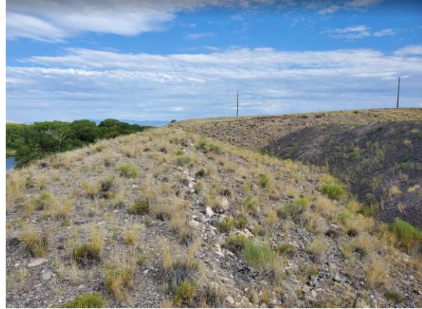
View to the northeast showing berm that marks permit boundary with t-posts in background.