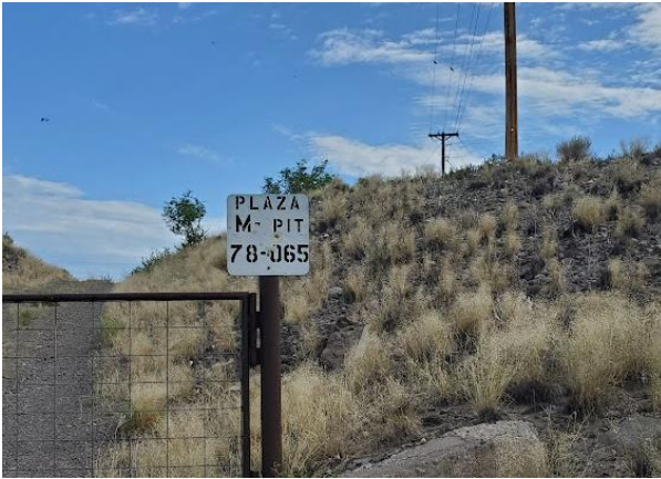
View to the north showing proper Mine ID signage posted at the entrance to the site.