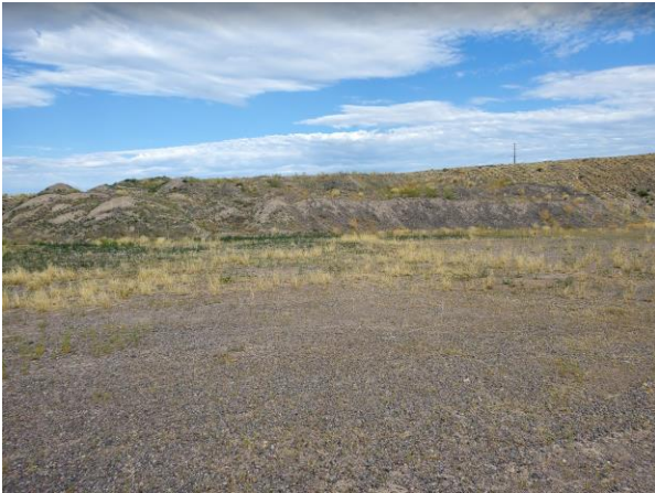
View to the northwest showing product stockpile protected by volunteer vegetation.