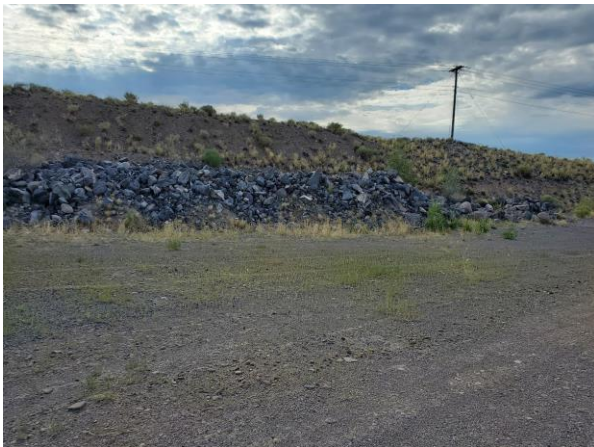
View to the east showing riprap stockpile.