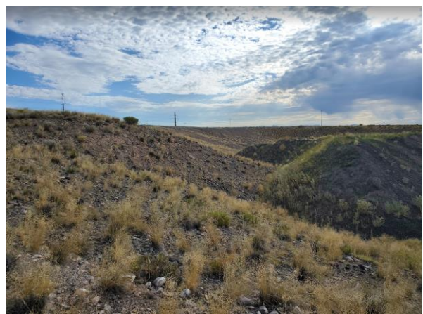
View to the east showing northern embankment of the pit with multiple product stockpiles.