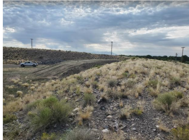
View to the east showing topsoil stockpile at end of berm. Stockpile is protected by vegetation.