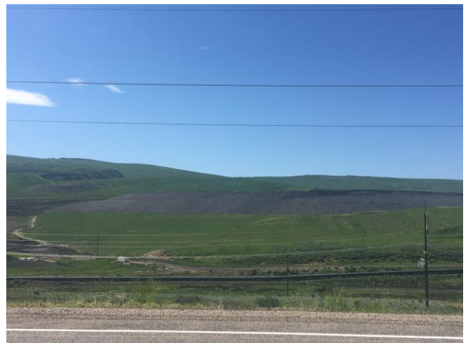
June 30, 2023- Benches on East Side of Refuse Pile