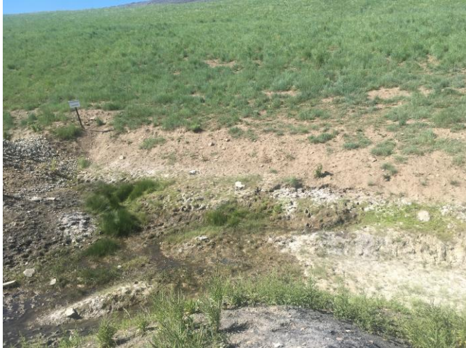
June 30, 2023-Drain Outlet and Seepage Area