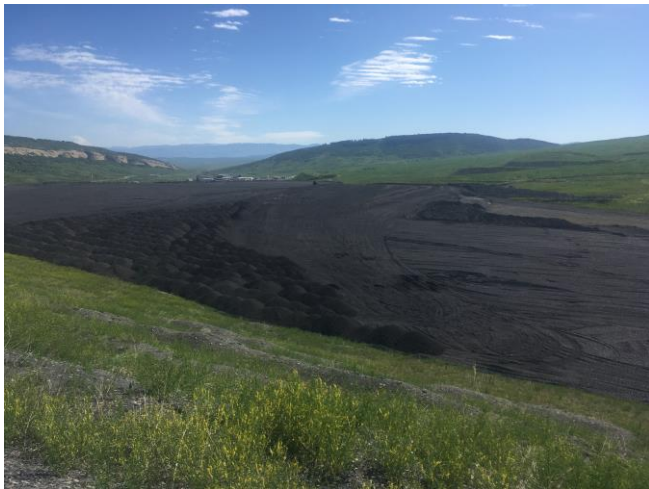
June 30, 2023- Expansion Area from Areas 2, 3 and 4