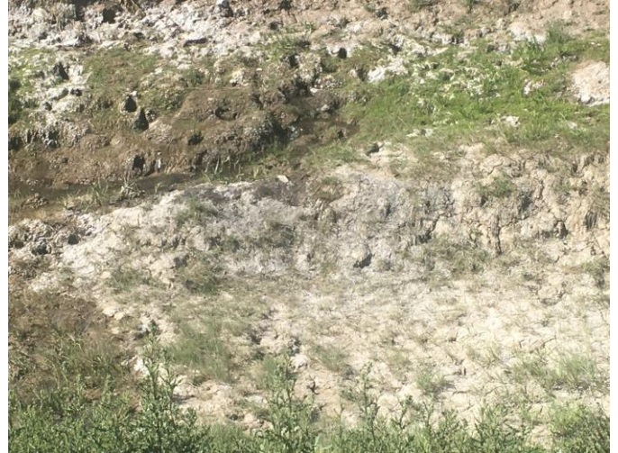
June 30, 2023-Seepage Area