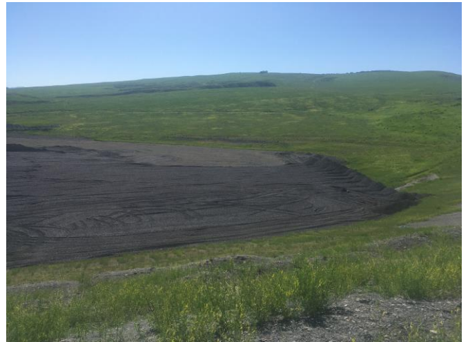
June 30, 2023- SW End of Drain in Expansion Area