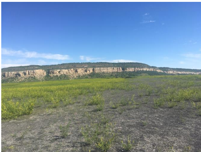
June 30, 2023- Areas 2, 3 and 4