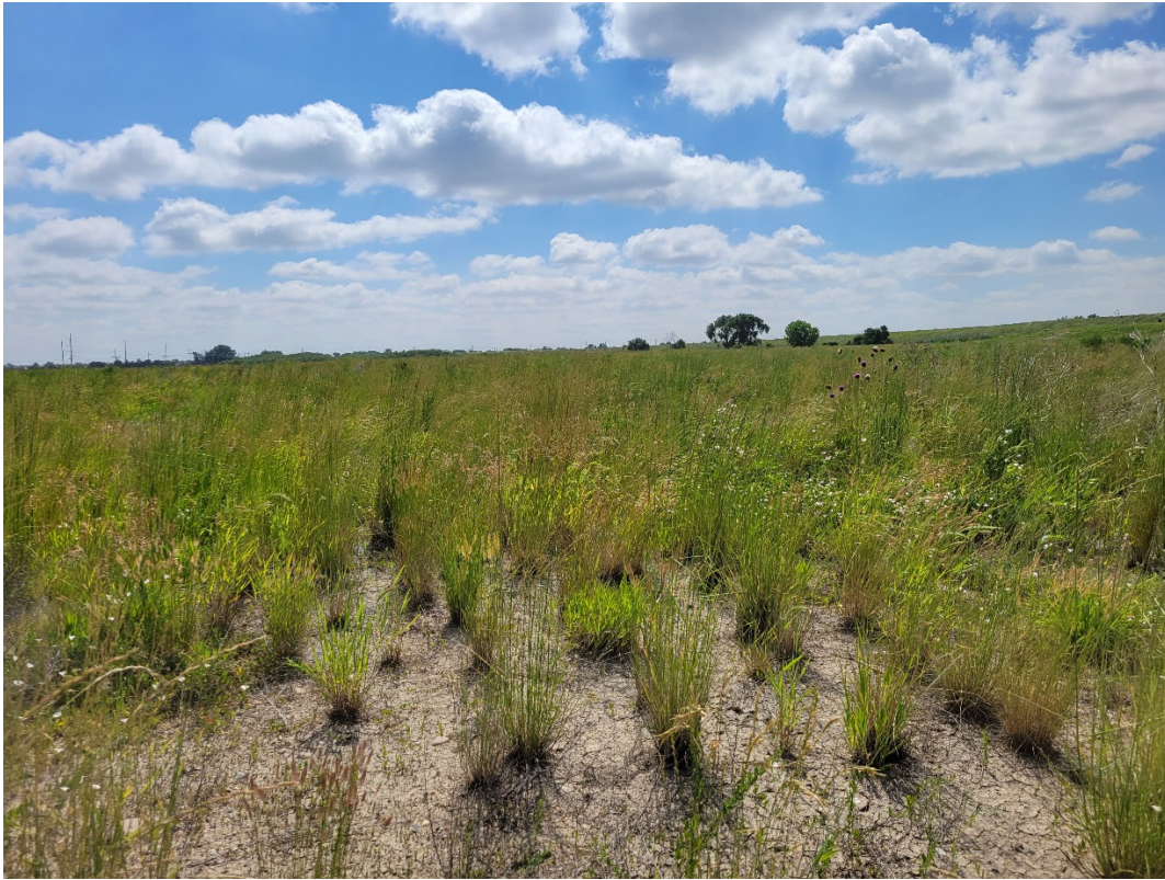
Photo 11: Northern parcel looking east at area with adequate revegetation.