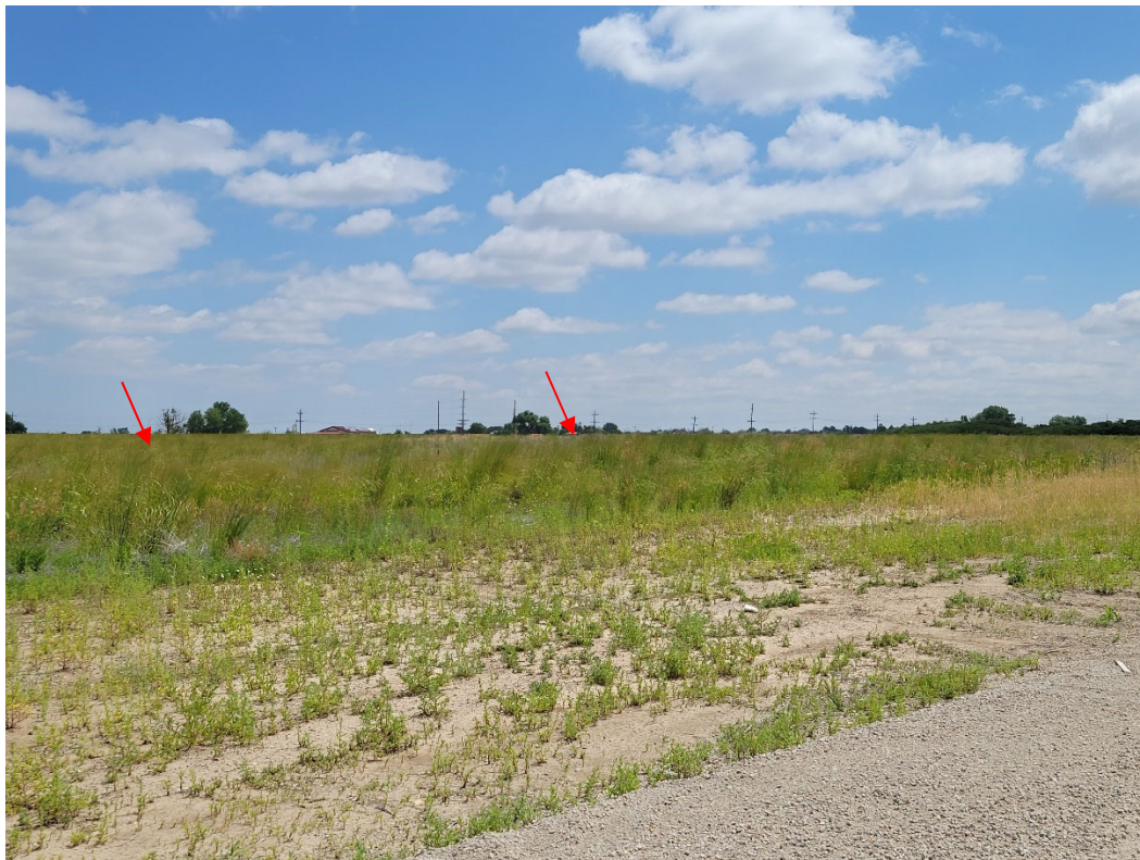
Photo 12: Northern parcel looking east from the eastern end of the new road. Arrows point to area of adequate revegetation.