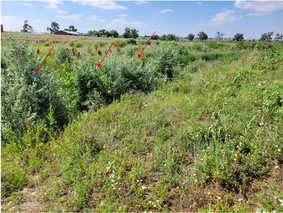
Photo 5: Looking south at the swale in the northern parcel. Arrows point to Russian olive trees. Bindweed and other invasive weeds observed along the banks.