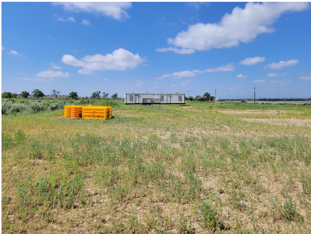
Photo 4: Looking south at mobile office and equipment stored along the western permit boundary.