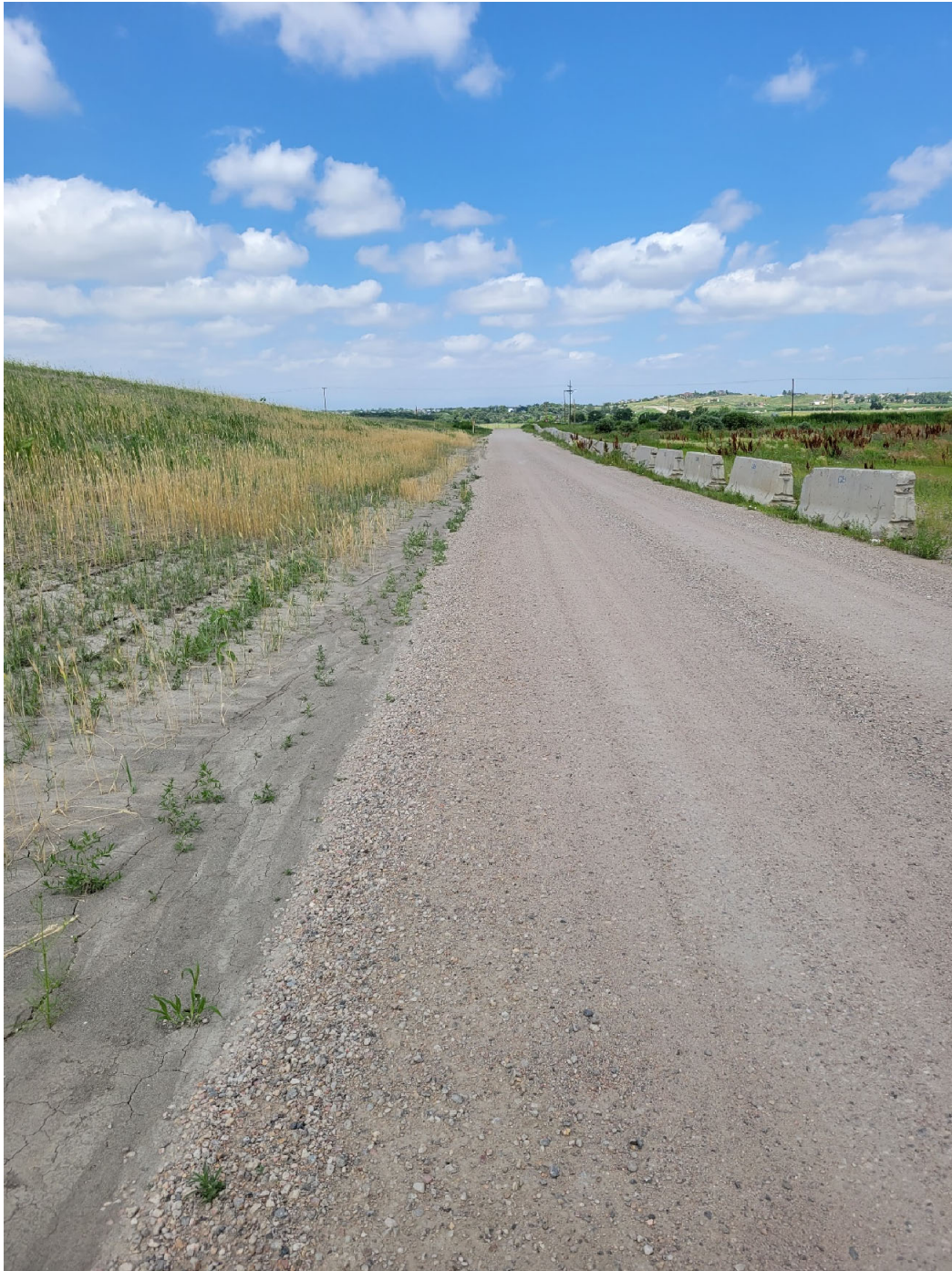
Photo 13: Newly constructed gravel road observed splitting the permit area. Operator submitted TR10 on August 14, 2023 to add the road to reclamation plan.