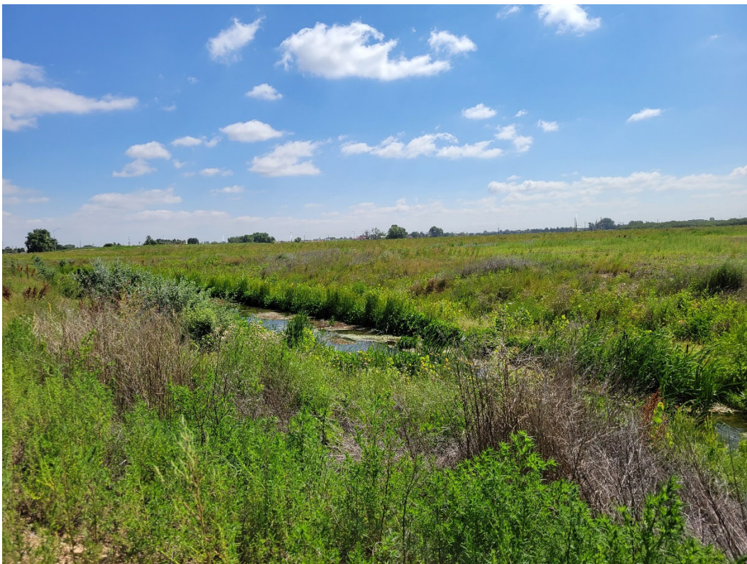
Photo 6: Looking north along the swale in the northern parcel. Vegetation is well established here. Recommend weed control and removal of Russian olive.