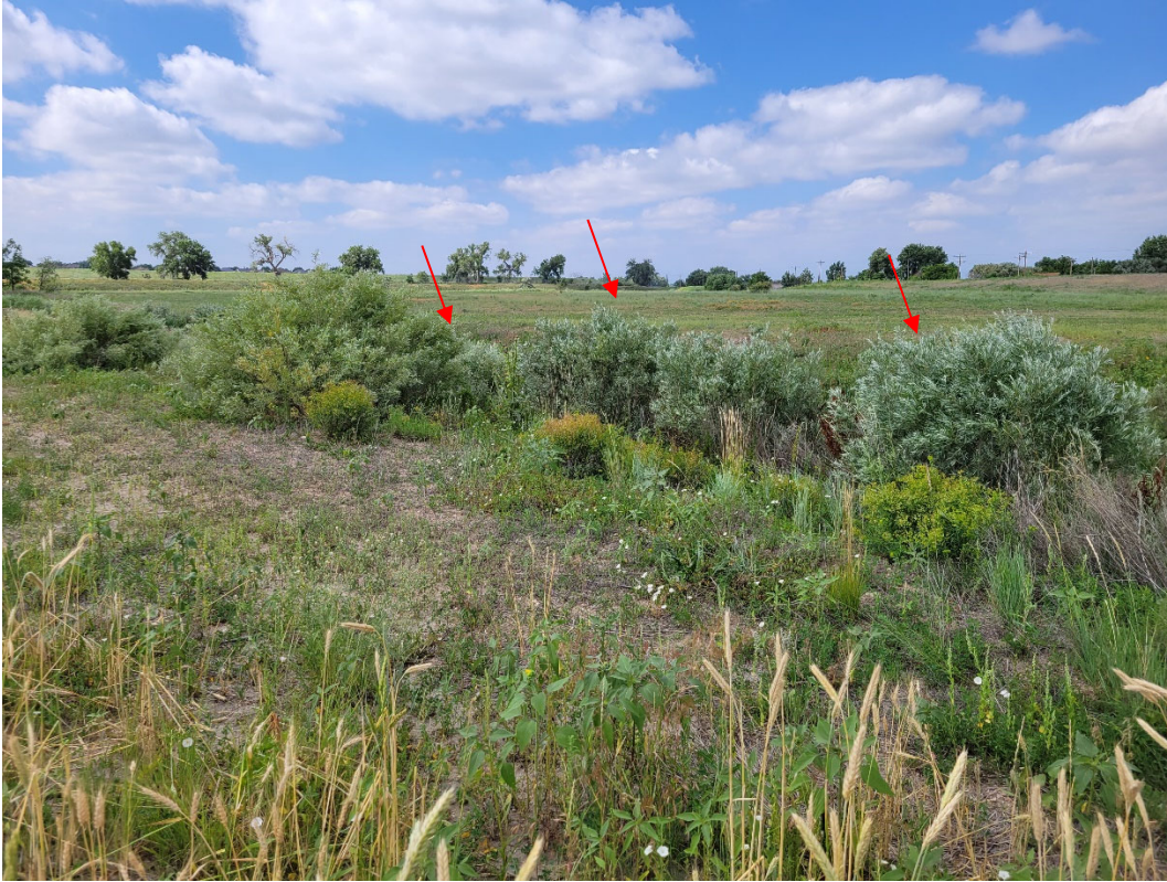
Photo 16: Looking southwest across southern permit area. Russian olive trees in swale.