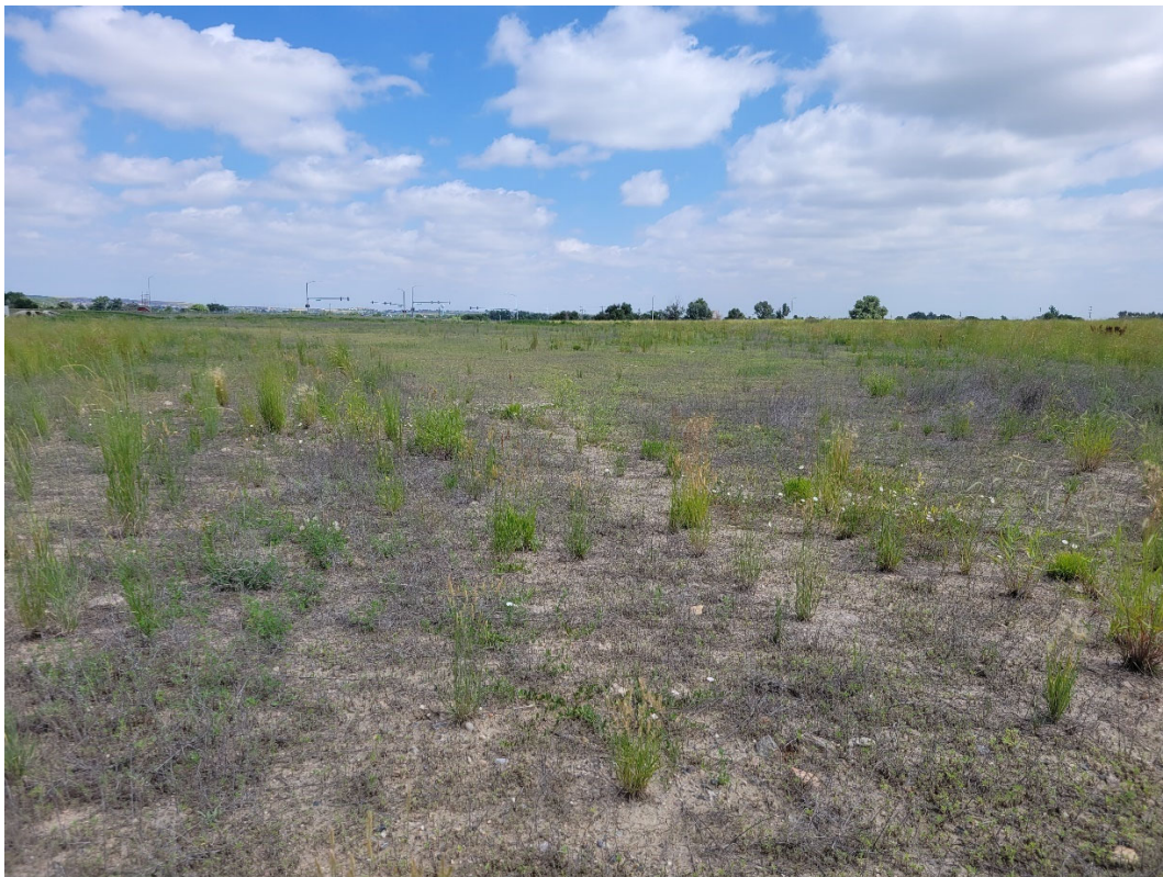
Photo 10: Northern parcel looking north from east side of the swale. Sparse vegetation and bare ground in this area.