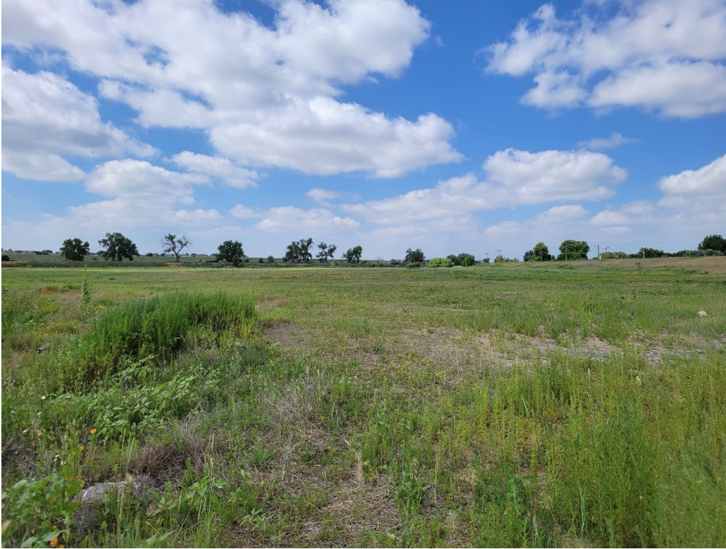
Photo 18: Looking southwest across pasture in southern permit area.