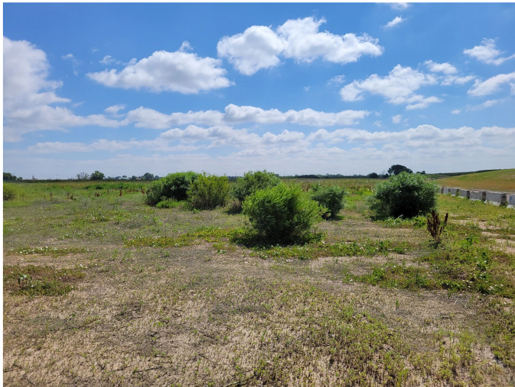
Photo 8: Northern parcel adjacent to new road that bisects the site. Weedy area with inadequate revegetation.