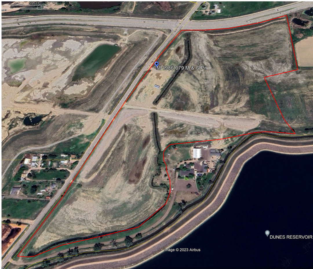
Google earth imagery 05/2023. Approximate permit boundary.