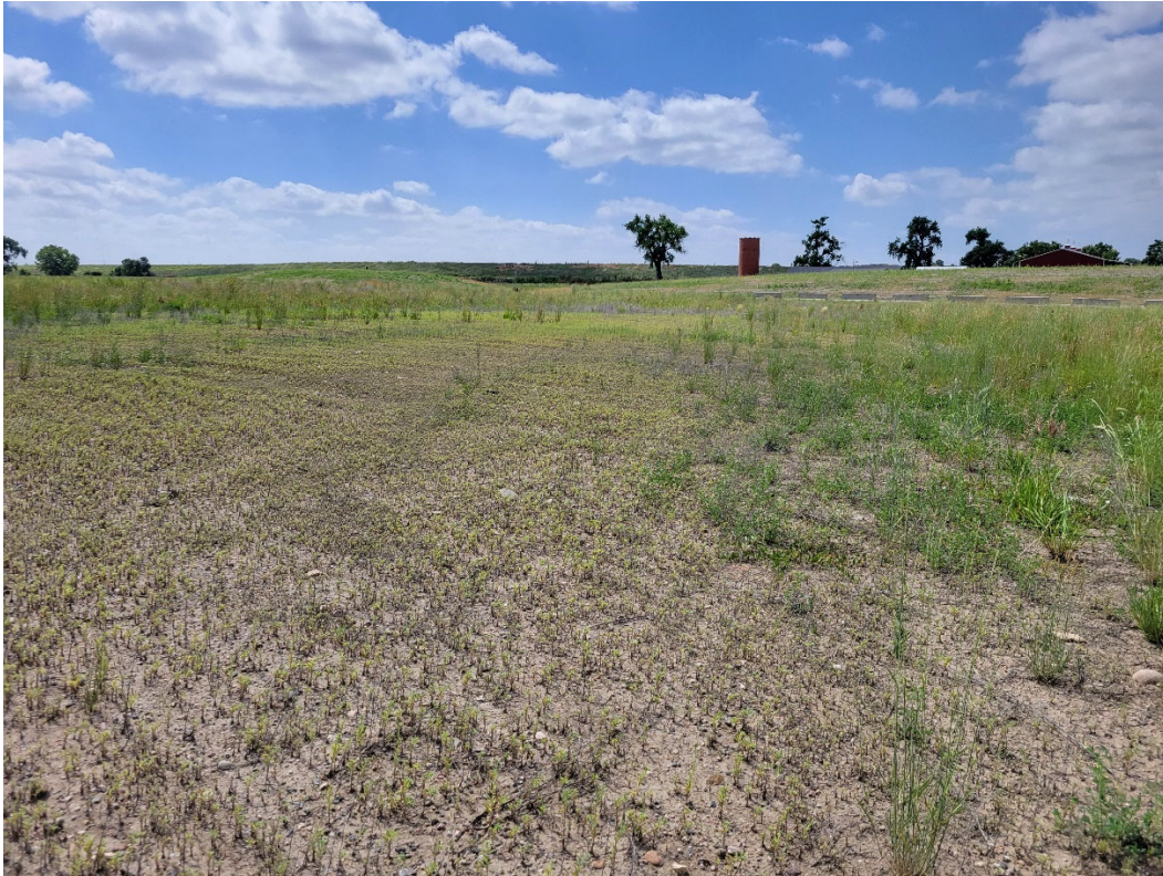
Photo 9: Northern parcel looking southeast at compacted ground with patchy vegetation.