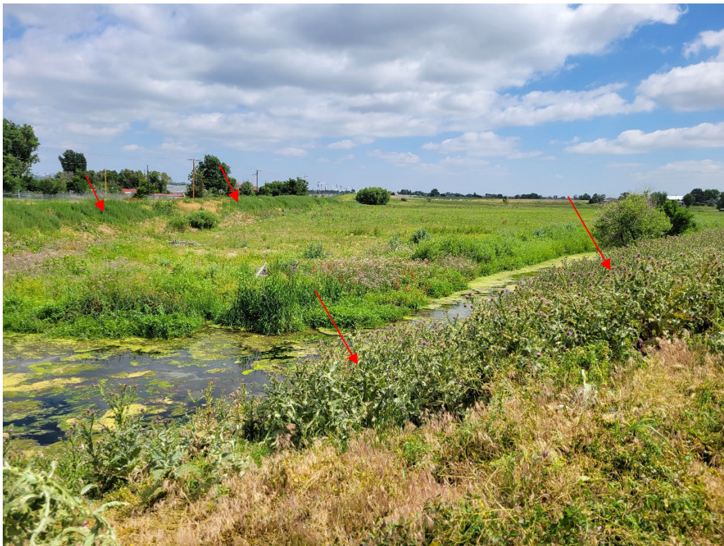
Photo 19: Looking north from the southwestern corner of the permit area. Vegetated berm runs along the Brighton Rd. Recommend weed control on berm and dense thistle patch growing along the swale in this area.