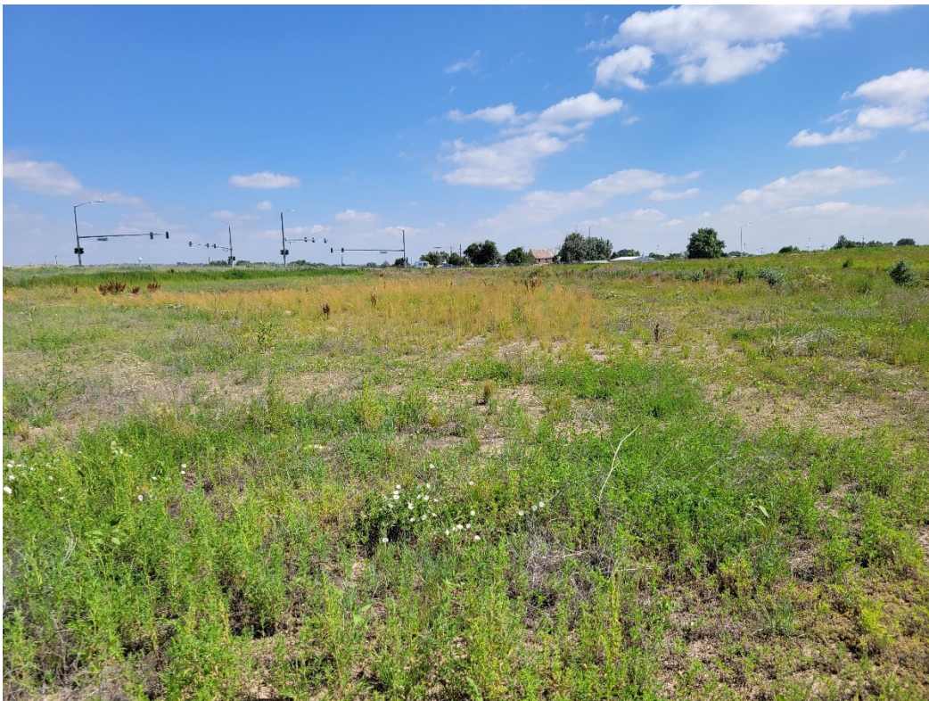
Photo 2: Looking north from entrance. Weeds and bare ground observed in this area.