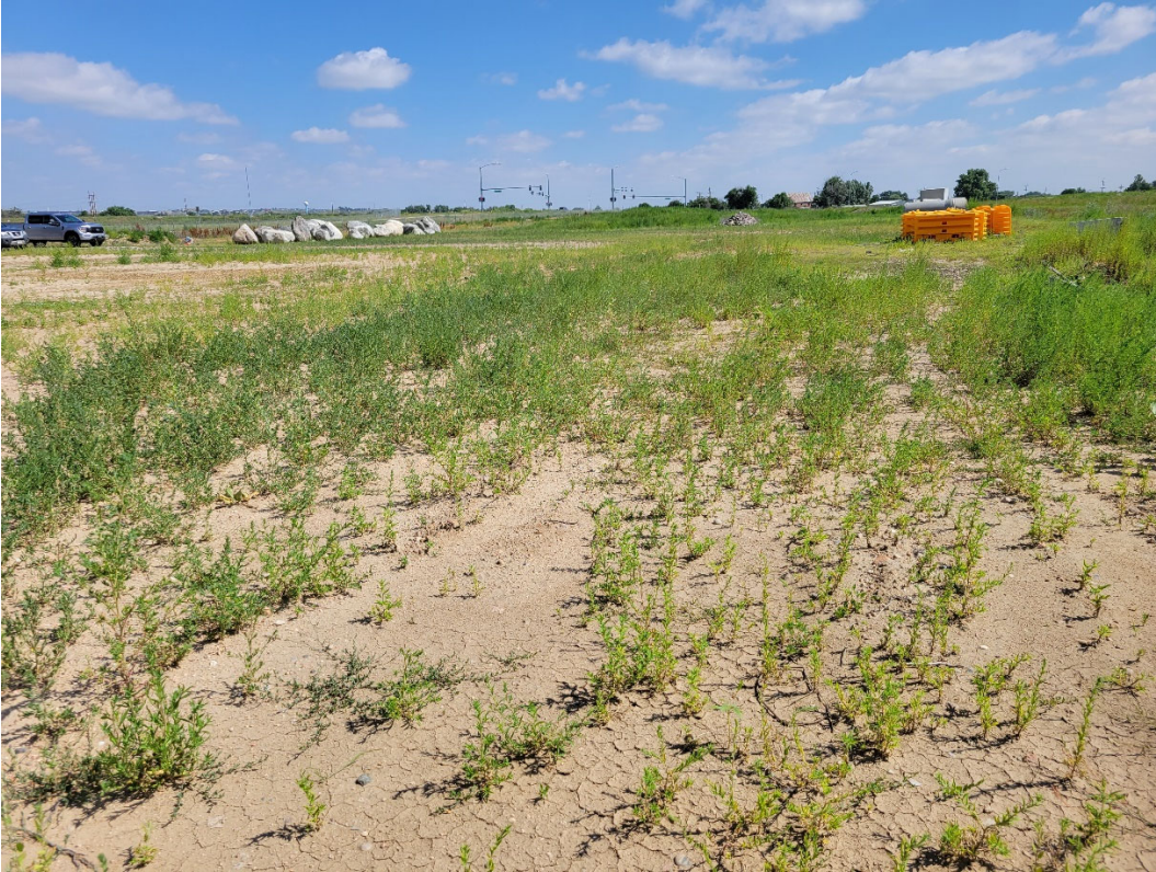
Photo 1: Looking northwest at the storage area near the front entrance area.