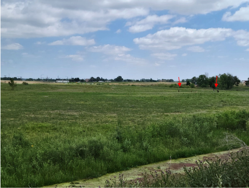
Photo 20: Looking north across the pasture. Arrows point to llamas grazing in the field.