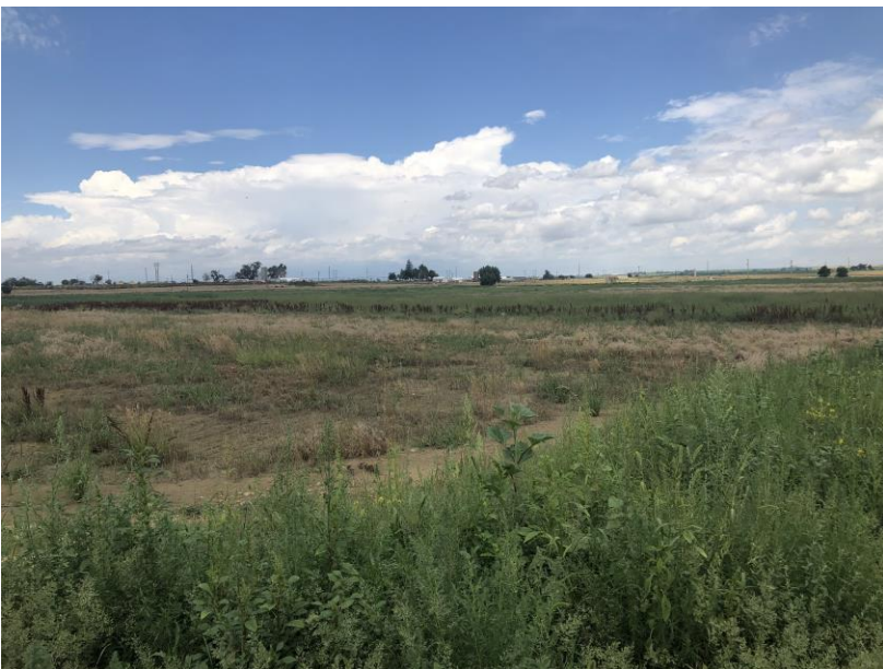
Southeast corner looking northwest