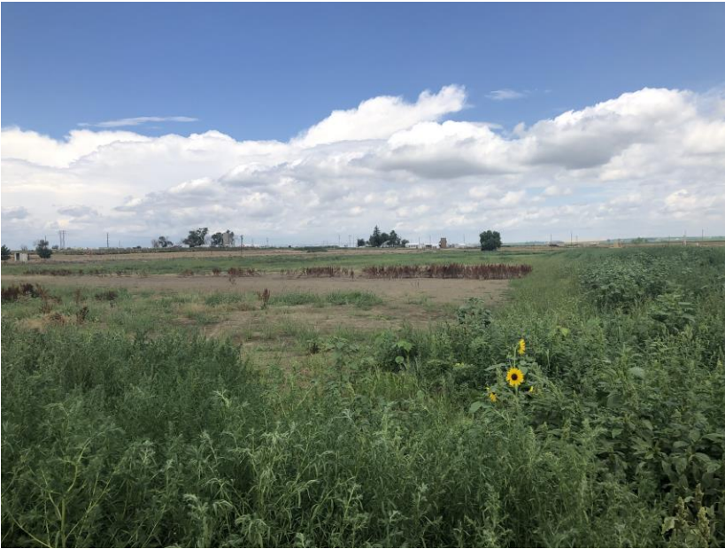
Large bare area near southwest corner