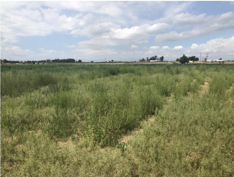
Northeast corner looking west