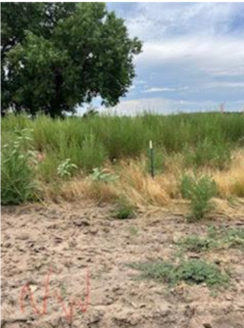
Boundary marker at northwest corner