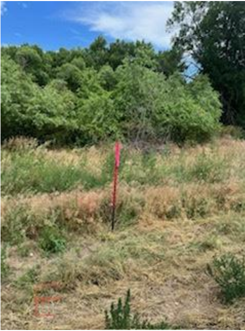
Boundary marker on east side