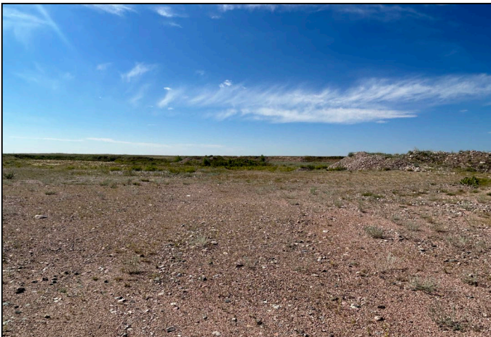
Photo 3 – Topsoil will need to be replaced and scarp at edge of existing excavation graded.