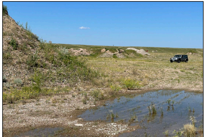
Photo 4 – Existing product stockpiles on site. Standing water due to recent heavy rainfall.