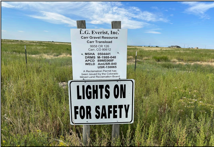
Photo 1 – Site identification sign posted at site entrance as required.