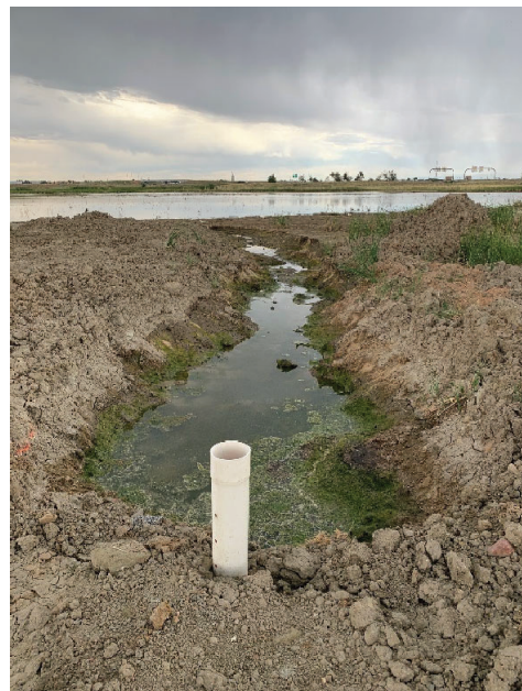
June 29, 2022

Unfortunately, toward the end of the summer surface water levels in the pit had risen (see photo). We believe that at least some rise in water level can be attributed to algae clogging the infiltration system from the pit to the sump. We are in the process of improving the infiltration system to help keep water flowing into the sump (see photo).