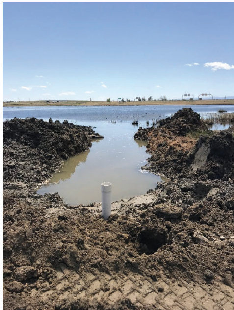
May 13, 2022

In 2022 we completed installation of approximately 1000 feet of 8" diameter perforated pipe to convey the water to the north which is the natural groundwater gradient. We completed installation of a sump at the north end of the pit. This sump is constructed in native granular material which allows water to infiltrate and flow along the natural groundwater gradient. After installation of the sump the surface water level in the pit dropped (see photos).