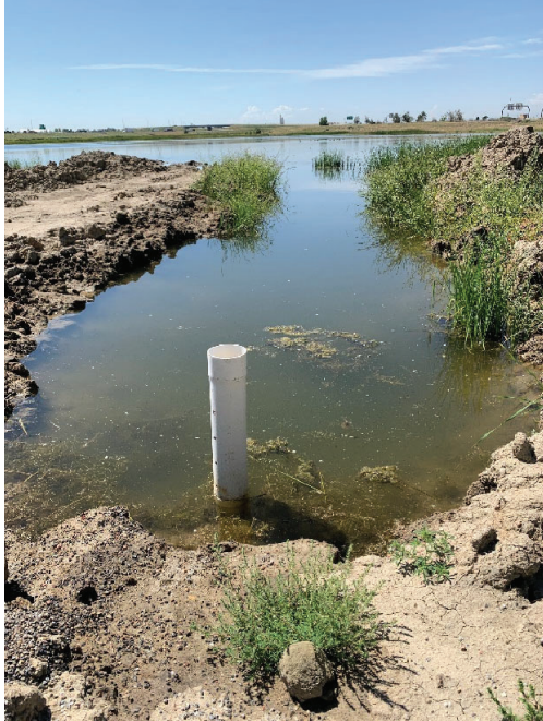
August 25, 2022