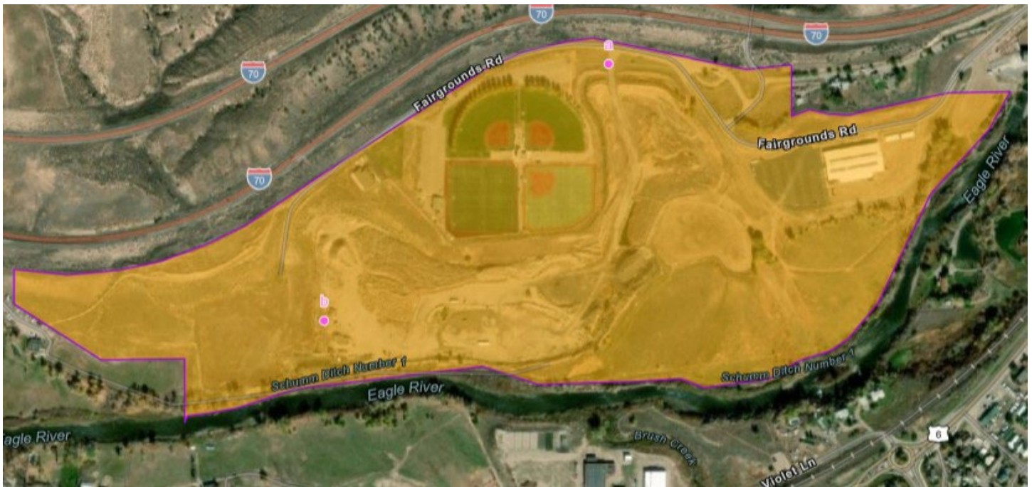
Figure 1: Inspection map

The mine ID sign was in place at the site entrance. Most of the site was fenced and secured behind a locked gate. Some land within the permit boundary (Fairgrounds Road, the baseball fields and the parking area to the east) was outside of the secured fenced area and was accessible by the public.