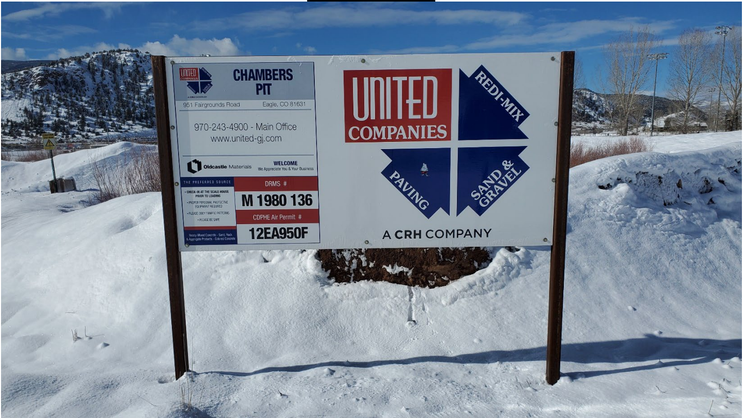
Figure 2: Mine ID sign (a)