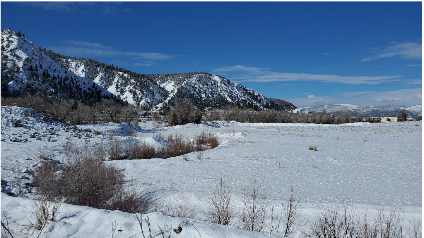
Figure 3: Reclaimed land at the west of the permit area (b)