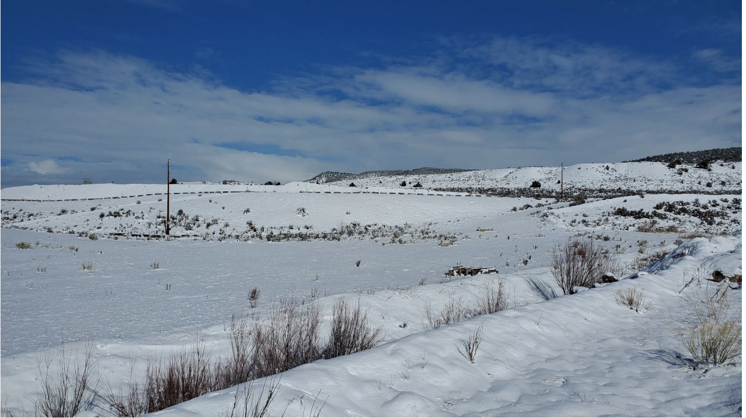
Figure 4: View to the north west (b)