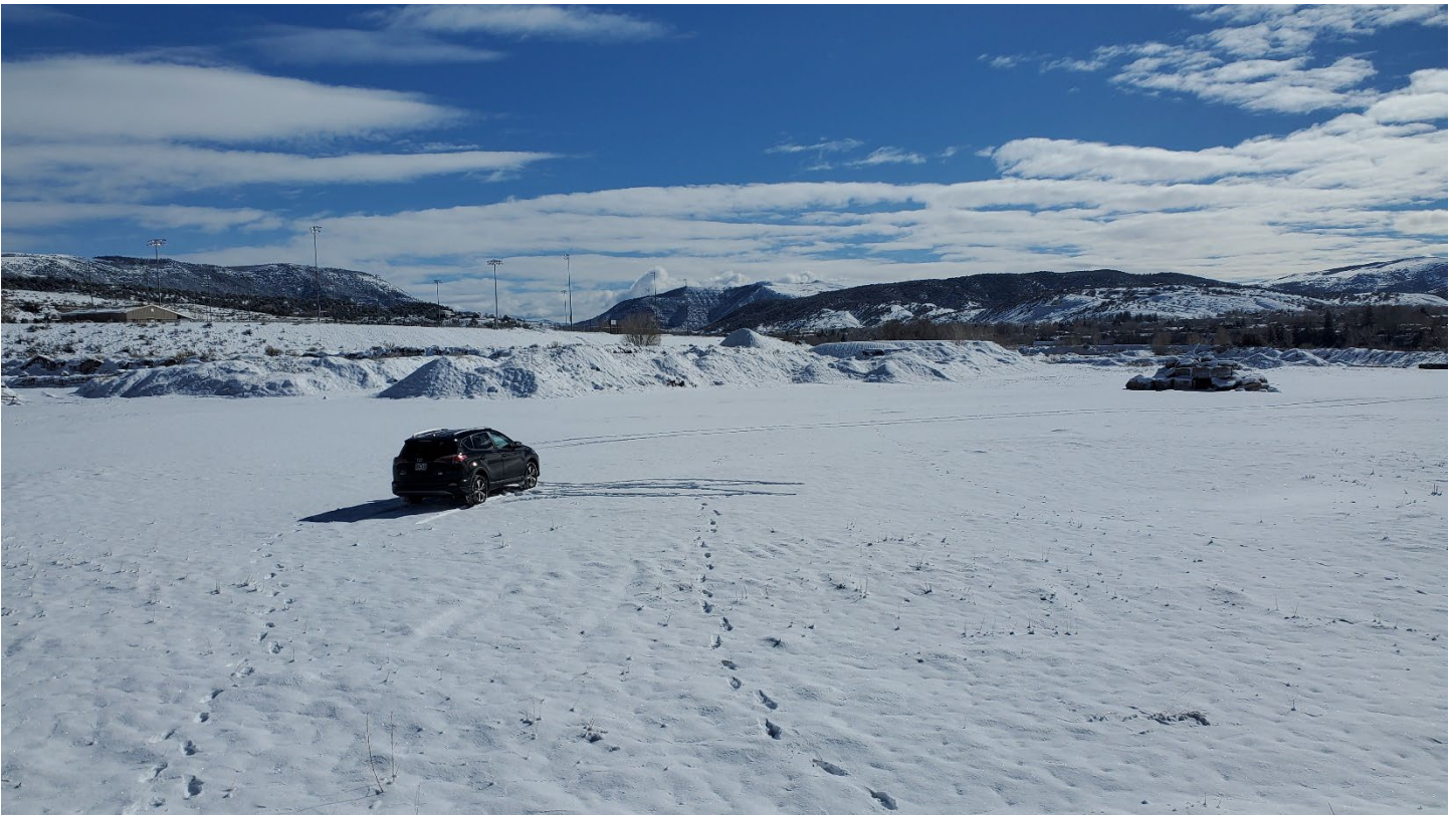
Figure 5: View to the north east, showing baseball fields (b)