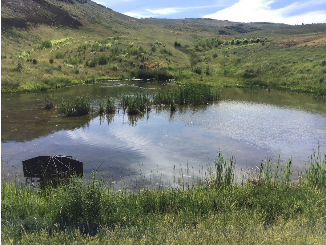
Photo 9: Pond 12 looking toward hillside (east), where reclamation is not yet bond released.

Number of Partial Inspection this Fiscal Year: 0