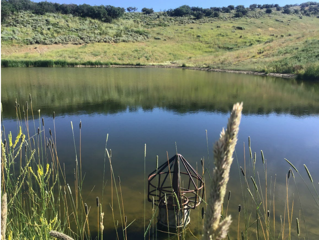
Photo 7: Reclamation overview Pond 13 discharge structure looking east.