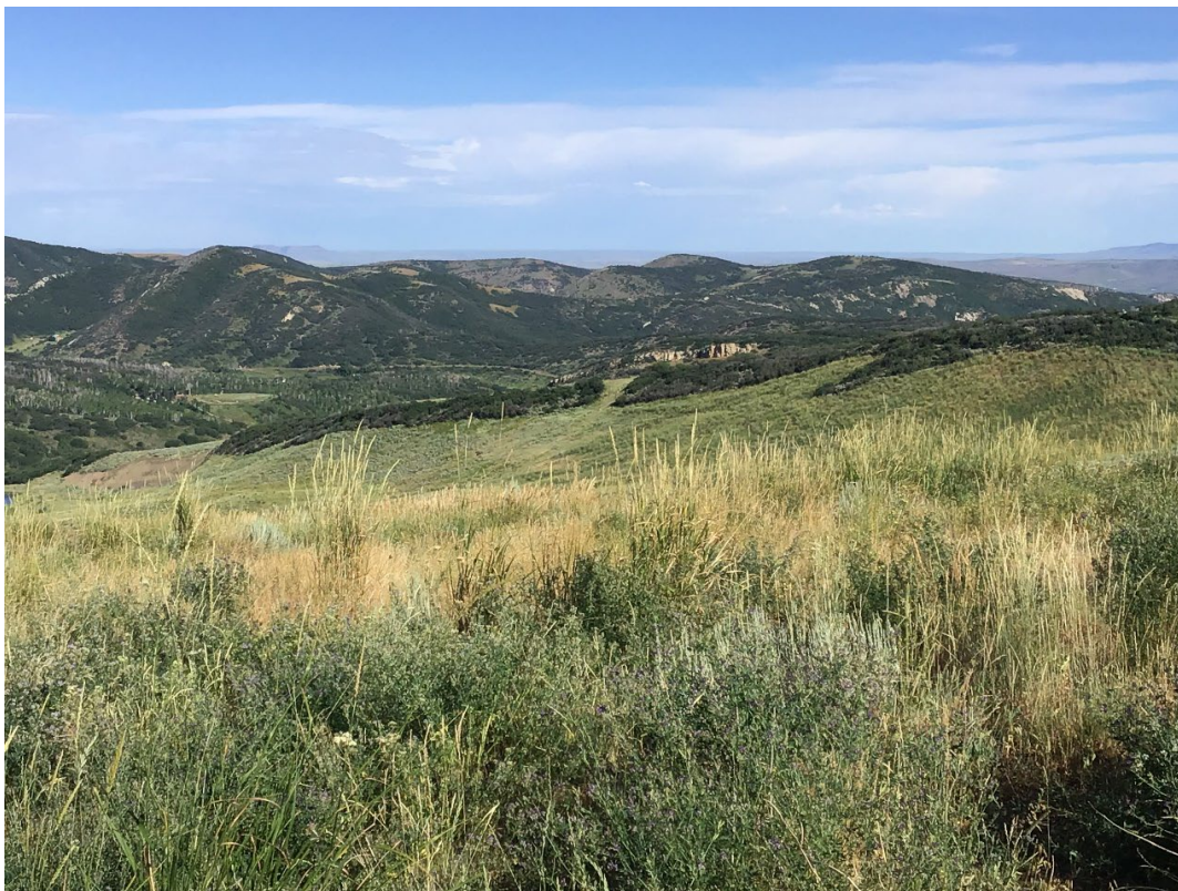
Photo 4: Slope in the distance above Pond 12 waiting final bond release in 2024.

Number of Partial Inspection this Fiscal Year: 0