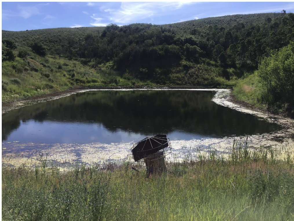
Photo 8: Reclamation overview Pond 14 discharge structure and algal ring around perimeter of water surface, looking east.

Number of Partial Inspection this Fiscal Year: 0