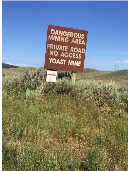
Photo 1: Mine identification sign at the site entrance off the Twenty Mile Road