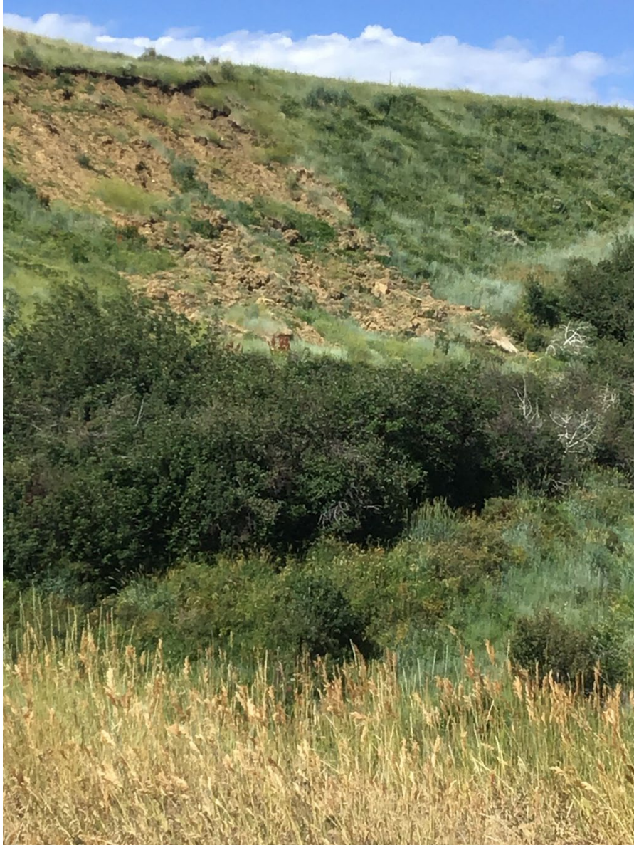
Photo 3: New slide of approximately 1/3 of an acre (Spring 2023), downstream of Pond 6.

Number of Partial Inspection this Fiscal Year: 0