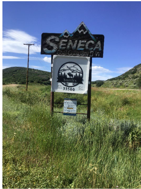
Photo 1: Mine identification sign at the main site entrance off the County Road.