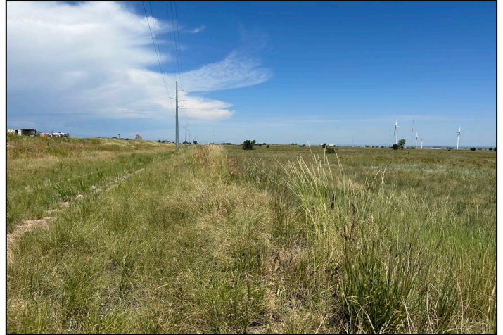
Photo 2 – Representative photo of reclaimed 2-track access road along west side of permit area.