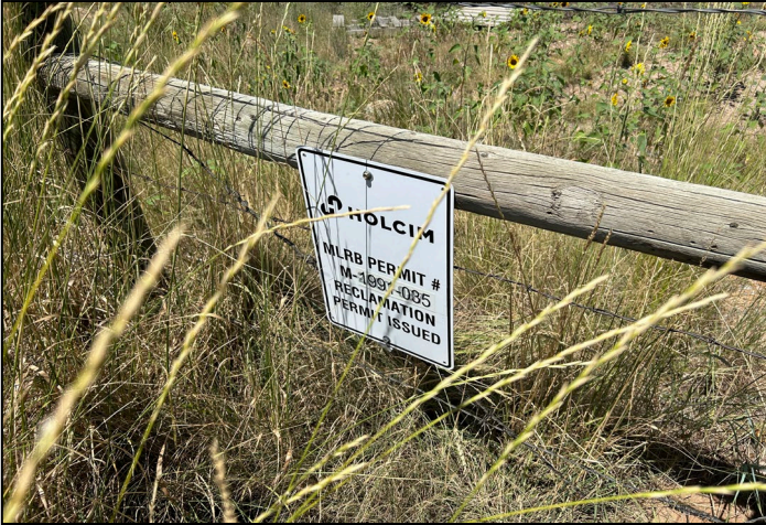
Photo 1 – Site identification sign at site entrance. This can be removed when release is finalized.