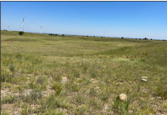
Photo 3 – Reclaimed mine cell depression looking NE from access path