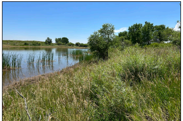
Photo 6 – Same small area of pre-1981 groundwater exposure in north central area of permit looking South.