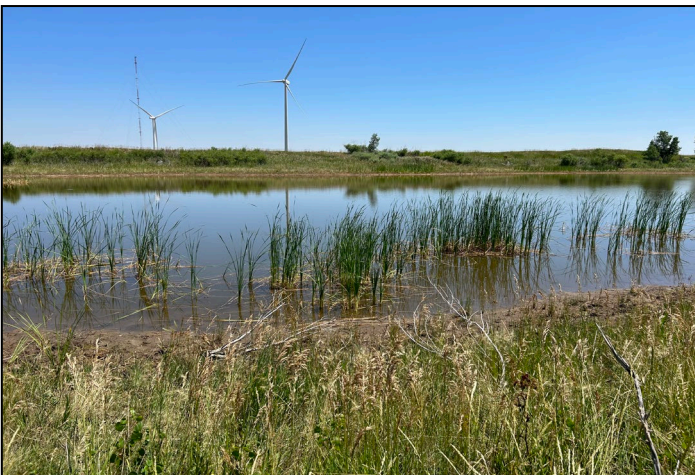
Photo 5 – Small area of pre-1981 groundwater exposure in north central area of permit looking SE.