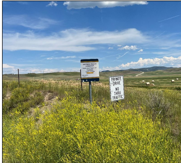
Photo 2: Mine signage posted at the western edge of the site's haul road which intersects with County Road 53.