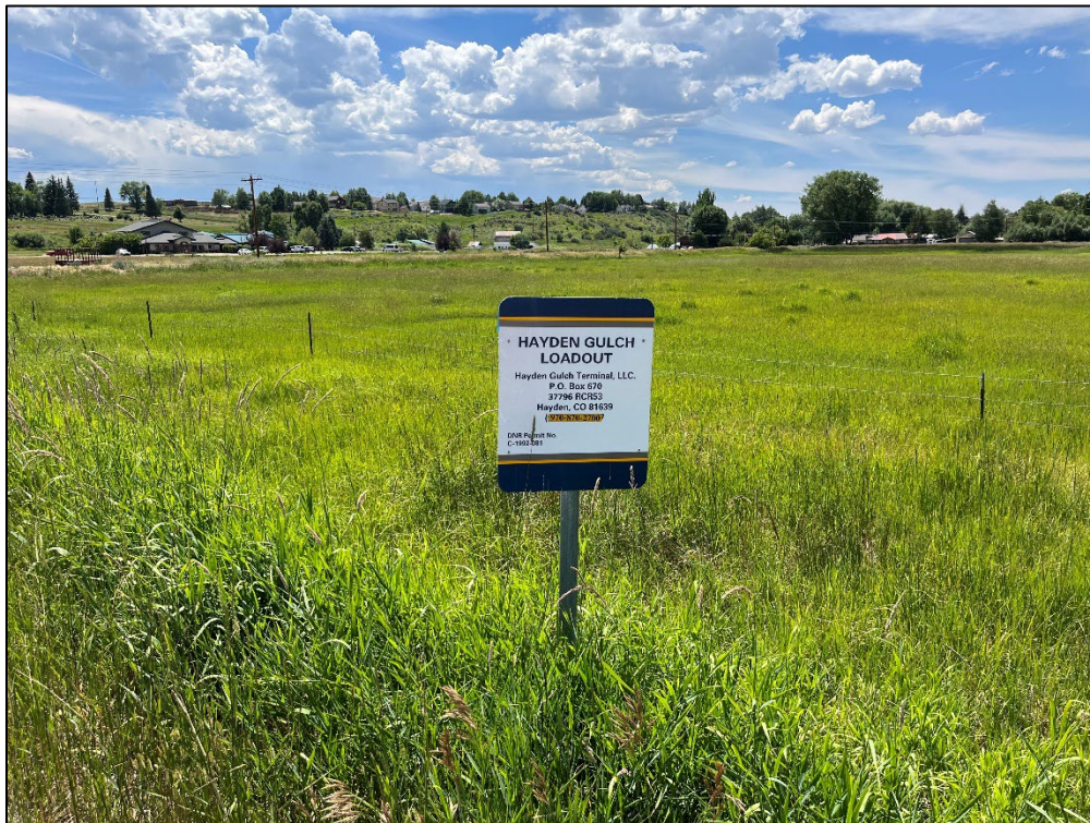
Photo 1: Mine signage located at access road to the site at the intersection of Highway 40 and Hawthorne St.

Number of Partial Inspection this Fiscal Year: 1