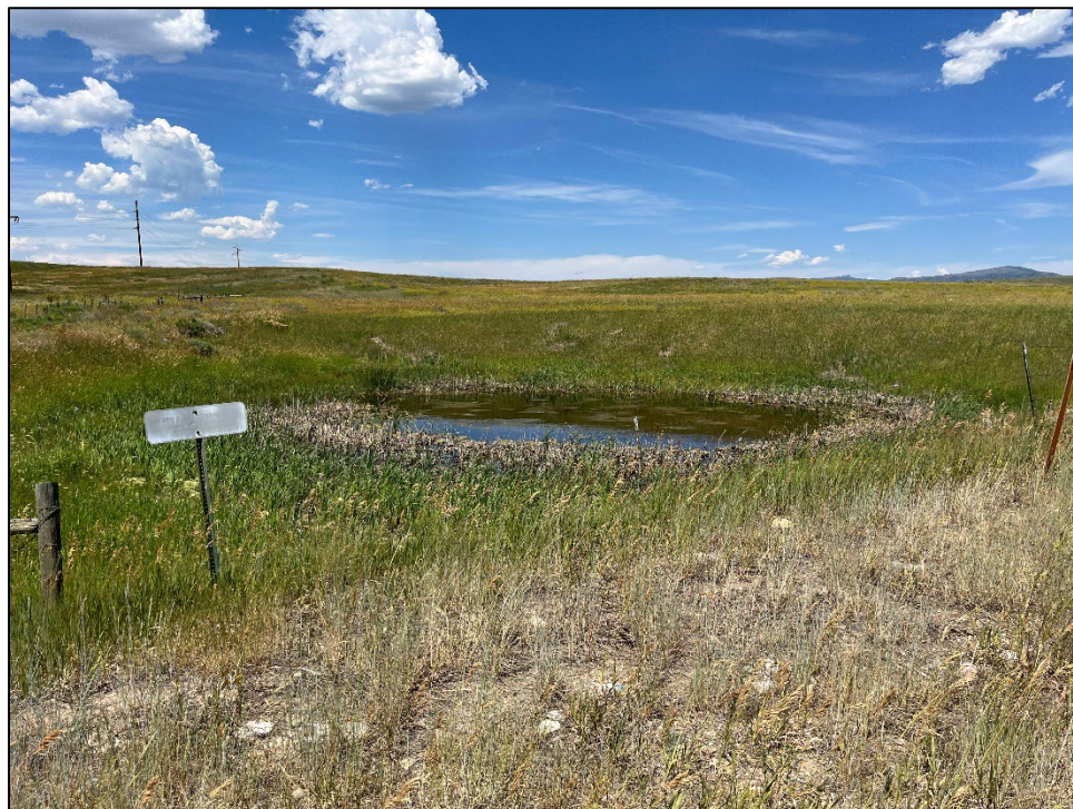
Photo 4: Truck Loop Pond 001 located on the western side of the site's previously released acreage.