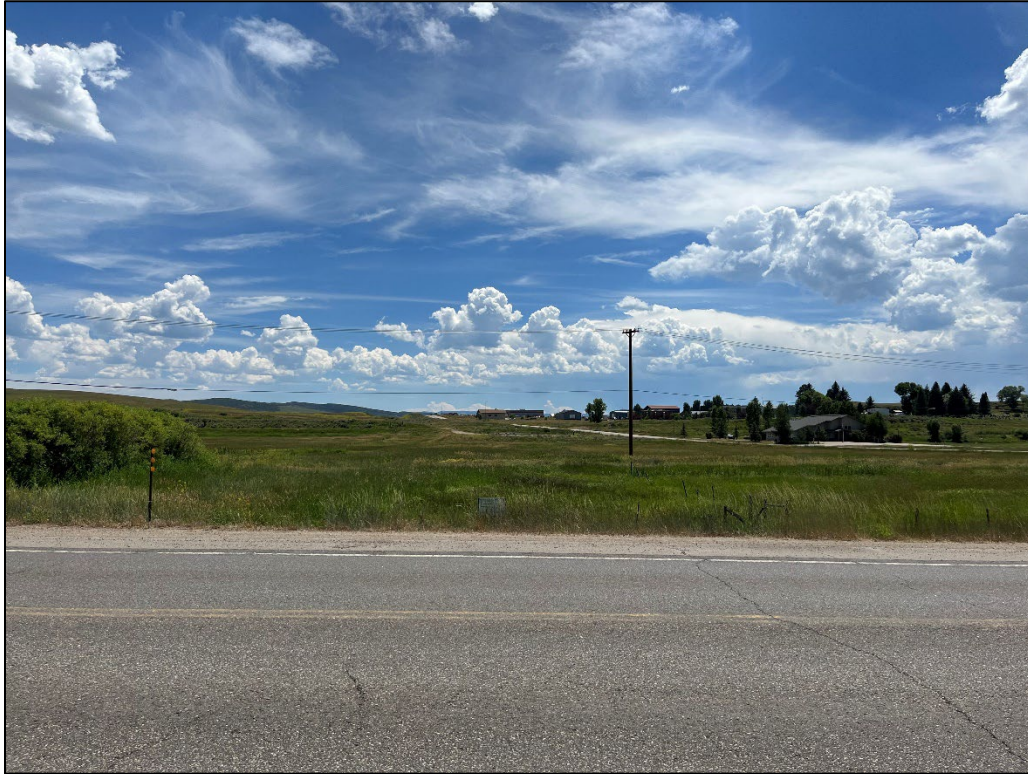
Photo 6: Unreleased agricultural acreage on the south side of Hwy 40.