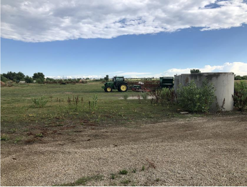
Equipment storage in Area 3 (northeast portion of site)