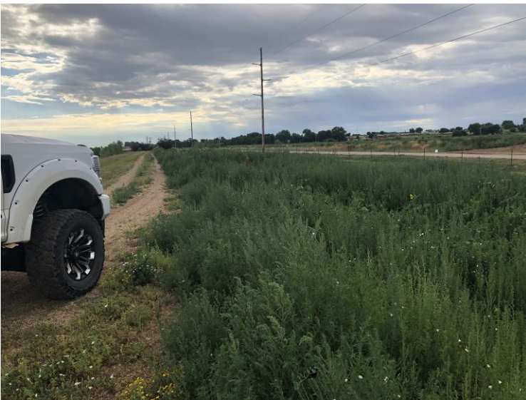
Area 4 (southeast portion of site) – kochia on south side of site