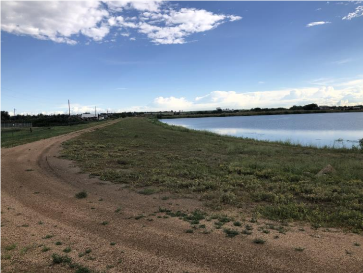
Pond in Area 4 (southeast portion of site) – looking north from southeast corner