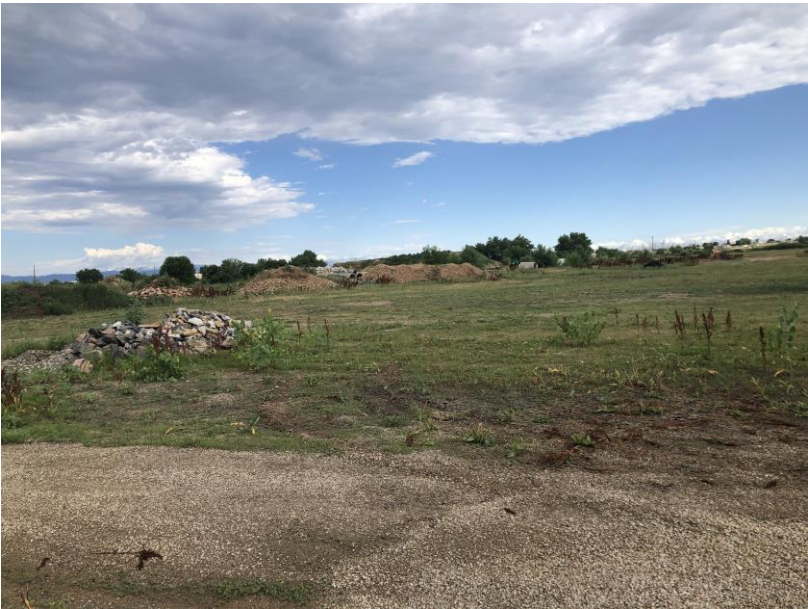
Stockpiles in Area 3 (northeast portion of site)