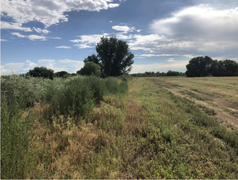
Vegetation buffer (left side of photo) next to Area 3