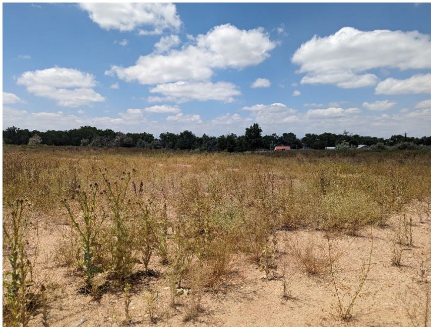
Photo 2. Looking southwest across the permit area.