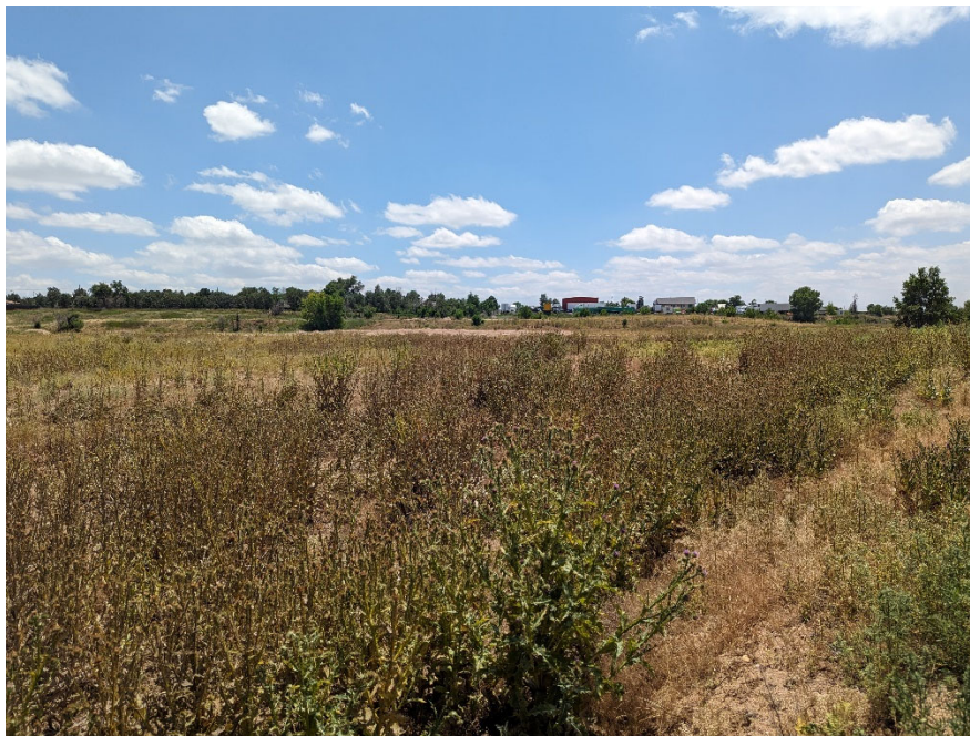
Photo 4. Treated dense stand of thistle on a berm along the western edge of the permit area.