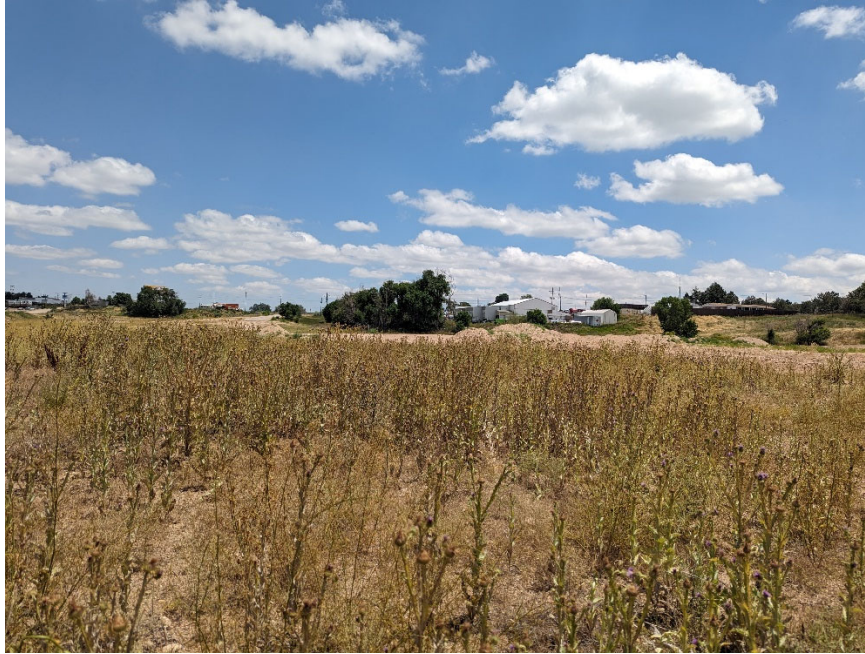
Photo 1. Looking southeast across the permit area. Weeds are wilting and brown, appear treated across the site.