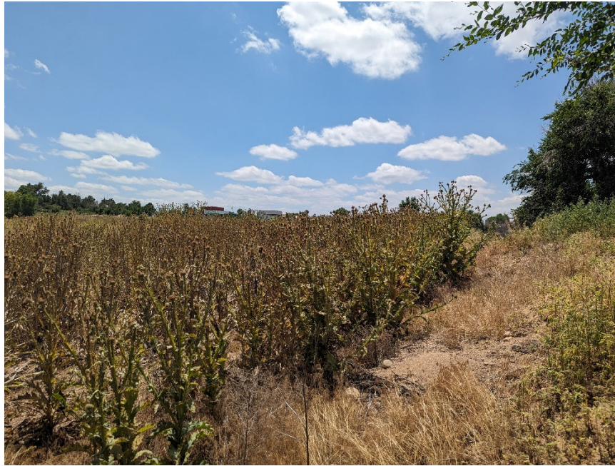
Photo 3. Dense stand of thistle in the western corner of the permit area, browning leaves, wilting.