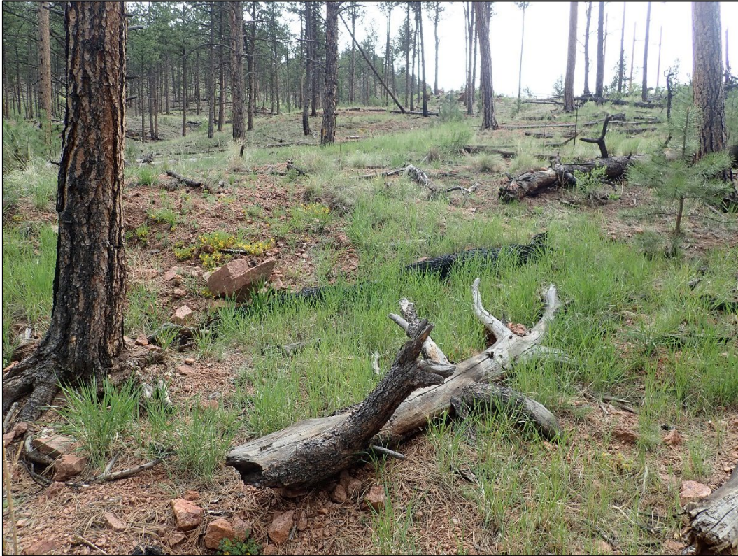
Photo 1. Reclaimed dig area in the northeast part of the permit; looking south.