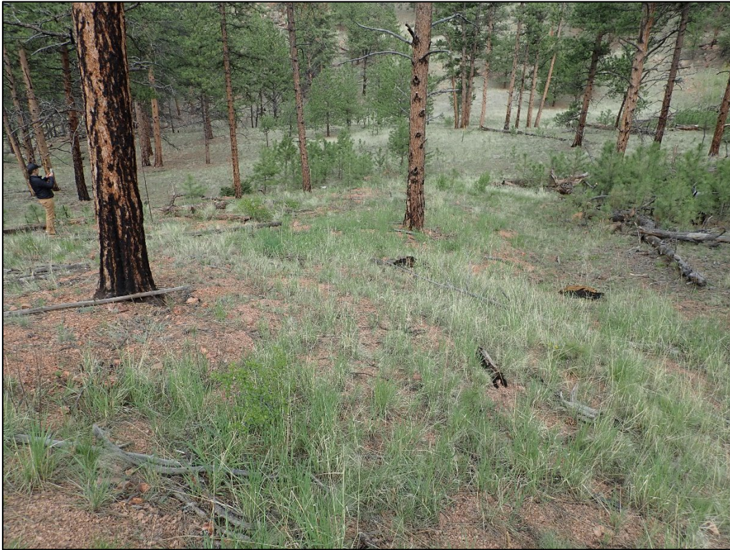
Photo 3. Reclaimed dig area in the northeast part of the permit; looking northeast.