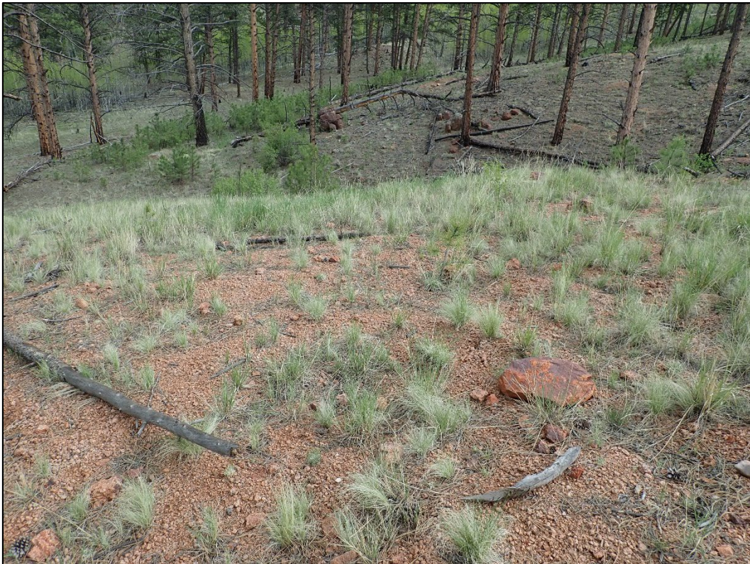
Photo 4. Reclaimed dig area in the northeast part of the permit; looking east.