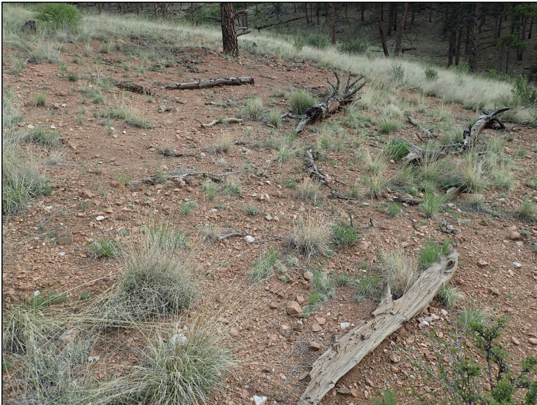
Photo 6. Reclaimed dig area in the southwest part of the permit; looking southeast.