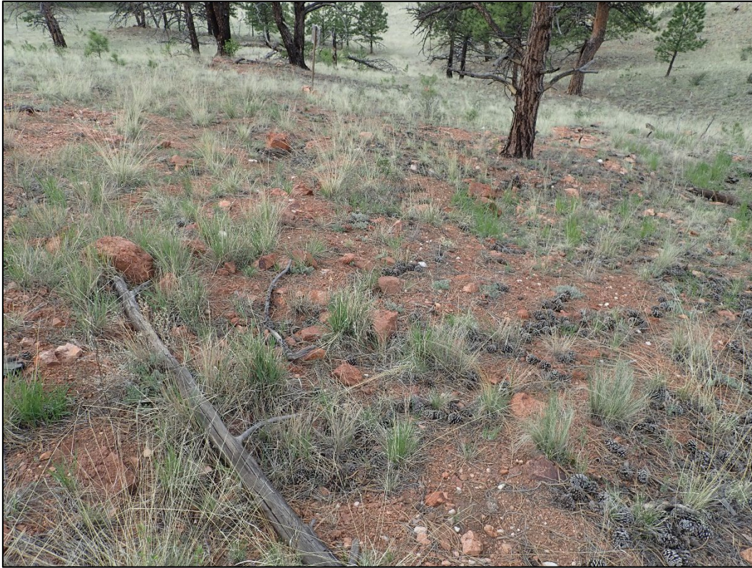
Photo 7. Reclaimed dig area in the southwest part of the permit; looking west.