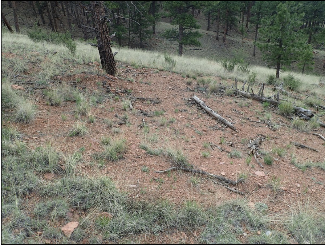
Photo 5. Reclaimed dig area in the southwest part of the permit; looking south.