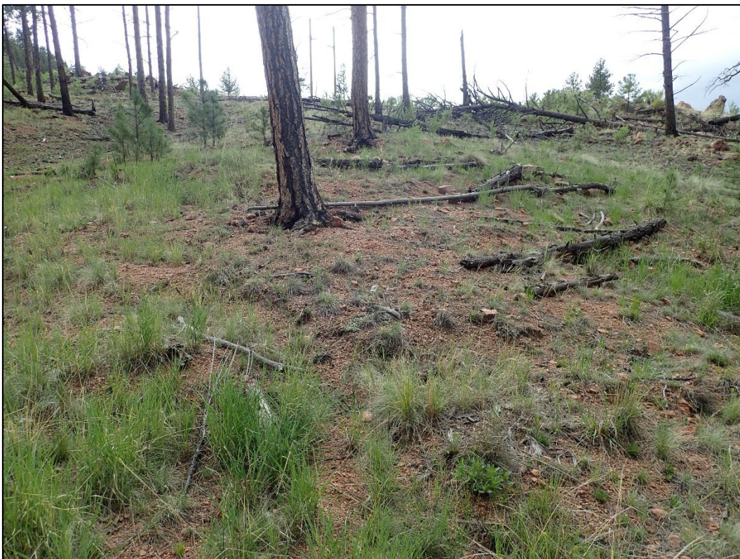
Photo 2. Reclaimed dig area in the northeast part of the permit; looking south.