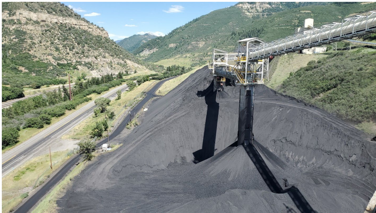
Figure 4: Clean coal stockpile pad from silo. Fines pile is to the rear.

Number of Partial Inspection this Fiscal Year: 1