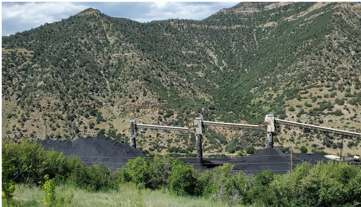
Figure 2: Run-of-mine stockpile