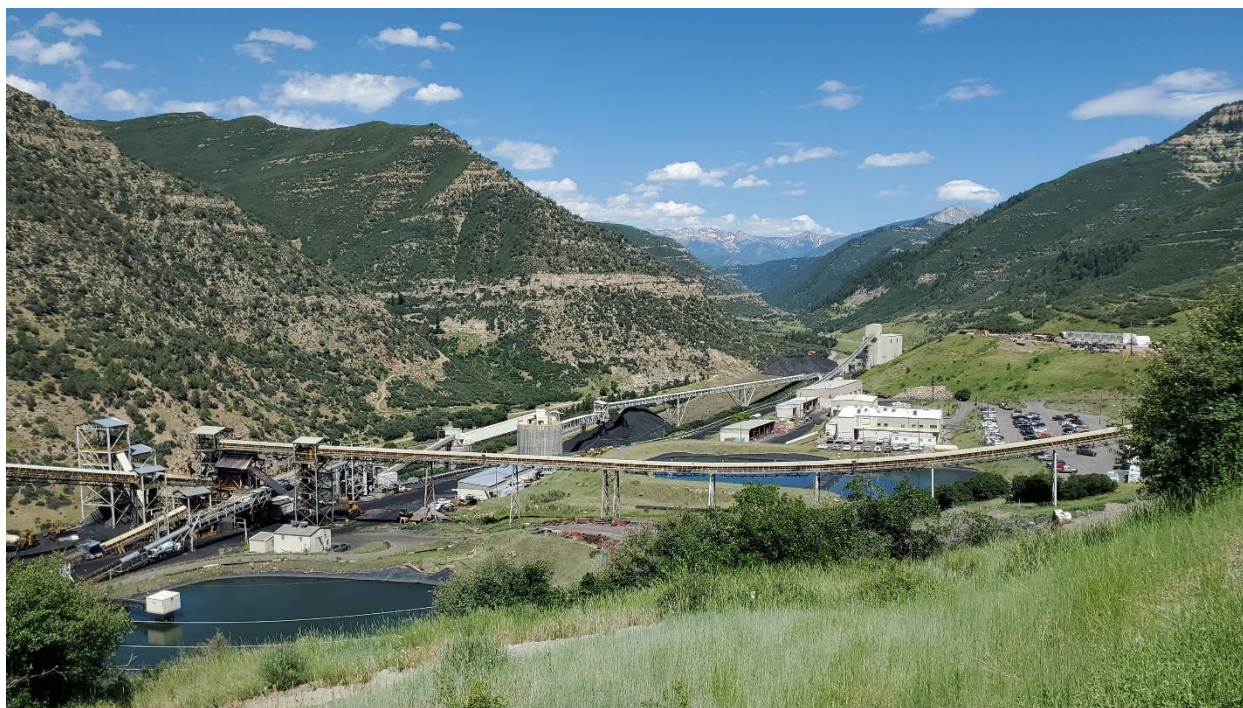
Figure 3: Overview of lower facilities

Number of Partial Inspection this Fiscal Year: 1