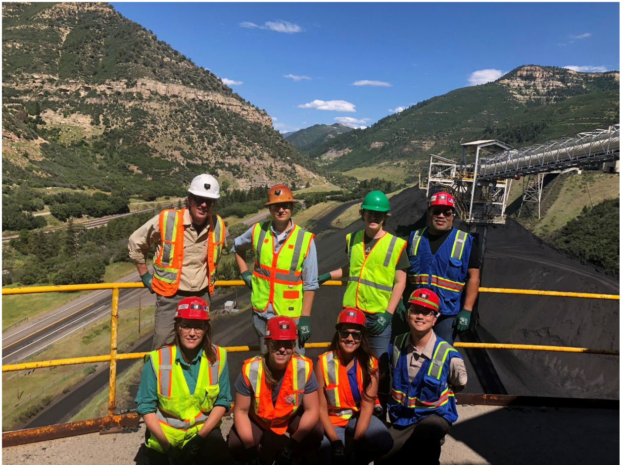
Figure 1: Tour group

No enforcement actions were initiated as a result of this inspection, nor are any pending.