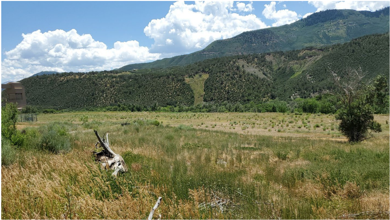
Figure 1: Overview of pad

Number of Partial Inspection this Fiscal Year: 1