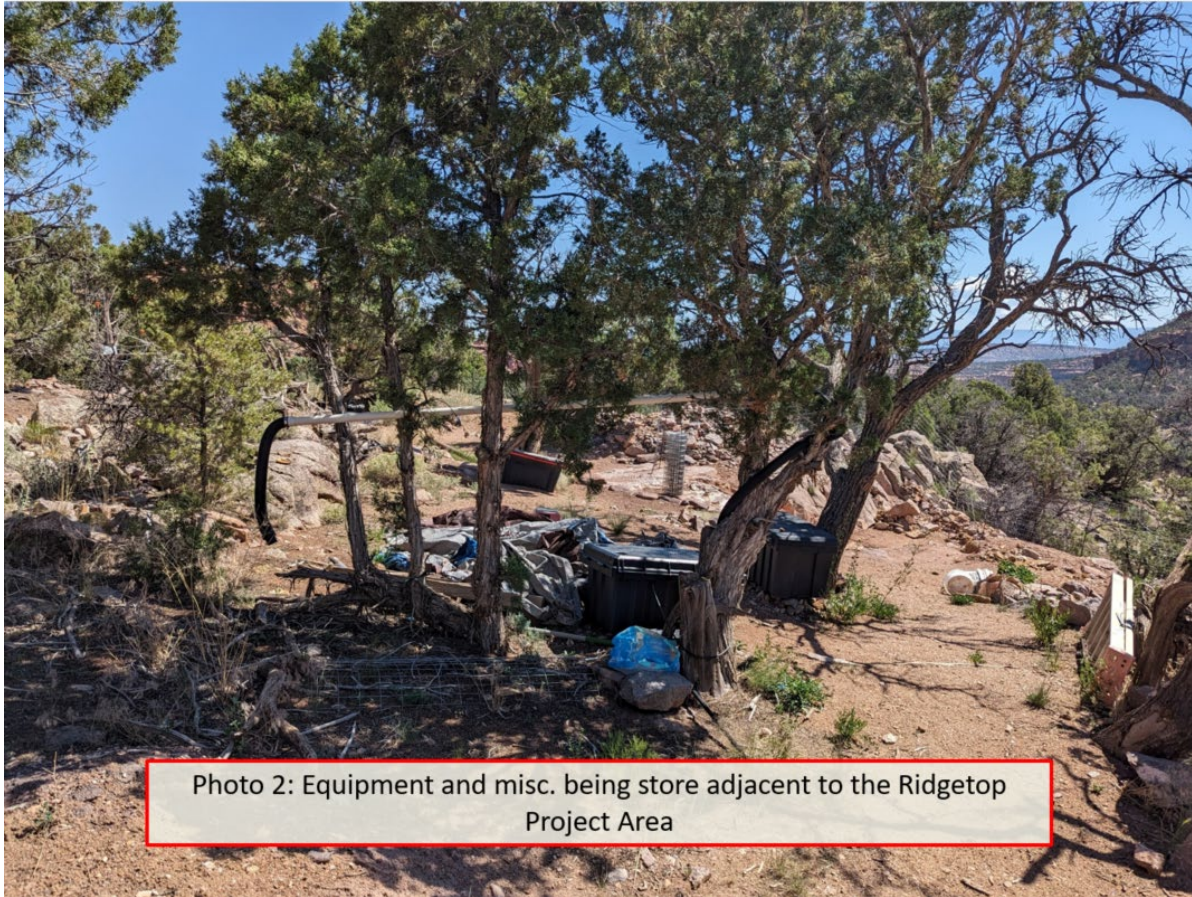
Photo 2: Equipment and misc. being store adjacent to the Ridgetop Project Area