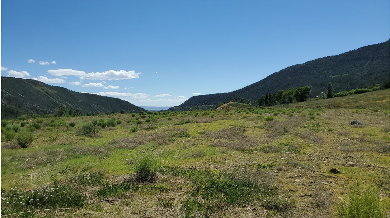
Figure 1: Overview of main pad, looking west

Number of Partial Inspection this Fiscal Year: 8