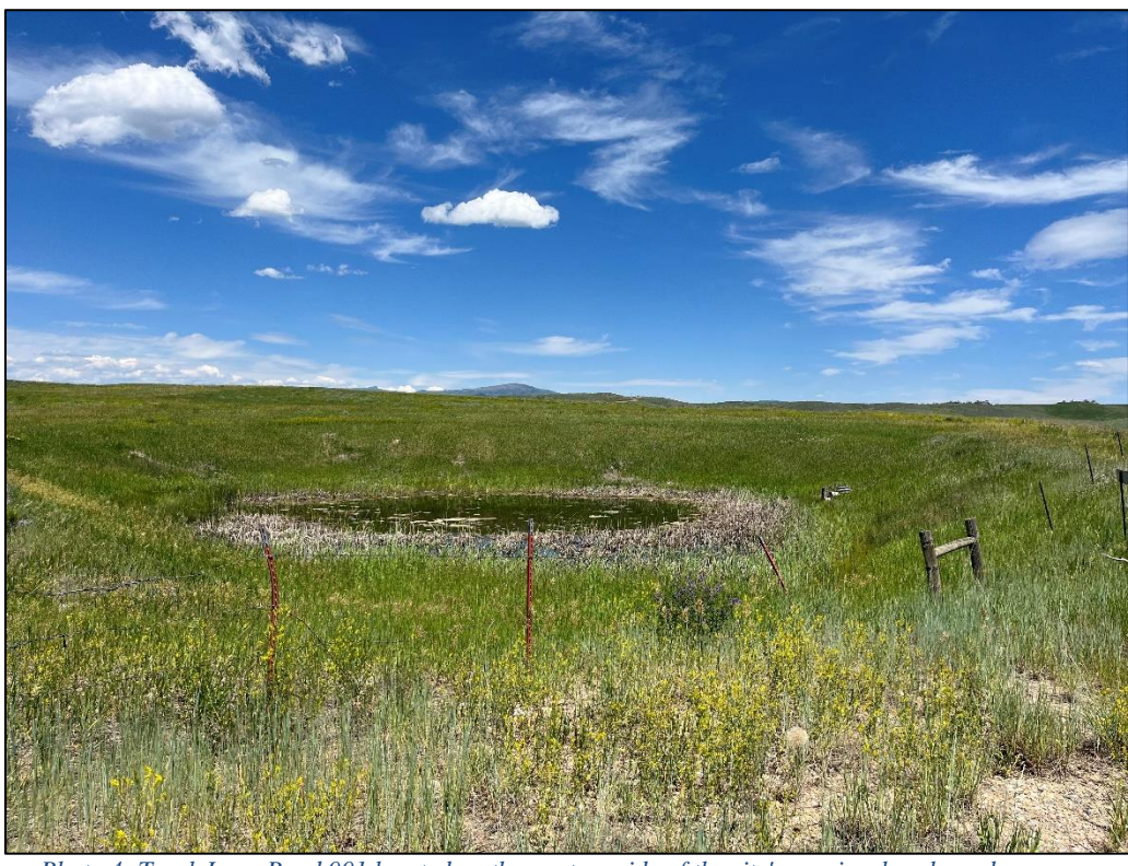
Photo 4: Truck Loop Pond 001 located on the western side of the site's previously released acreage.