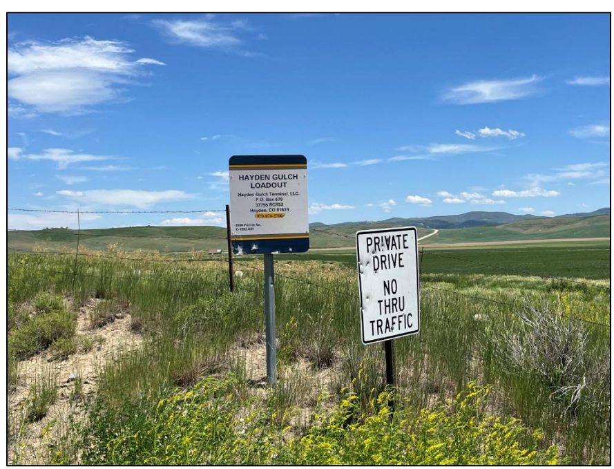
Photo 2: Mine signage posted at the western edge of the site's haul road which intersects with County Road 53.