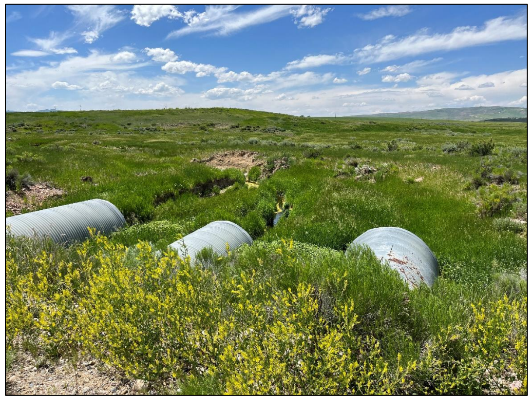
Photo 5: View northwest of culverts which allow Dry Creek to run through the Sage Creek Trail path.

Number of <u>Partial</u> Inspection this Fiscal Year: 8 Number of <u>Complete</u> Inspections this Fiscal Year: 4