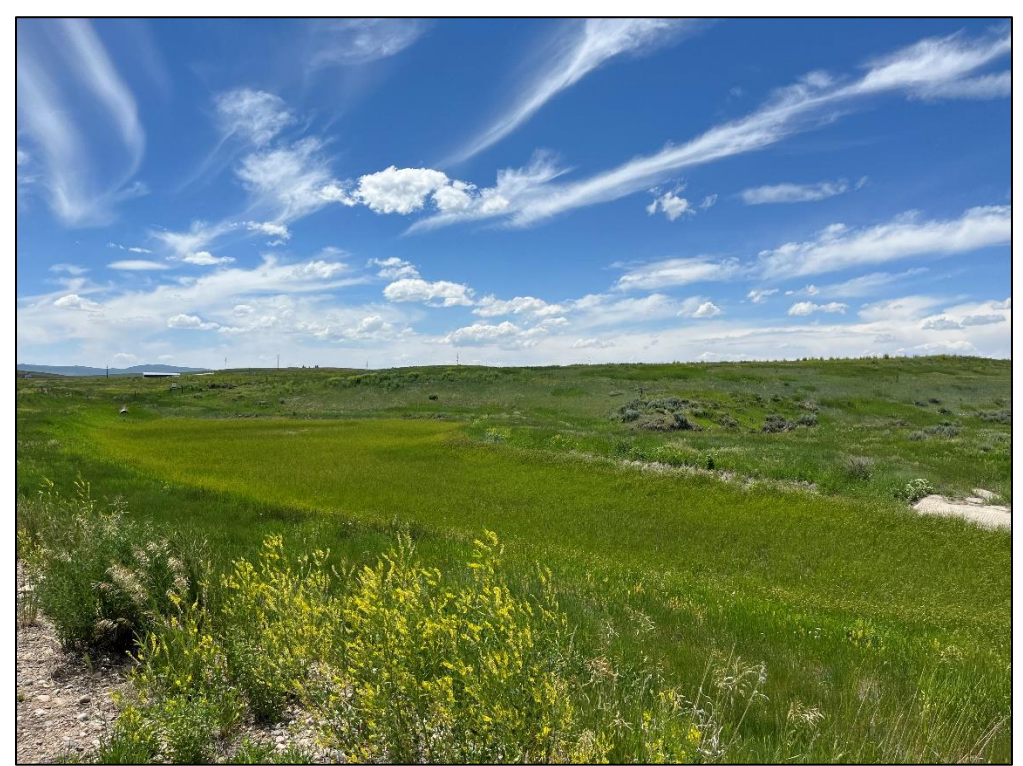
Photo 6: Rail Loop Pond 002 accessed from the Sage Creek Trail located on the site's previously released acreage.

Number of <u>Partial</u> Inspection this Fiscal Year: 8 Number of <u>Complete</u> Inspections this Fiscal Year: 4