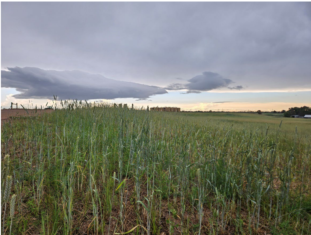
View of typical reclamation vegetation