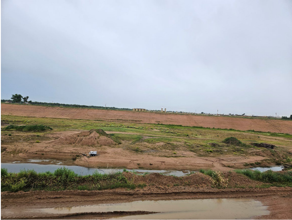
View of the reservoir from the west side looking east