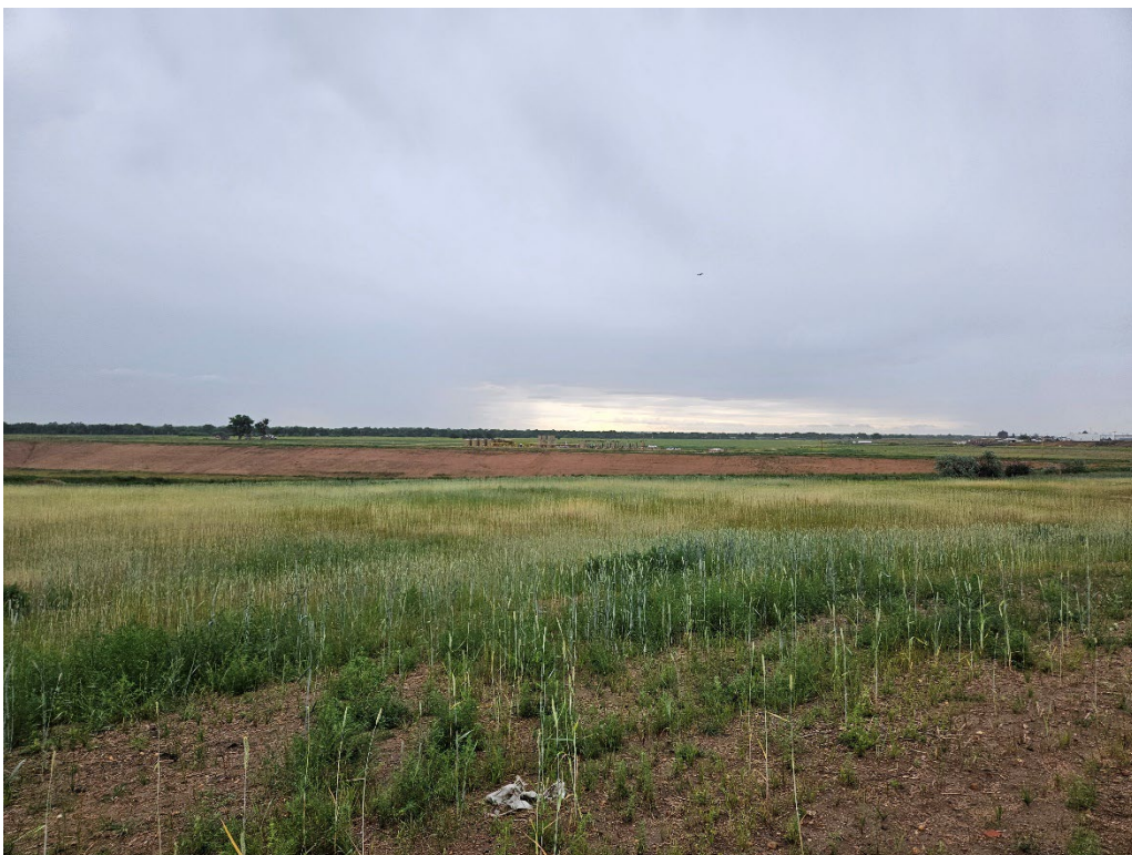
View of the site from the oil and gas facilities looking east