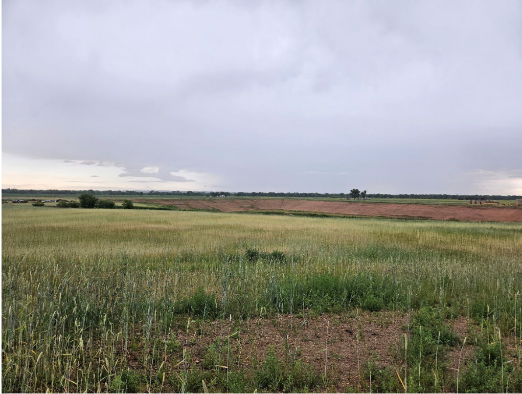
View of the site from the oil and gas facilities looking northeast