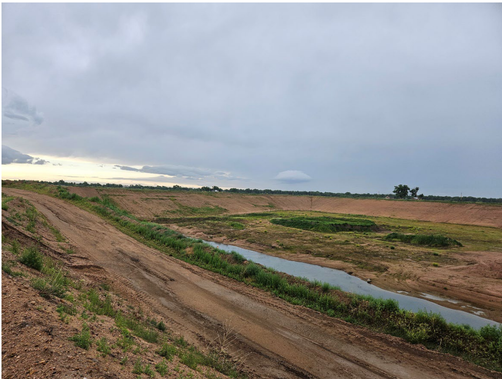
View of the reservoir from the west side looking northeast