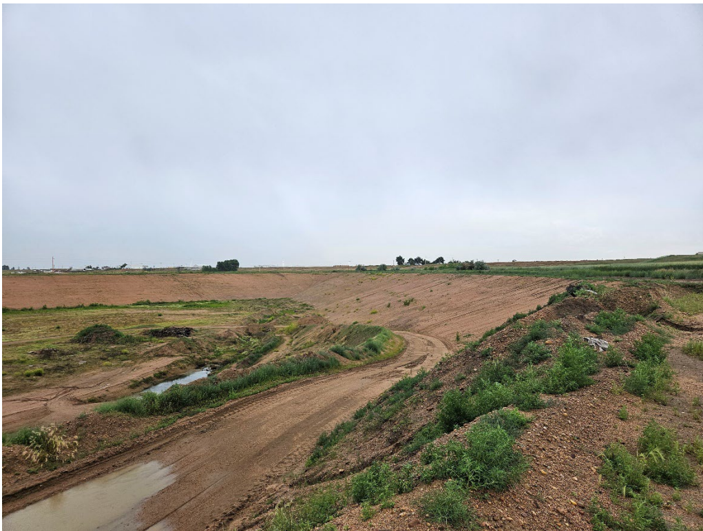
View of the reservoir from the west side looking southeast