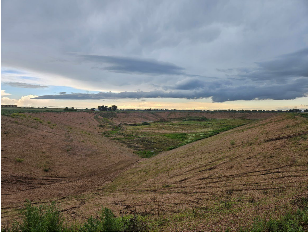
View of the reservoir from the southeast corner looking northwest