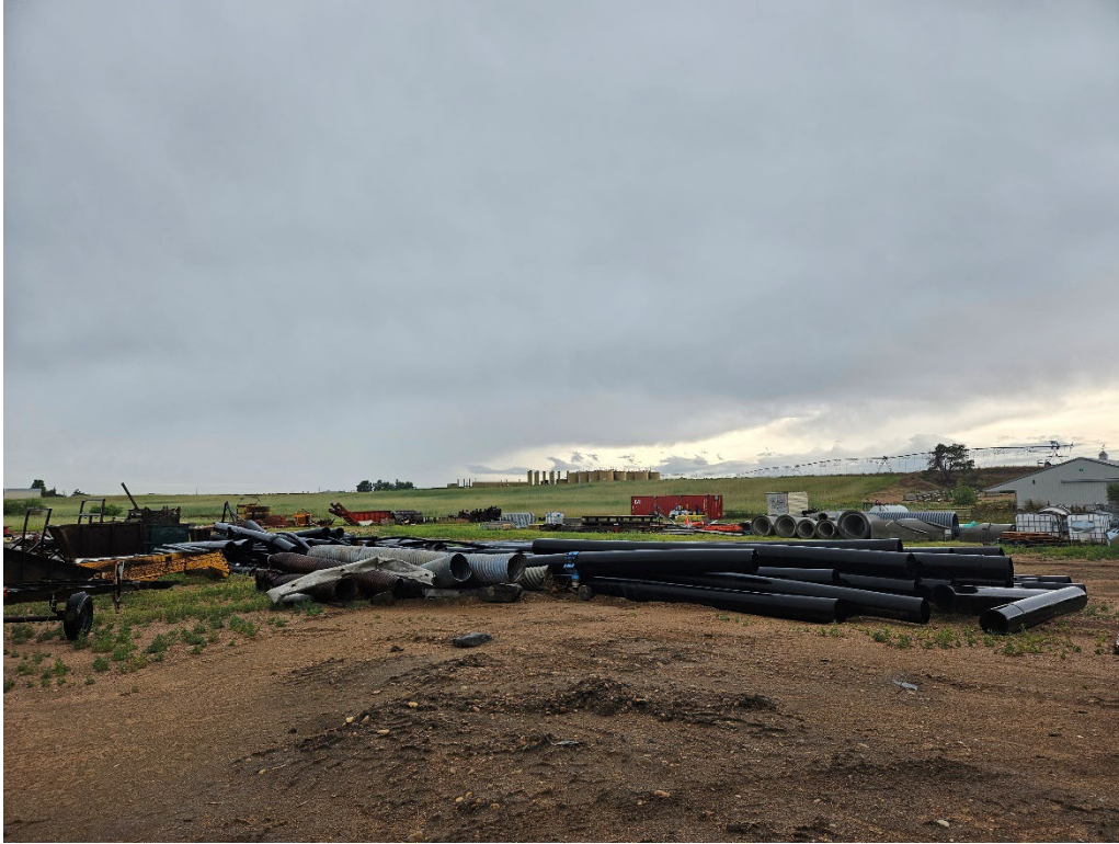
View of the construction yard from the northeast corner looking southwest