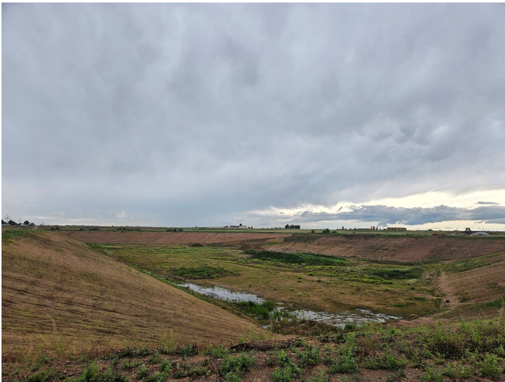
View of the reservoir from the northeast corner looking southwest