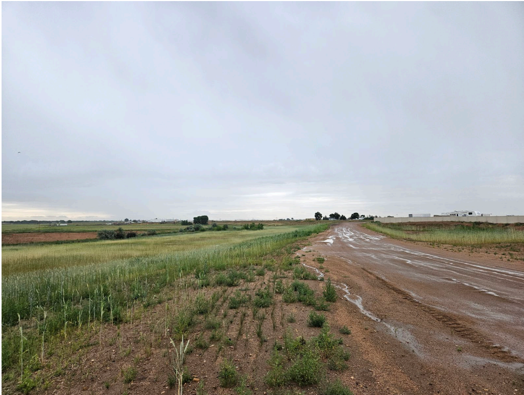
View of the site from the oil and gas facilities looking southeast