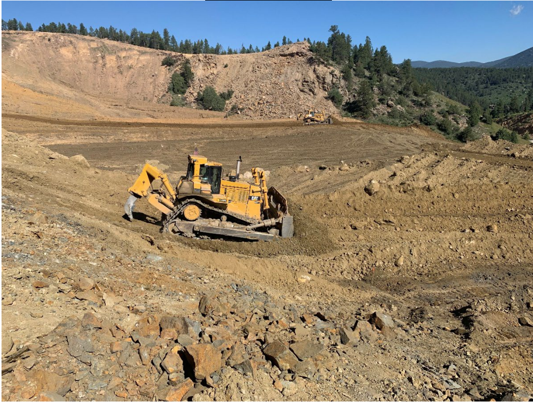
Photo 1 – Dozers pushing material south to north to create facilities pad