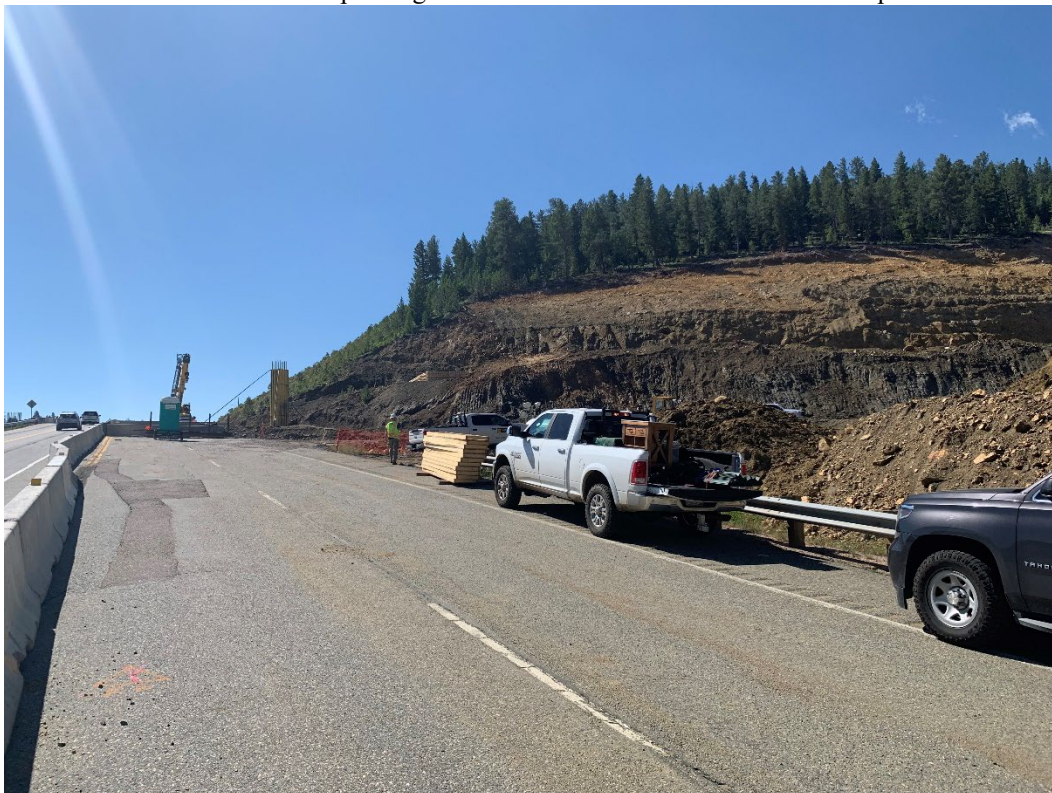
Photo 2 – Southbound lanes of CCP closed for staging and parking during mine development