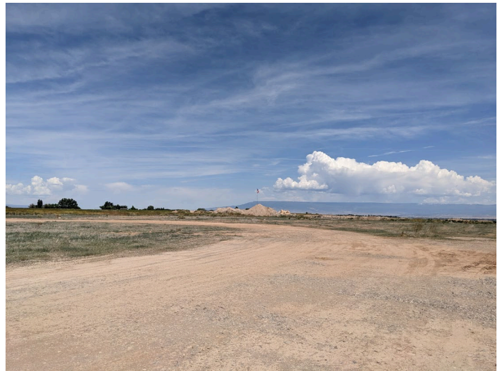
Stockpile area on south side of pit where stockpile has been removed

Zane Luttrell Cornerstone Materials LLC 23625 Uncompahgre Road Montrose, CO 81403