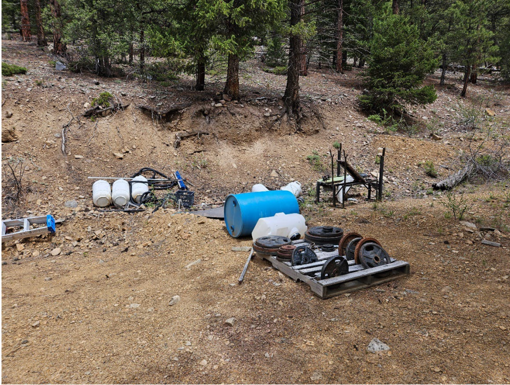
View of the debris located east of the building

Joseph Curtis Harden 6407 Lee Street Arvada, CO 80004