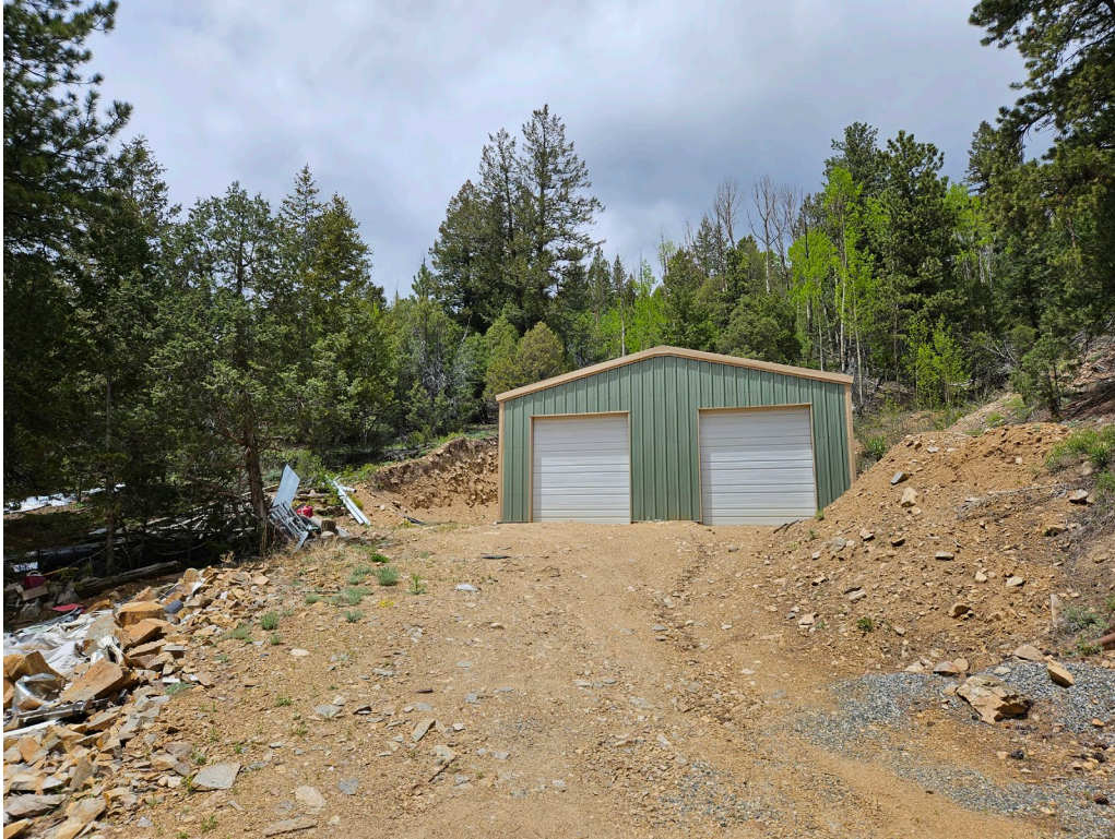
View of the new building from the south looking north