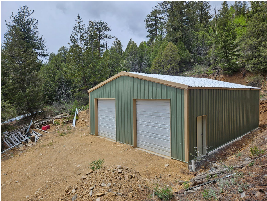
View of the new building from the southeast looking northwest