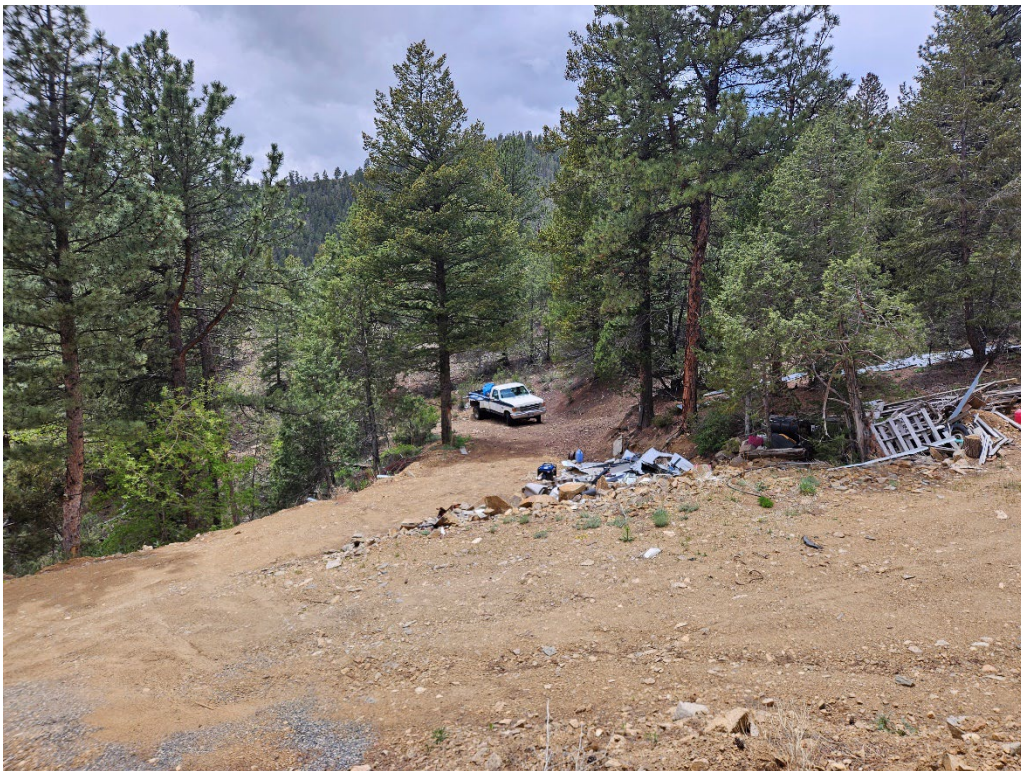
View of the debris located southwest of the building