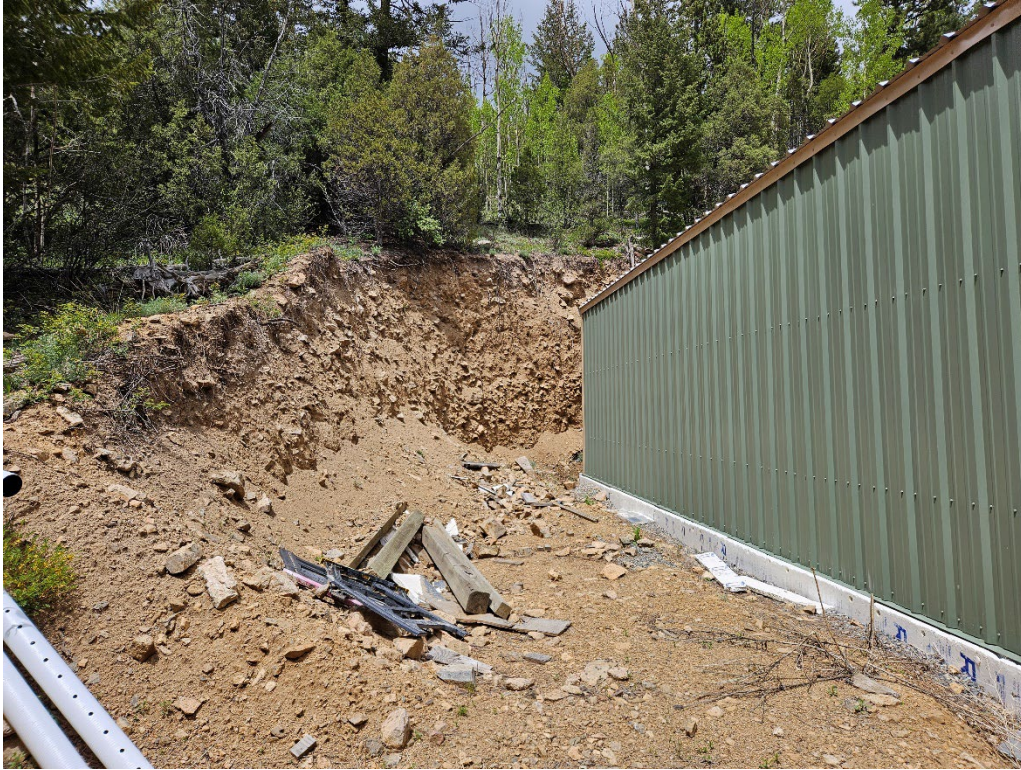
View of the west side of the new building