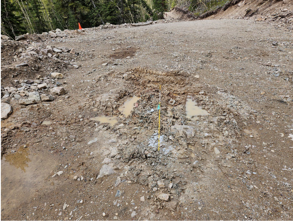
View of the bore hole marker