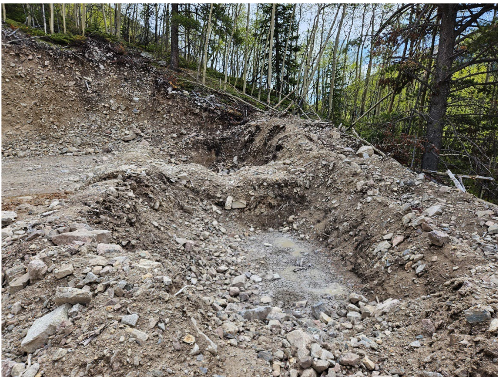
View of the mud pit excavation