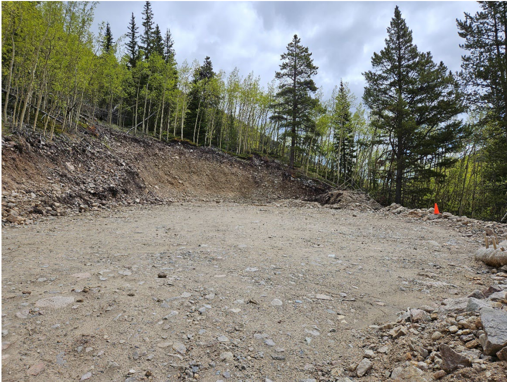
View of the drill pad