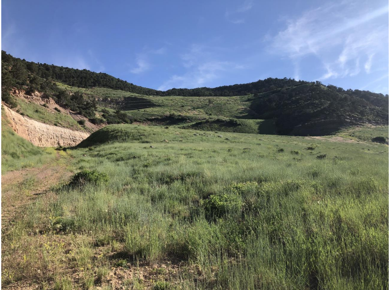
The East Mine

Number of Partial Inspection this Fiscal Year: 8