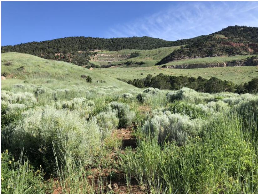
Reclaimed pond below the Refuse Disposal Area

Number of Partial Inspection this Fiscal Year: 8