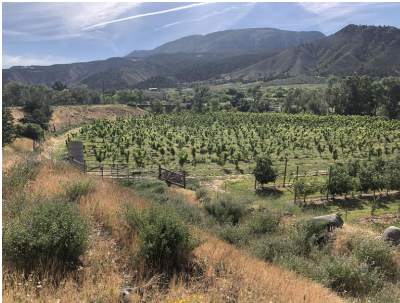
Area below the loadout, with bridge in background

Number of Partial Inspection this Fiscal Year: 8