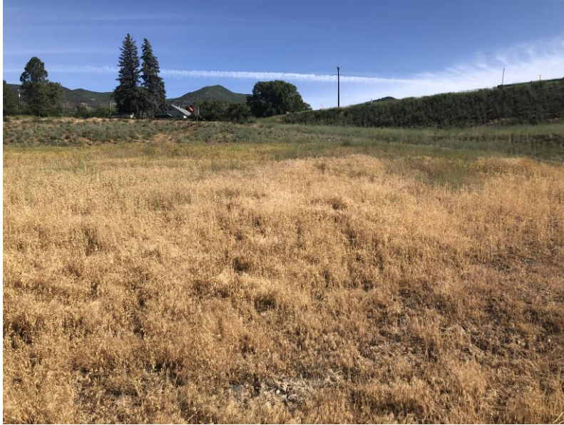
Cheat grass at the Coal Storage Area by the highway