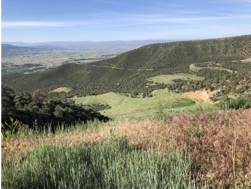
Lower portion of East Mine