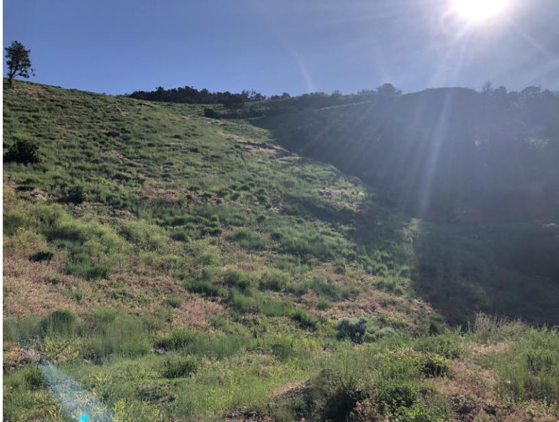
Recent slide at the East Mine