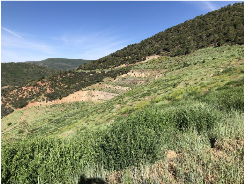
Steep slope at upper portion of the East Mine

Number of Partial Inspection this Fiscal Year: 8