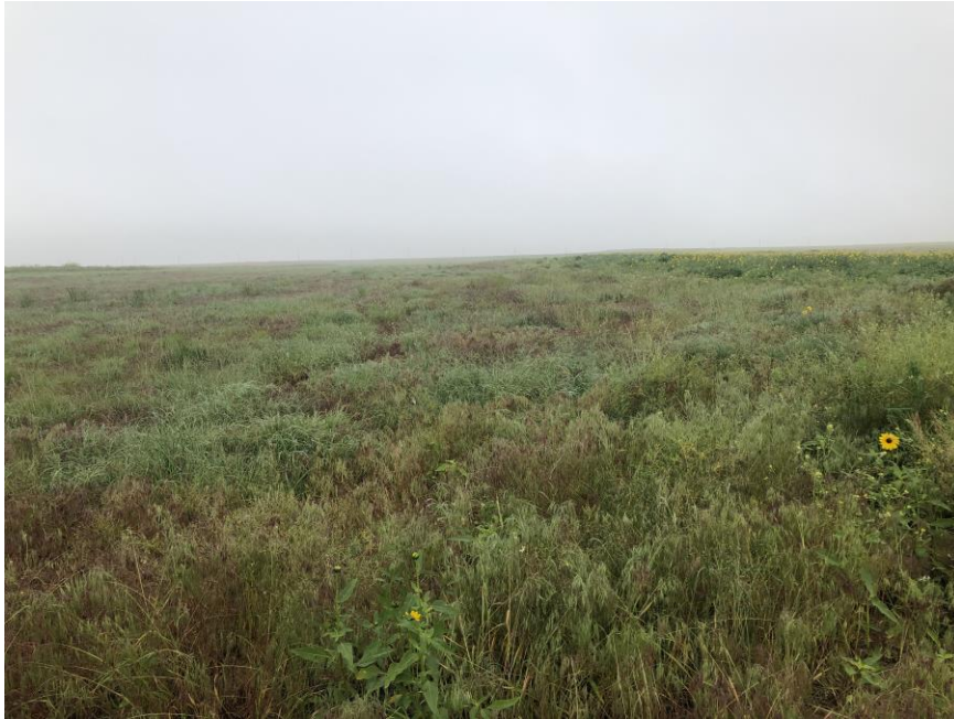
Grass cover in Area 33