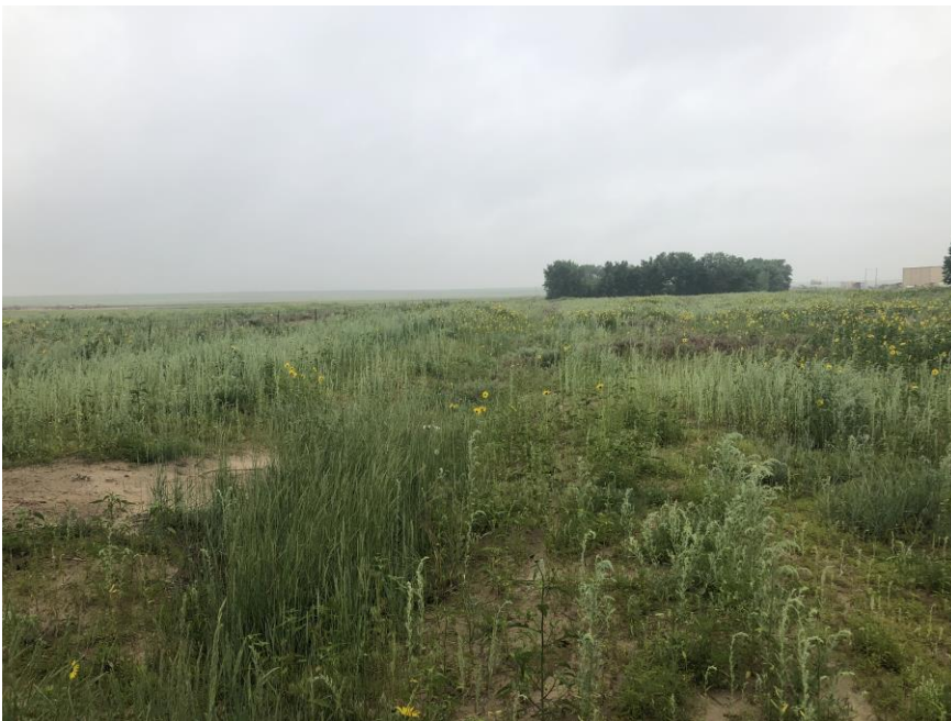
Northern boundary, facing east

Number of Partial Inspection this Fiscal Year: 8