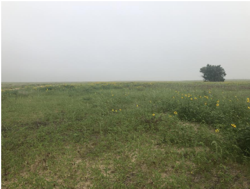
Sunflowers dominating Area 36, eastern portion

Number of Partial Inspection this Fiscal Year: 8