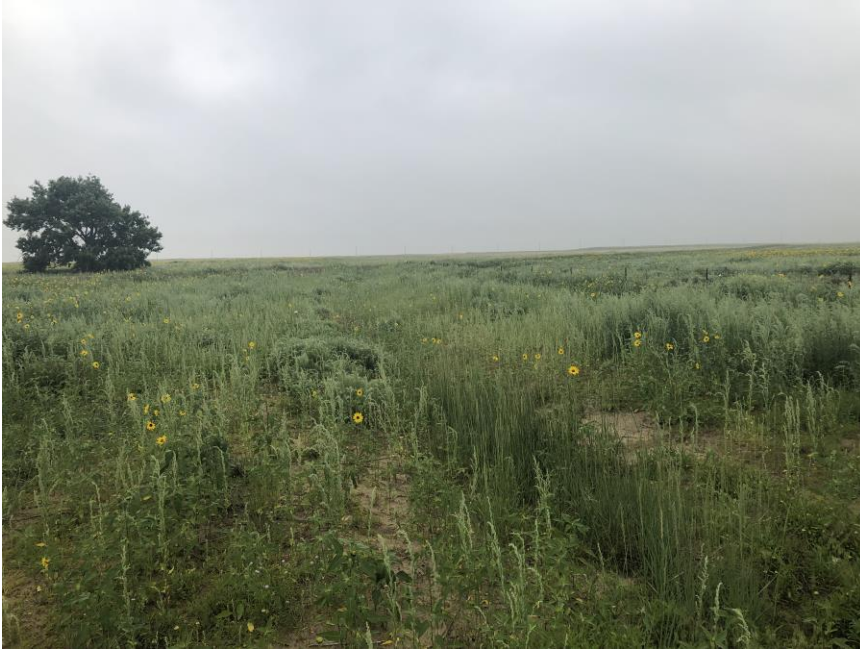
Northern boundary, facing west