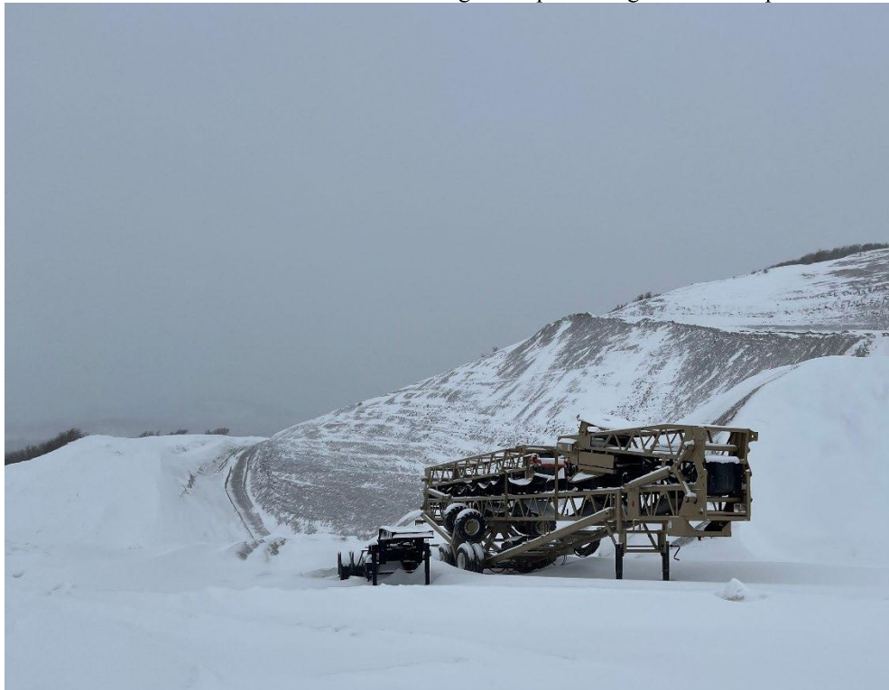
Photo 6: View north of the excavated hillside and haul road from the upper processing portion of the pit.