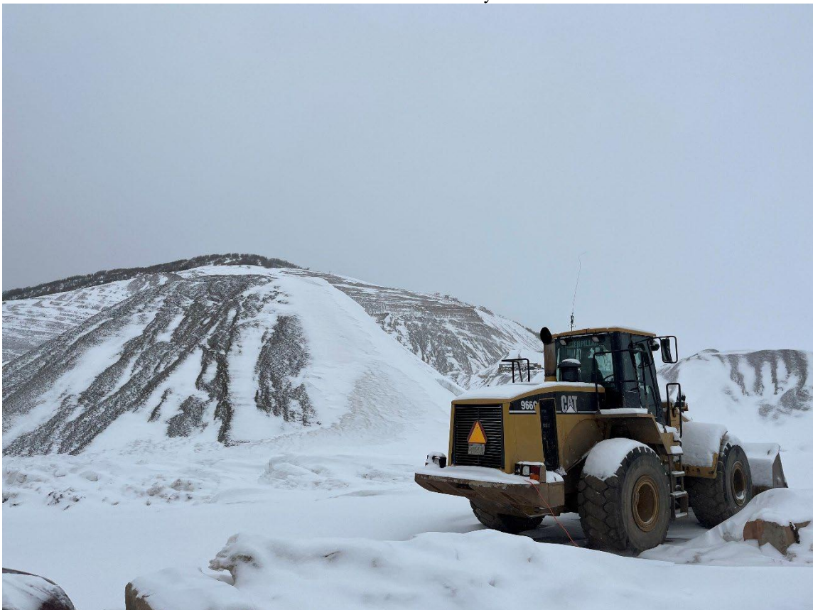
Photo 4: View North of the operation. The excavated hillside is visible from behind the foreground stockpile.