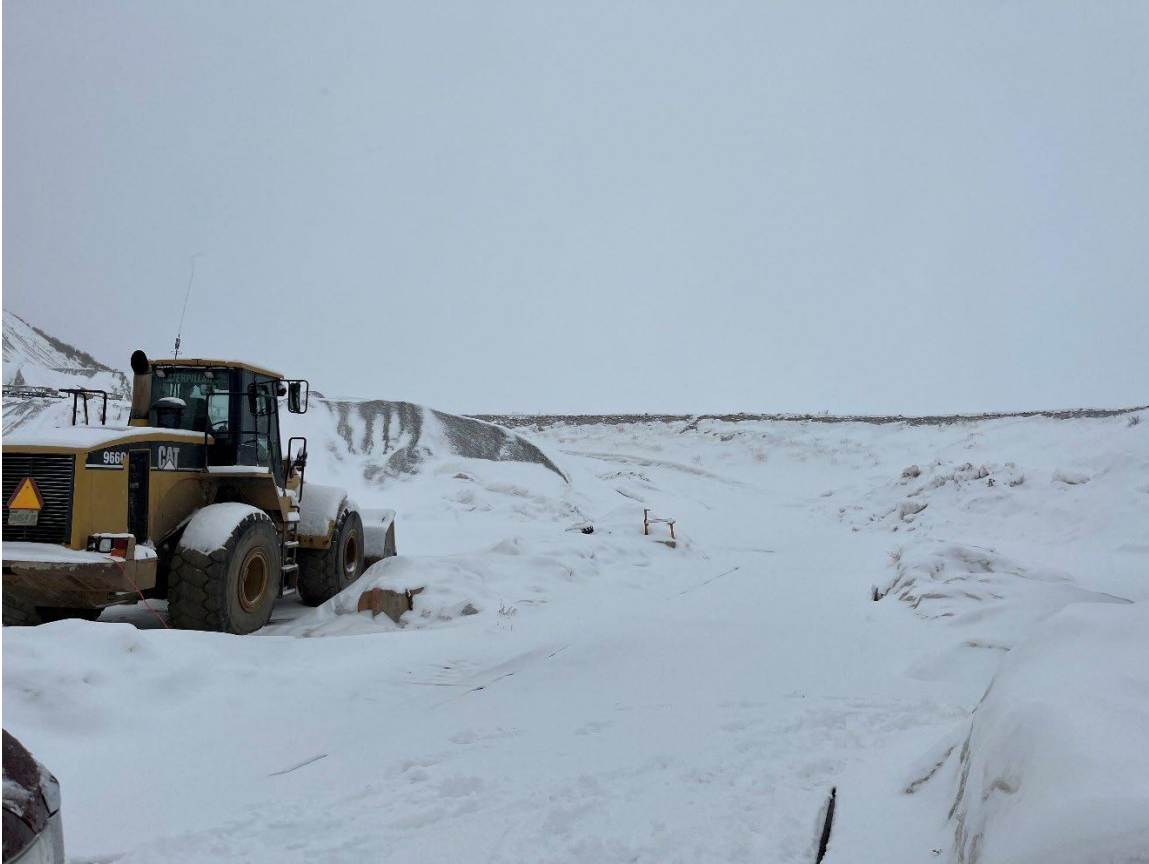
Photo 5: View northeast of the road leading to the processing area of the operation.