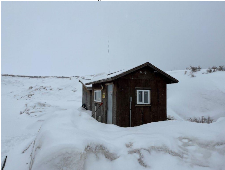
Photo 2: Scale and scale house located on the entry road to the site.