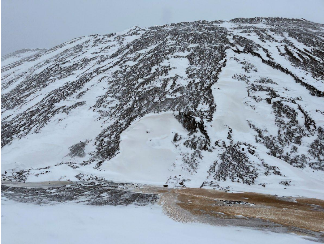
Photo 7: View north of the excavated hillside from the upper processing portion of the pit.

Dan Redmond General Operating Company P.O. Box 223 Yampa, CO 80483