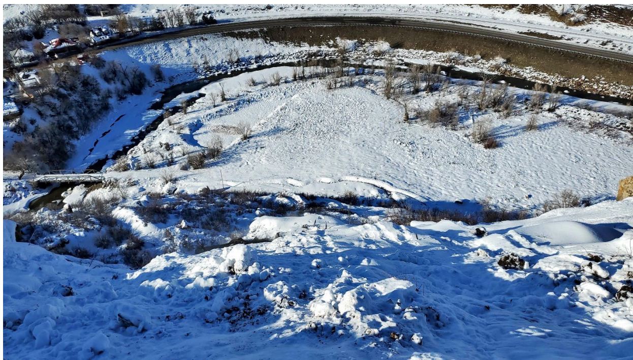
Figure 3: Overview of site from bench above slide area

Number of Partial Inspection this Fiscal Year: 3