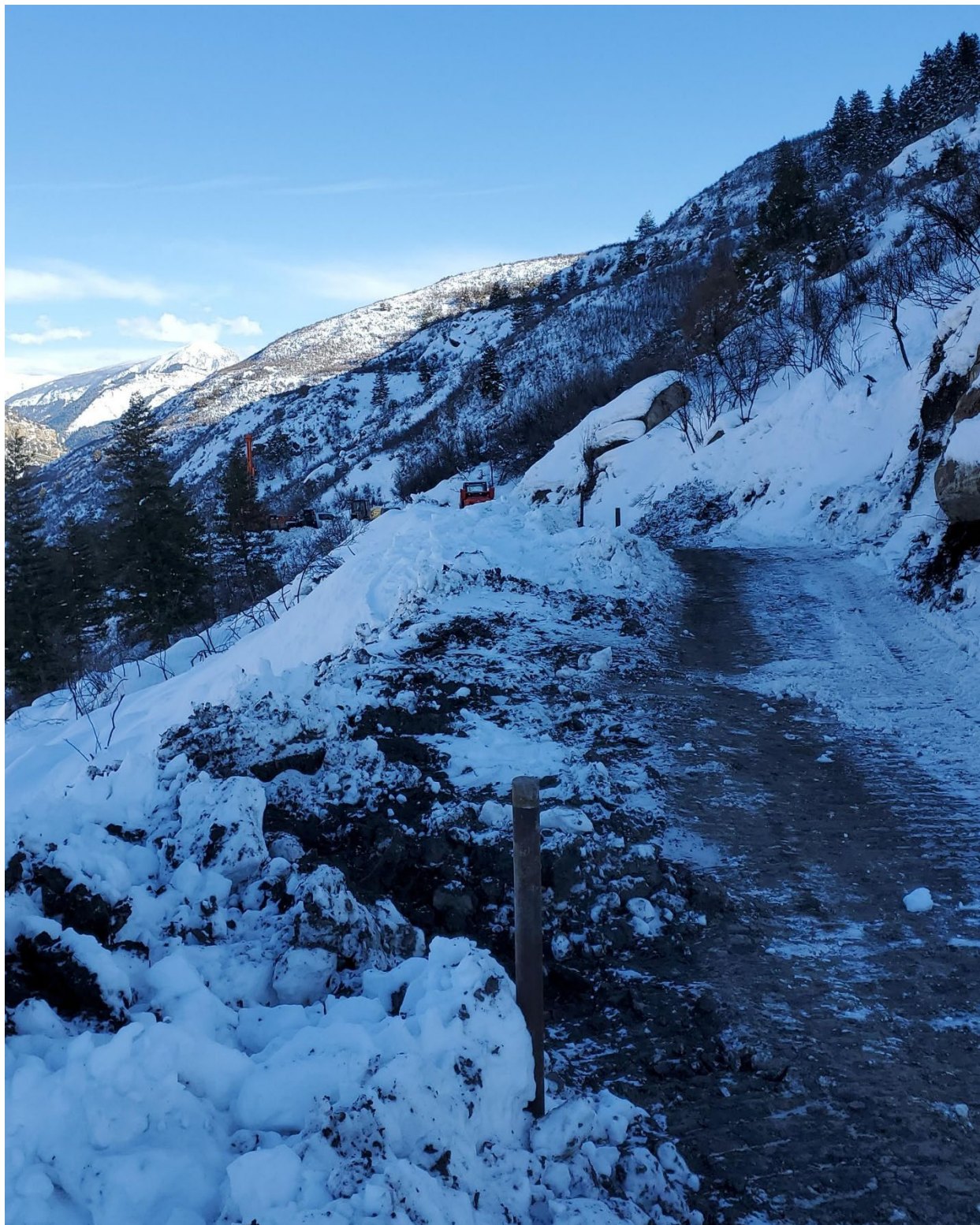
Figure 6: View along bench from west to east

Number of Partial Inspection this Fiscal Year: 3