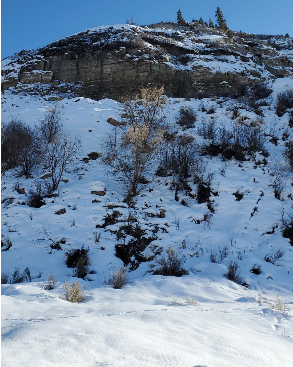
Figure 1: Slide area from below

Number of Partial Inspection this Fiscal Year: 3