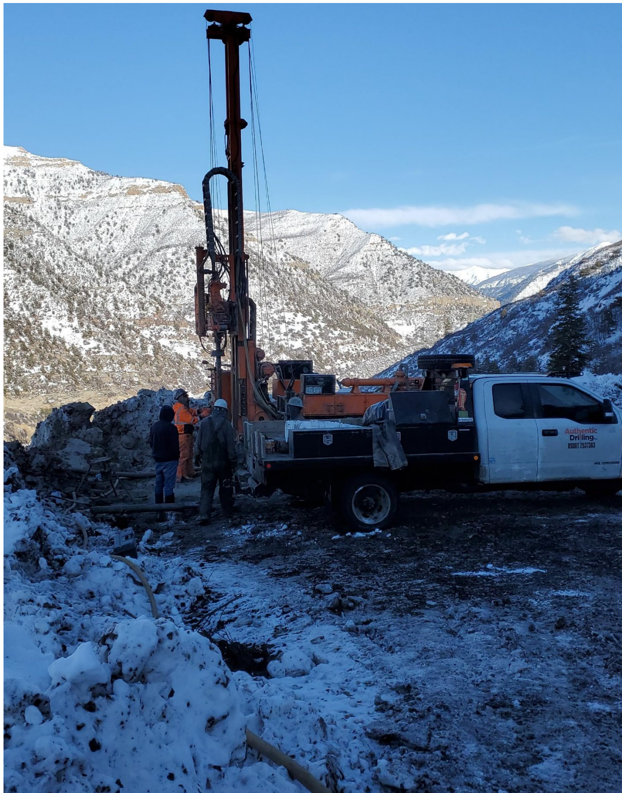
Figure 4: Authentic Drilling drill rig installing inclinometer

Number of Partial Inspection this Fiscal Year: 3