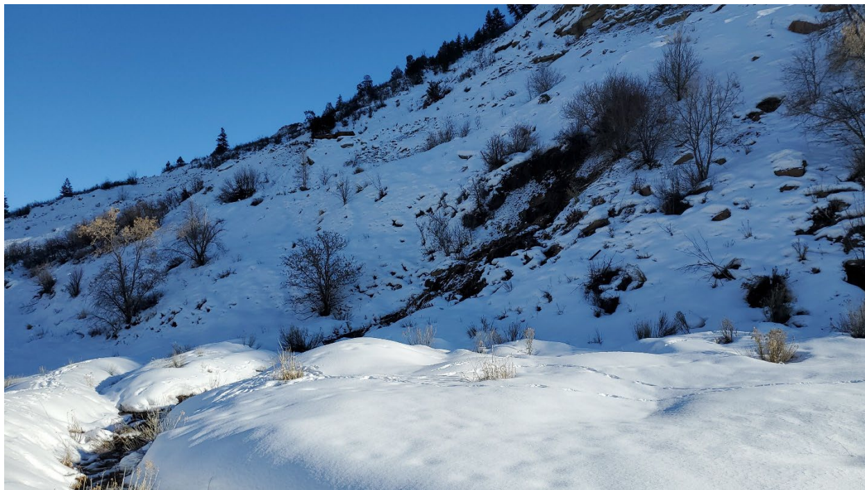
Figure 2: Groundwater seep