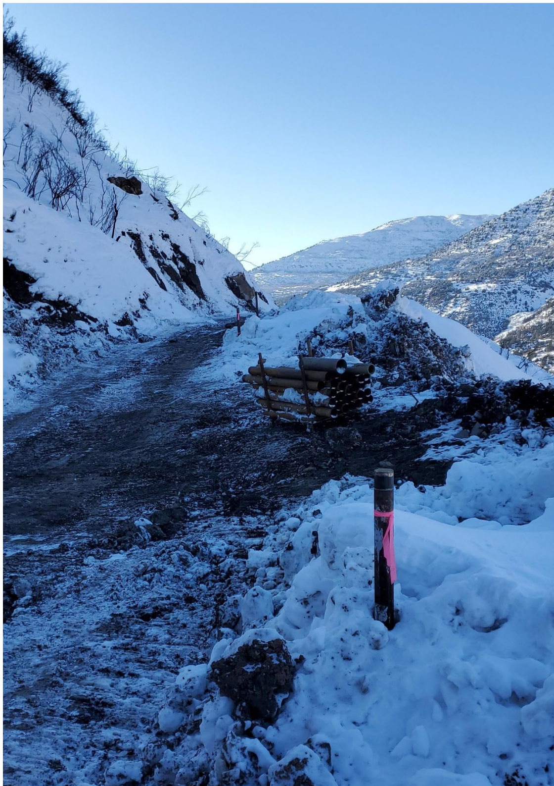
Figure 5: View along bench from east to west

Number of Partial Inspection this Fiscal Year: 3