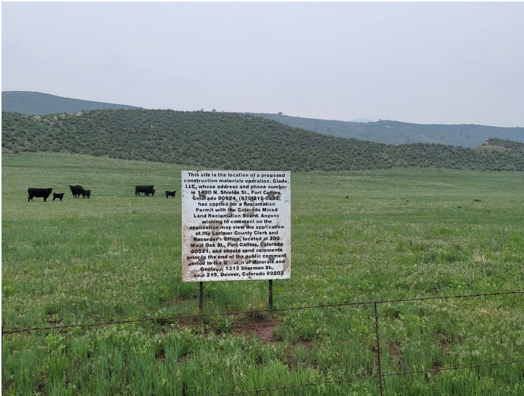
Photo 1: Original permit application sign posted near the entrance.