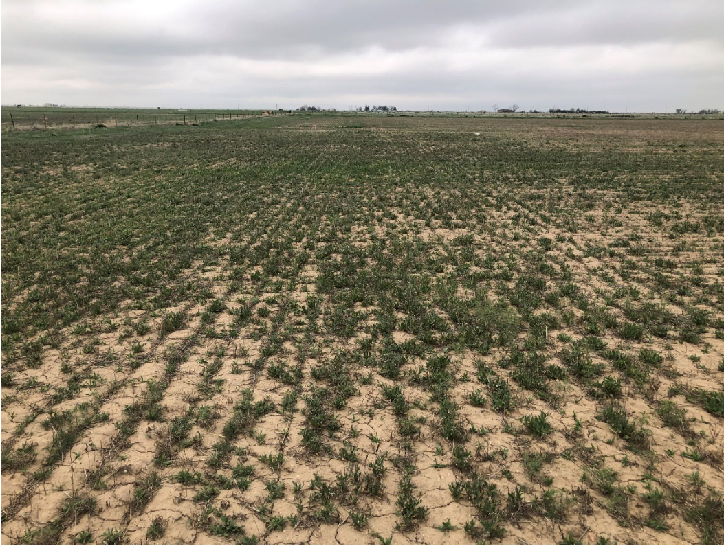
Photo 7. Looking west at the undisturbed portion of the north expansion area.