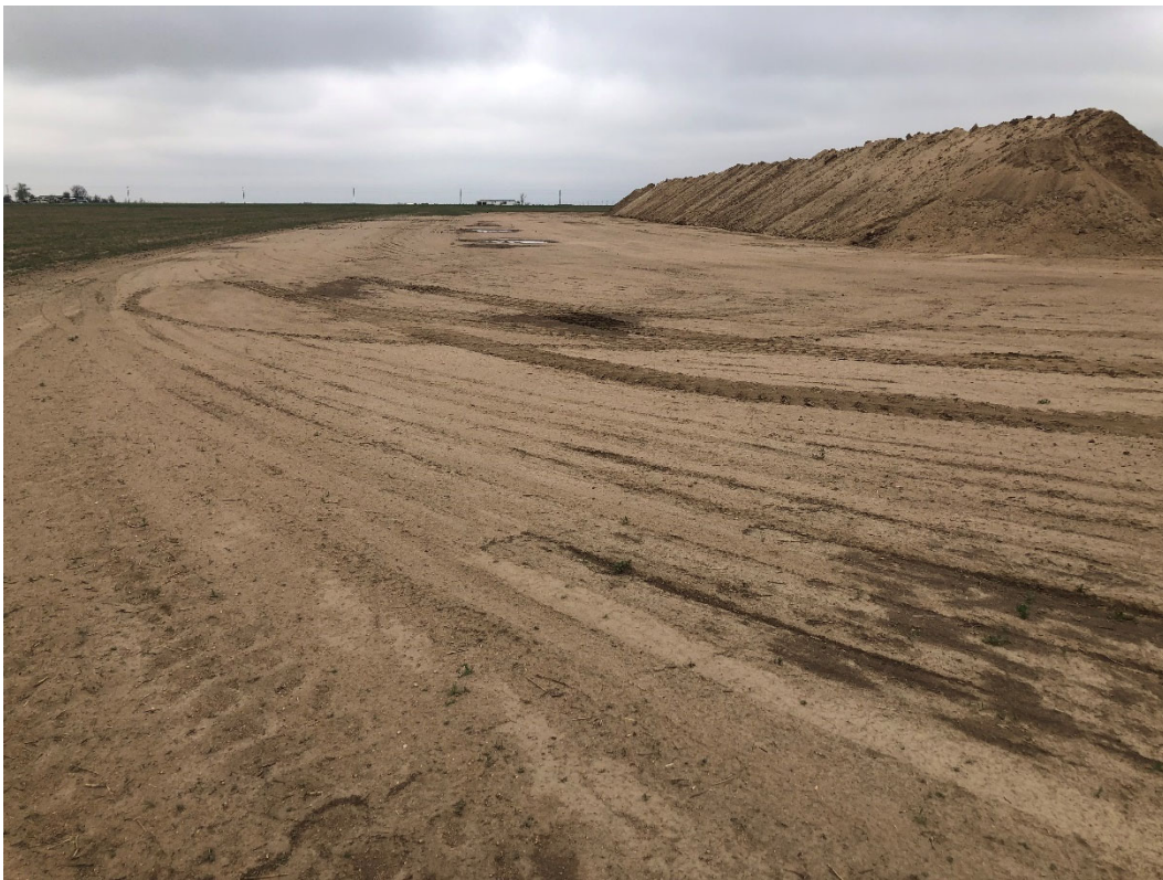
Photo 8. Looking north along the access road behind the active mining face and the undisturbed portion of the north area.