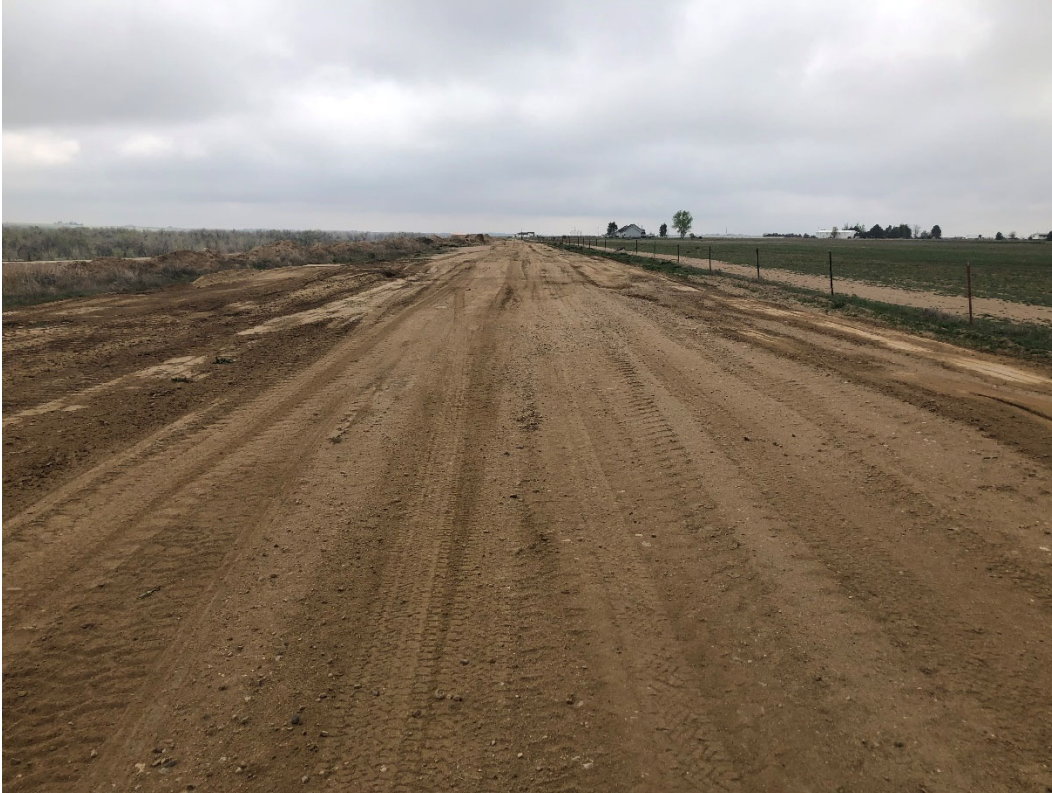
Photo 5. Looking south down the access road that runs along the western boundary. Fencing surrounds the permit area.