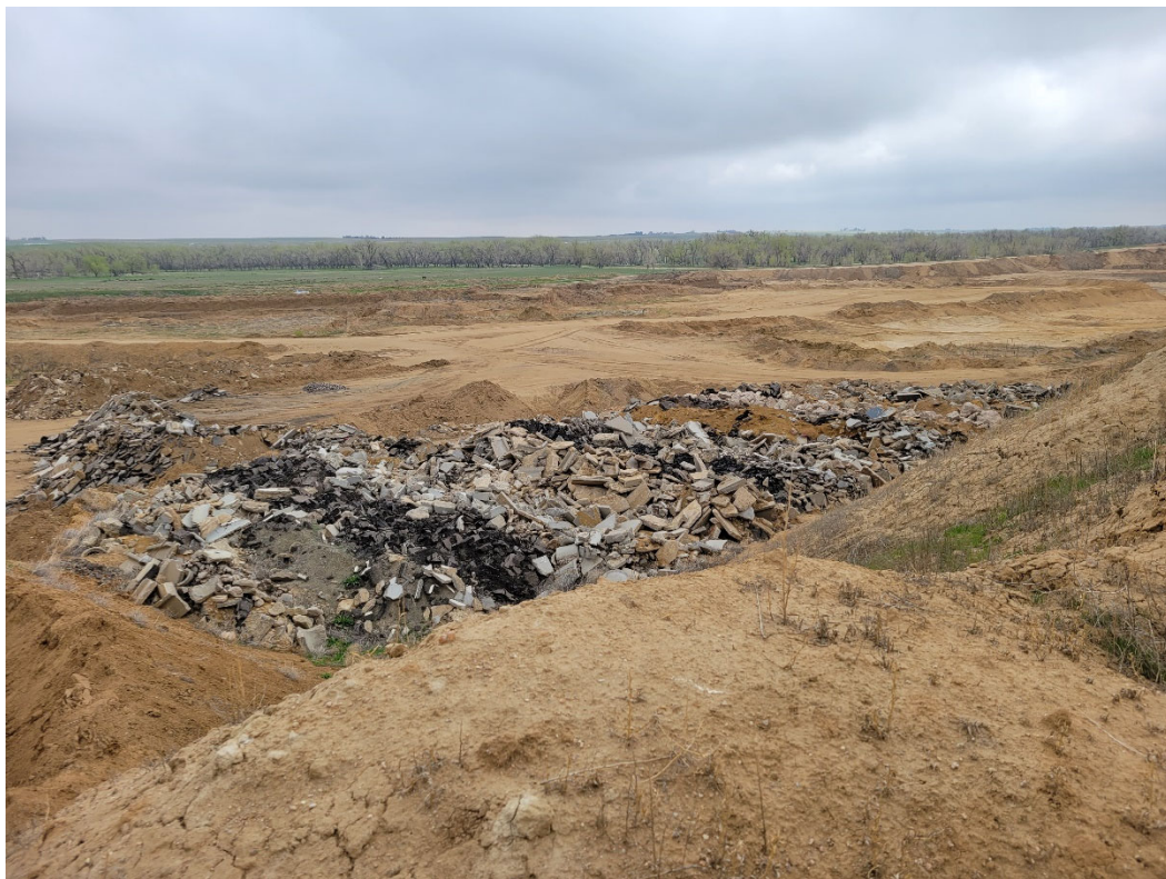
Photo 6. Inert fill placed at the base of the western highwall.