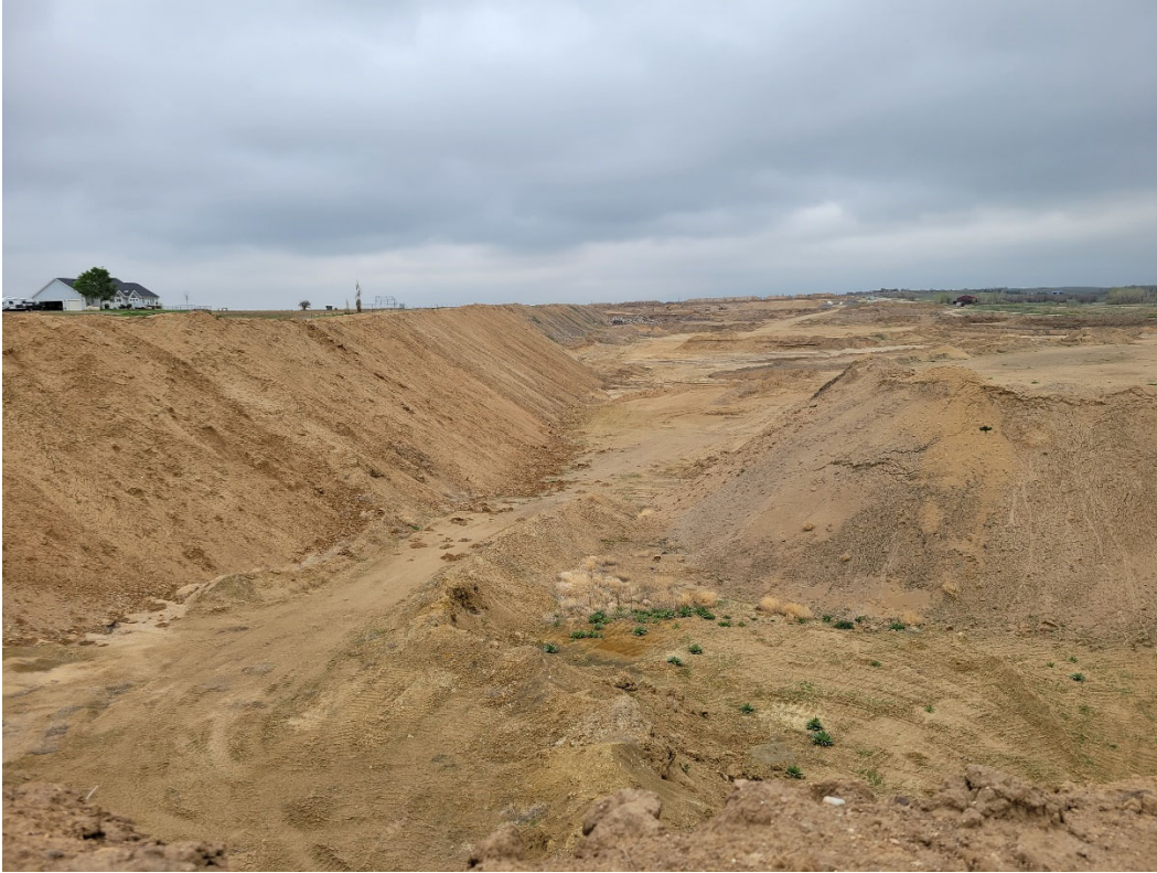
Photo 3. Looking north along the western highwall.