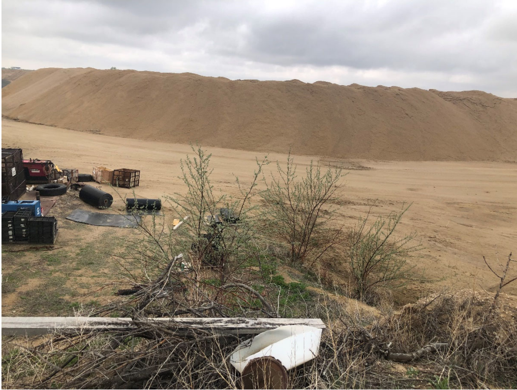
Photo 11. Russian olive trees next to the fuel and equipment storage area near the front entrance.