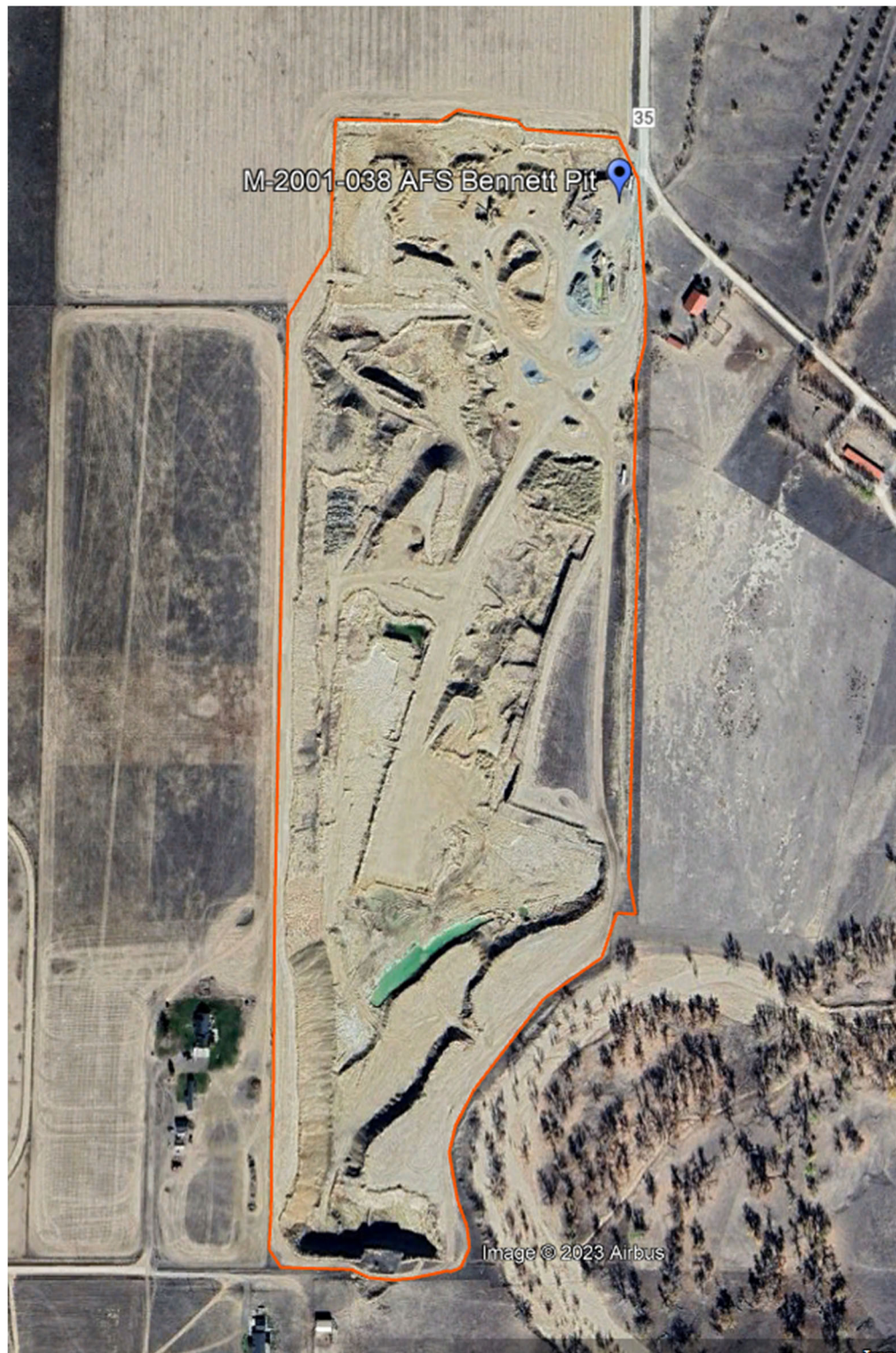
Photo 12. Google earth imagery from 06/2023 showing approximate 60-acre disturbance area.