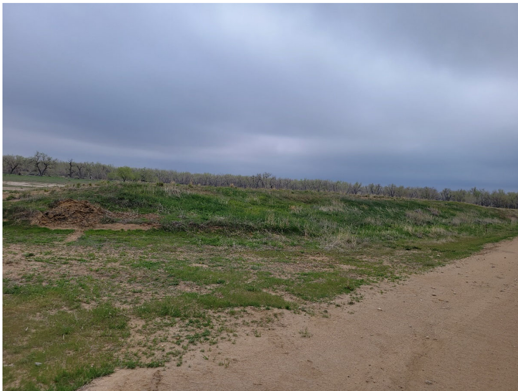
Photo 10. Vegetated topsoil pile on the east side of the pit, along the access road.