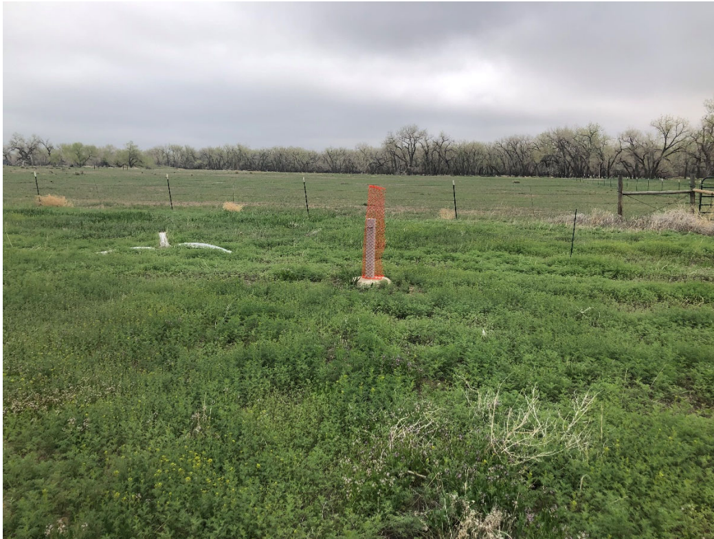
Photo 9. Looking southeast at monitoring well located on the east side of the mining area.