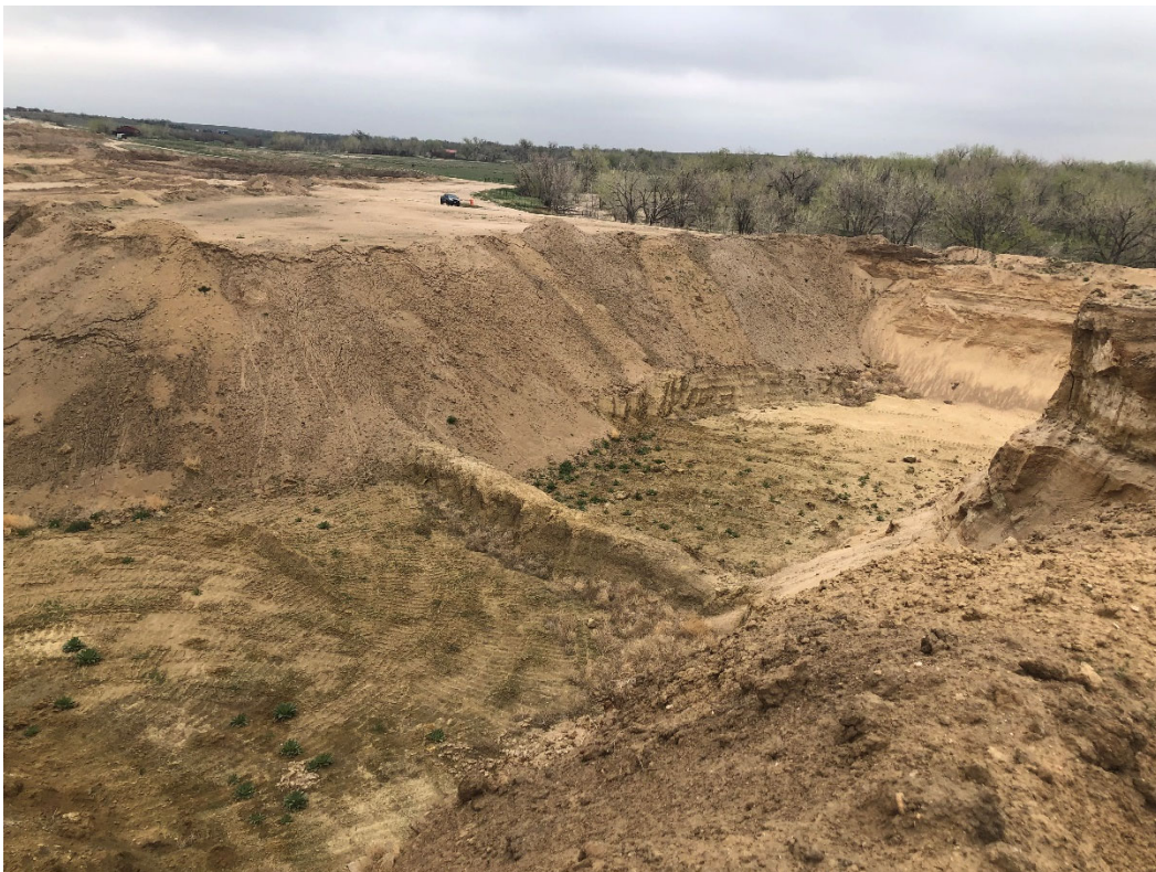
Photo 2. Looking east across the pit at the south end of the permit area.