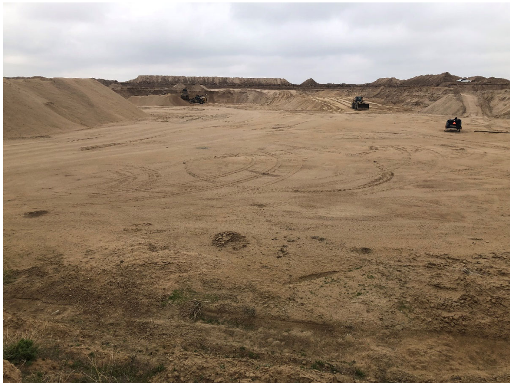
Photo 4. Looking west from the front entrance into the active north mining area.