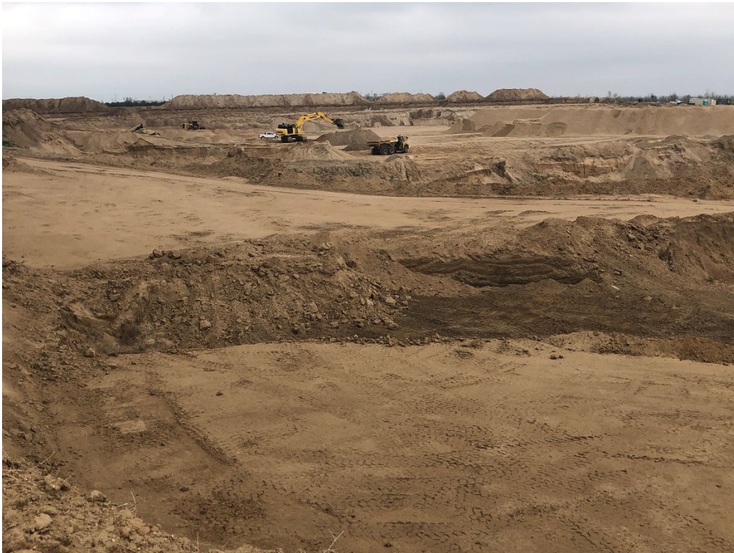
Photo 1. Looking northeast across the active mining area.