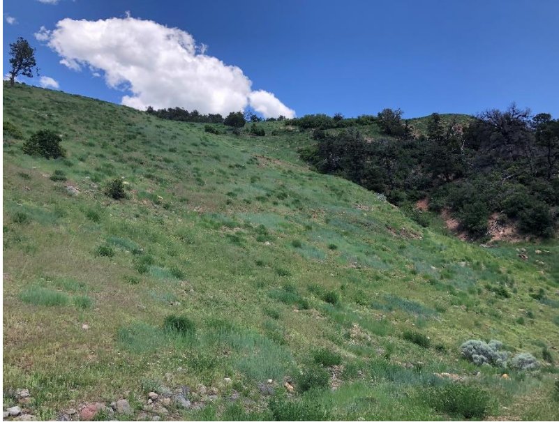
East mine, recent slide area