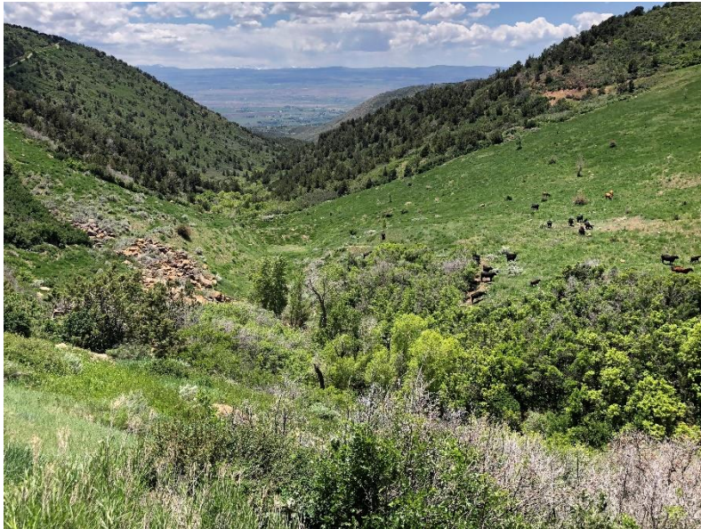
West Mine ponds

Number of Partial Inspection this Fiscal Year: 6