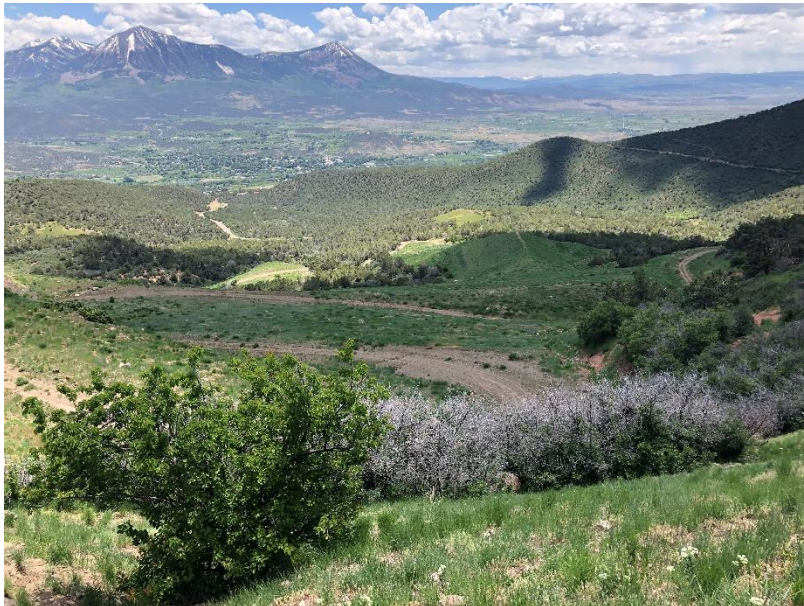
East Mine, lower portion

Number of Partial Inspection this Fiscal Year: 6