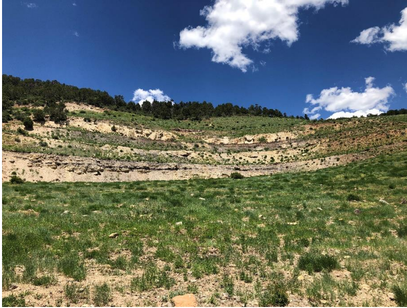
East Mine, steep slope above reclaimed portal bench