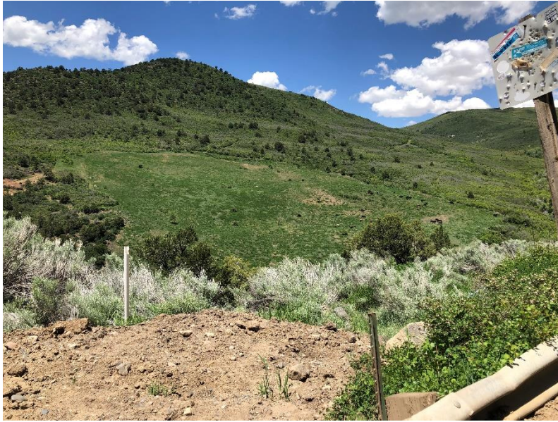
West Mine, from Johnson Road