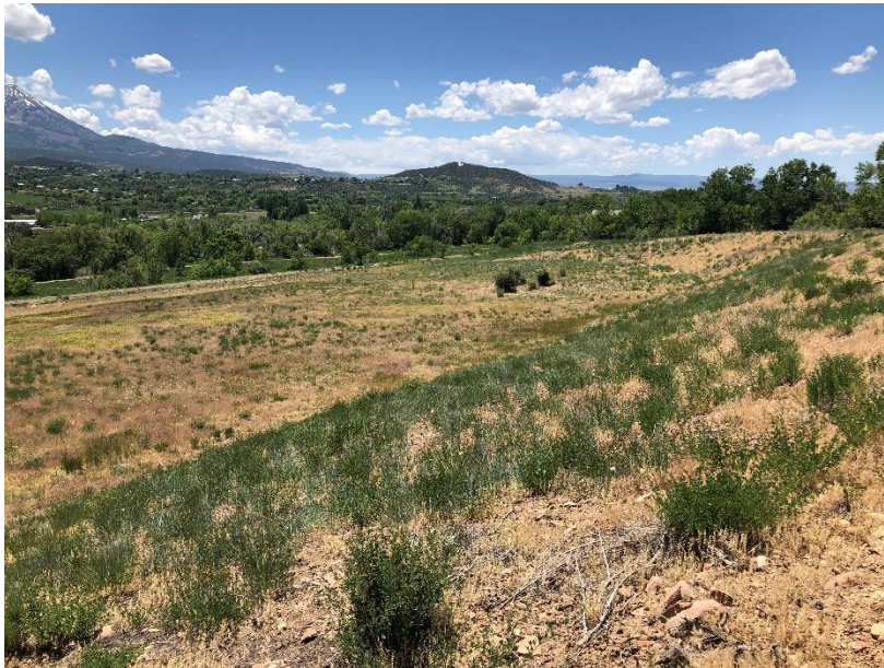
Former Coal Storage Area by Highway 133 and Black Bridge Road

Number of Partial Inspection this Fiscal Year: 6