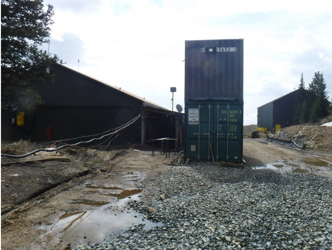
Photo 9: Looking south from Cross Mine Portal and where the railroad tracks and snow shed used to be