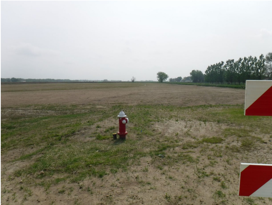
Photo 3: Infrastructure constructed to support residential and commercial development