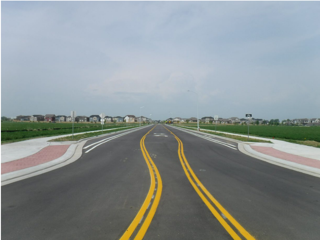
Photo 4: Infrastructure constructed to support residential and commercial development, looking west