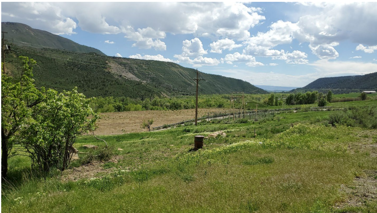
Figure 2: Overview of site, looking to the south west

Number of Partial Inspection this Fiscal Year: 7