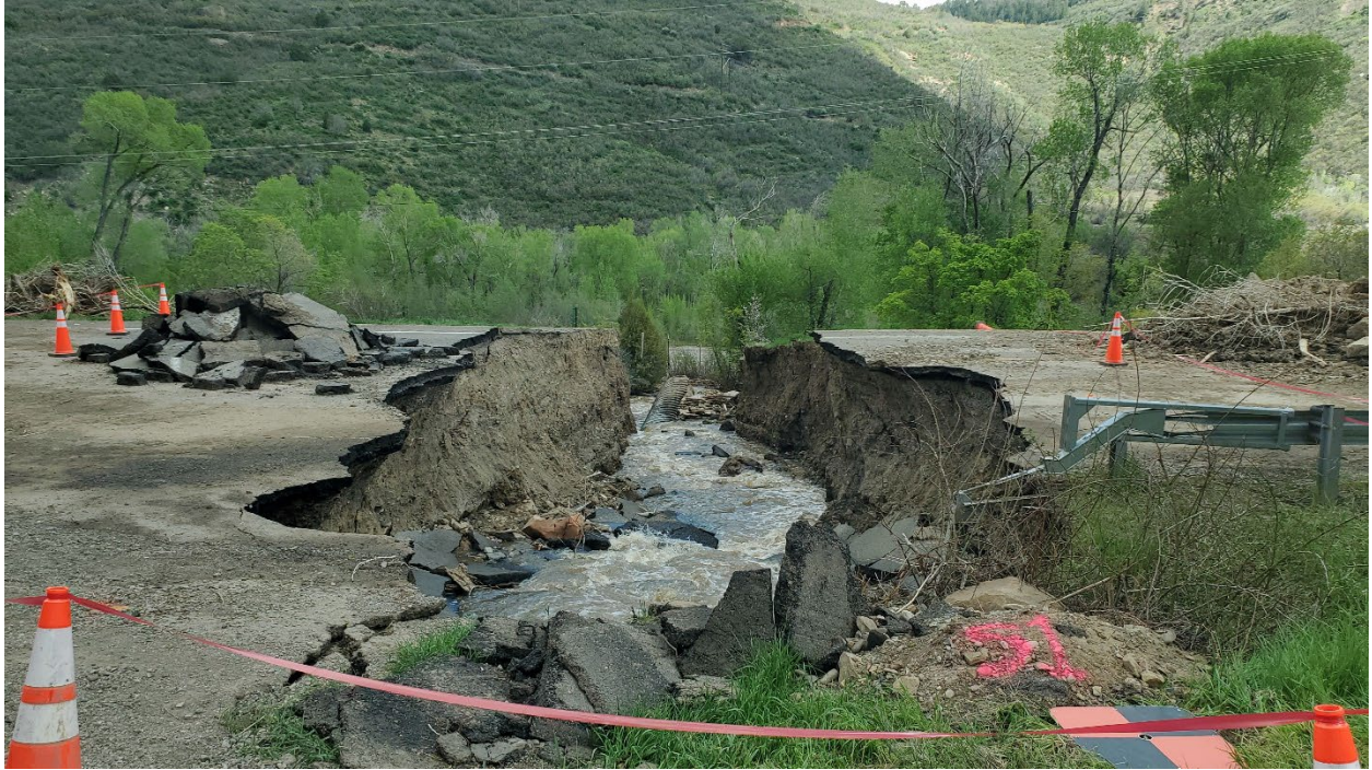
Figure 3: Road damage to Hwy 133 at Bear Creek

Number of Partial Inspection this Fiscal Year: 7