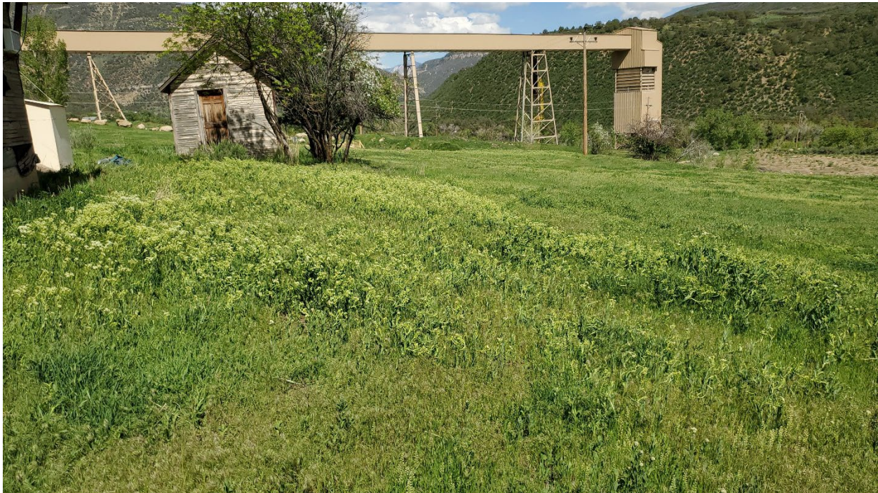
Figure 1: Whitetop, recently sprayed