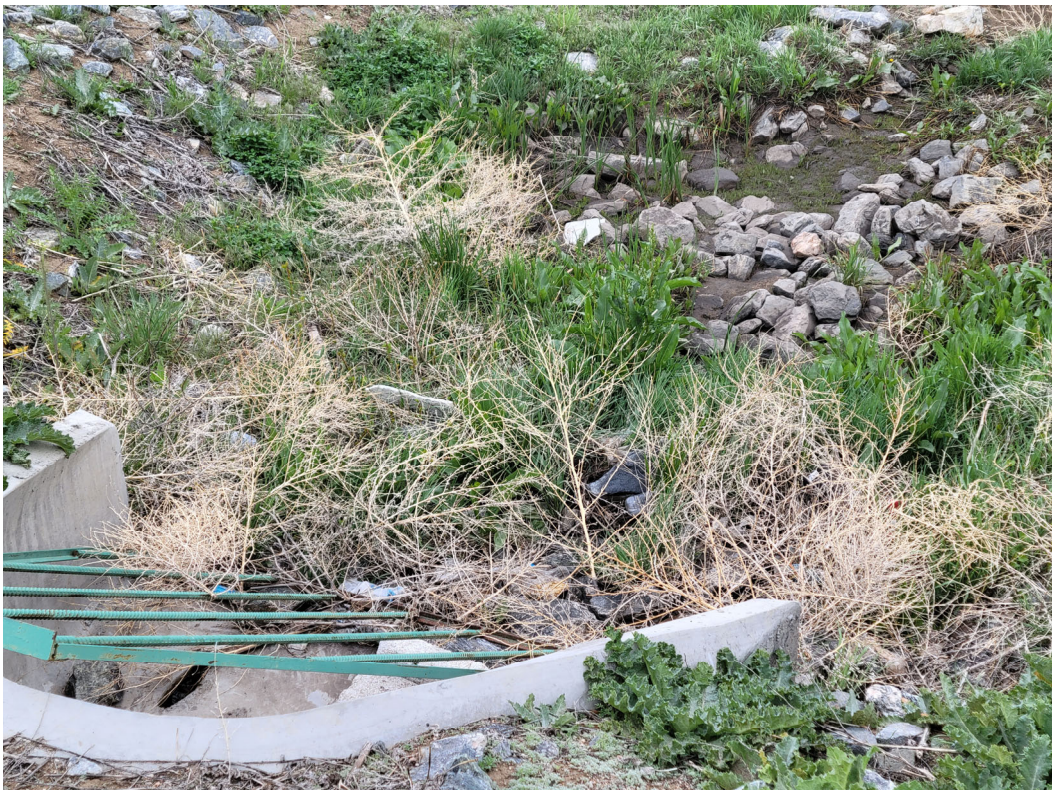
Photo 6. Stormwater drain discharge structure appears to be located outside the southern boundary of the permit area.