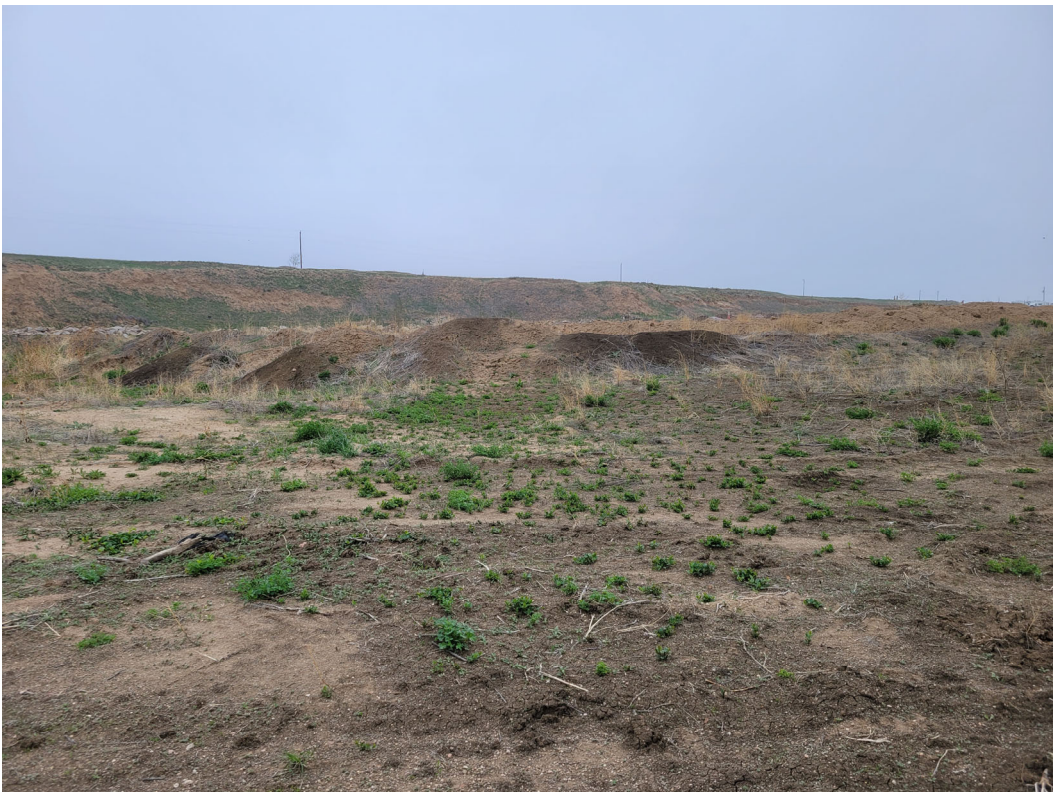
Photo 4. Looking west at the highwall. Stockpiles of mined material in the center of the permit area.