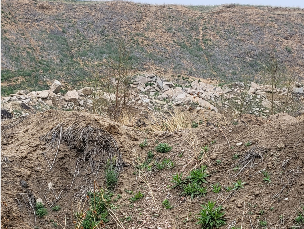
Photo 8. Concrete fill observed along the base of the western highwall.