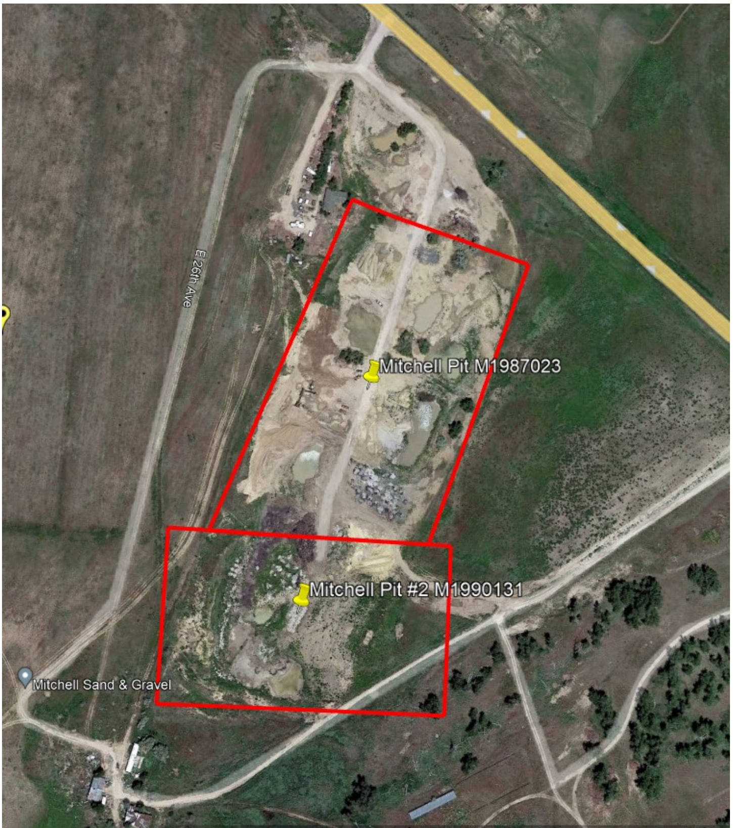
Photo 10. Google Earth image dated 5/2020. Permit boundaries outlined in red.