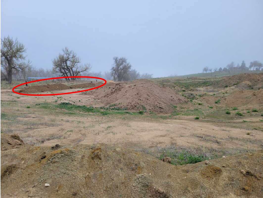
Photo 3. Looking south from the road in the northeastern corner of the permit area. Operator indicated the stockpiled road material (circled) is outside the permit boundary.