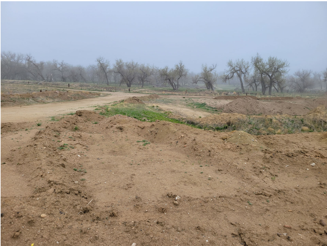
Photo 2. Looking east at the northeastern corner of the permit area.