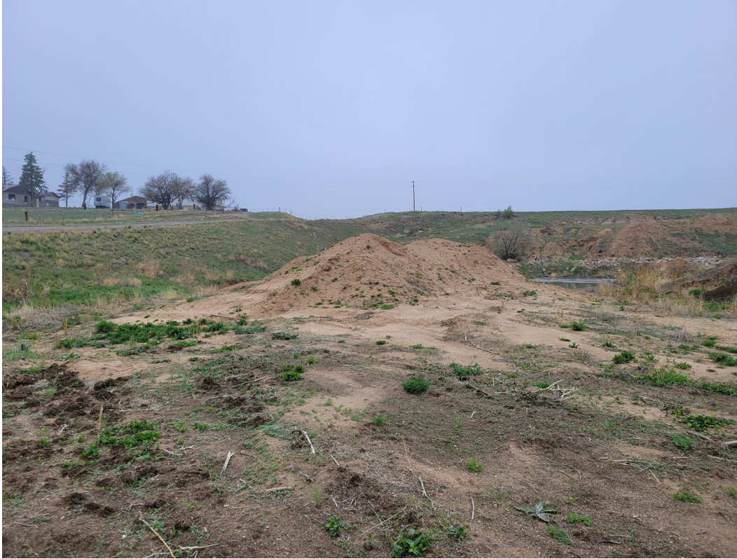
Photo 5. Looking southwest at the southern border of the permit area. Stormwater drain runs east to west along this portion of the permit area. Slope was graded and seeded after construction of storm drain.