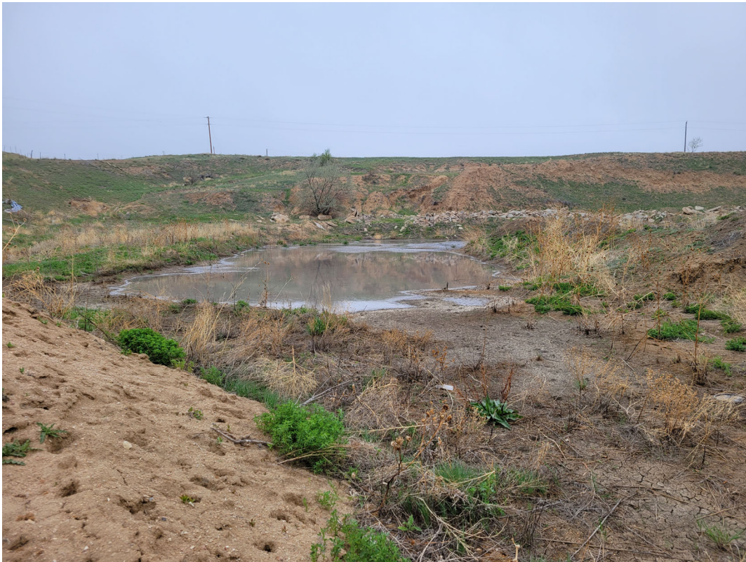
Photo 9. Slurry disposal area on the southern end of the permit area.