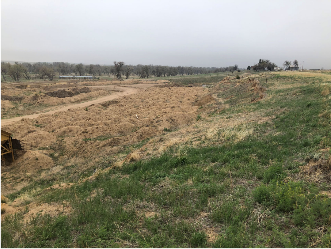
Photo 1. Looking south across mining area from the top of the western highwall.