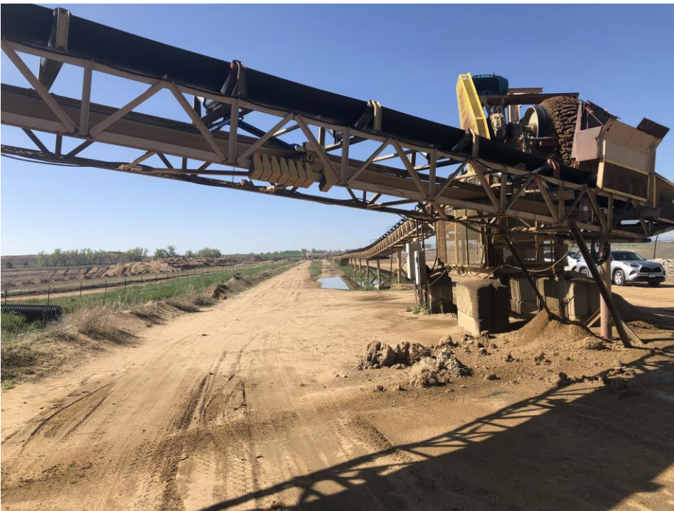
West side of permit boundary, looking south along conveyor