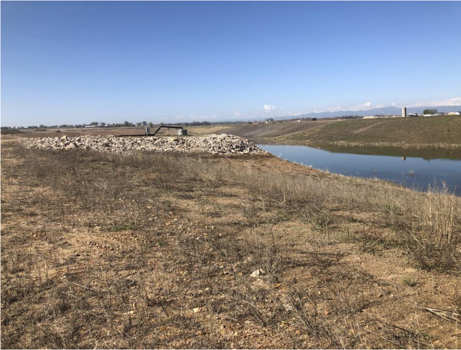
Reservoir in Tract A