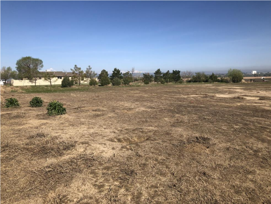
Main portion of AR-01 area