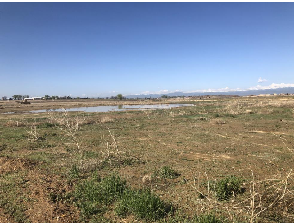
Former settling pond