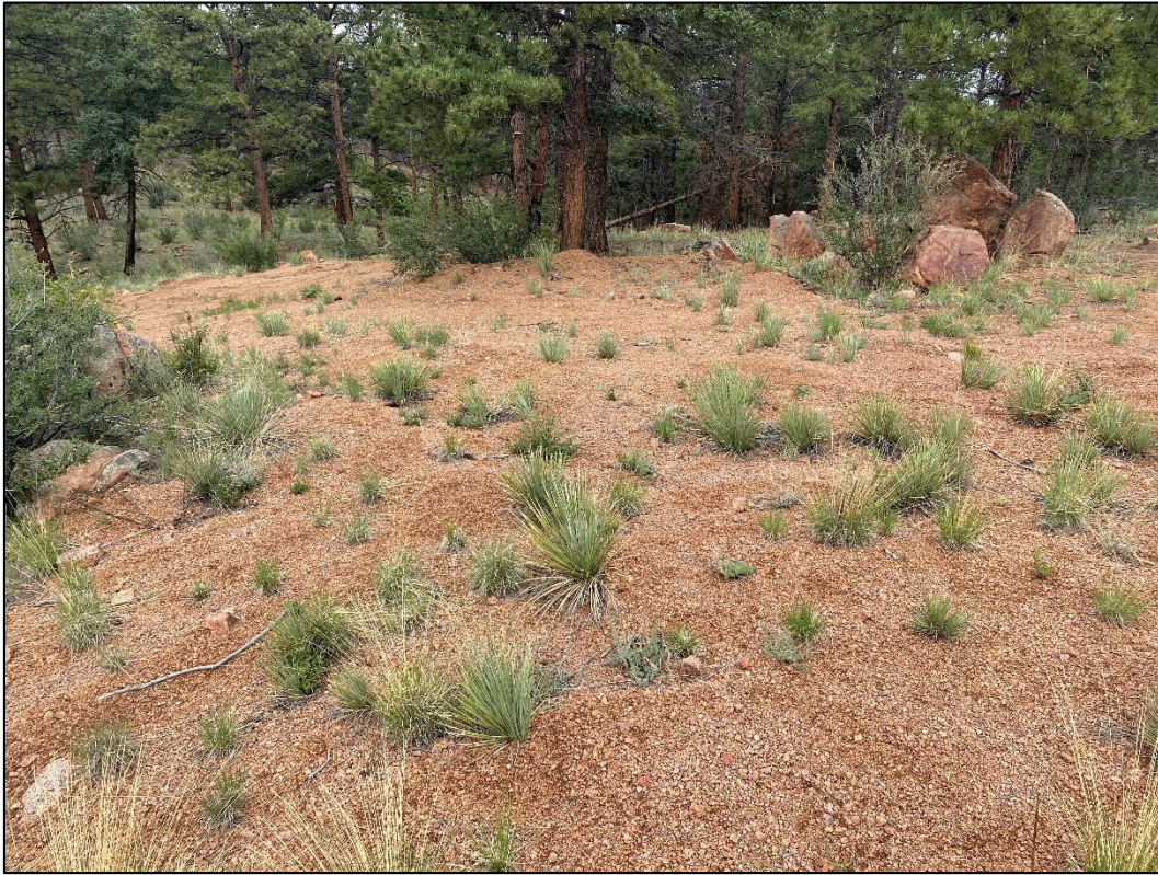
Photo 3. Backfilled and graded site, volunteer vegetation establishing; looking west.

Taylor Conway 1936 Alpine Dr. Erie, CO 80516