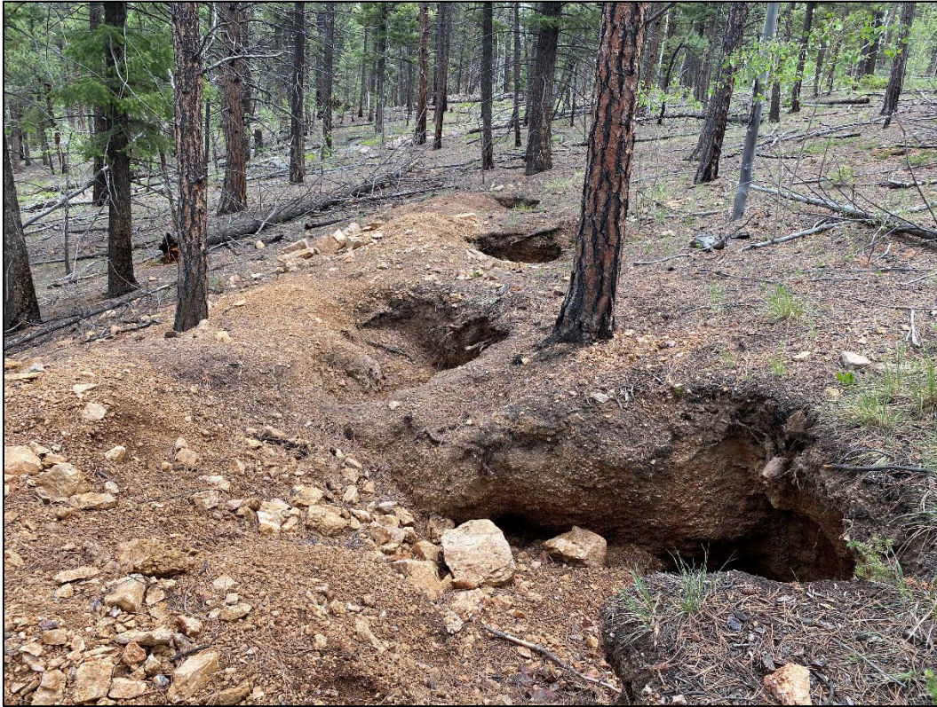
Photo 7. Mineral trespass hand-digging disturbances in Mining Area #3; looking east.

Taylor Conway 1936 Alpine Dr. Erie, CO 80516