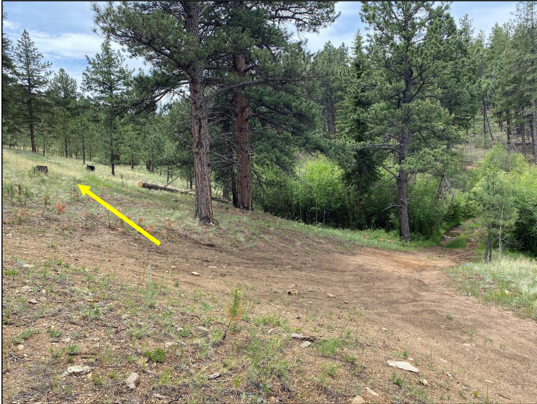
Photo 1. New access route (arrow) entrance along M-2014-042 access road #8; looking south.