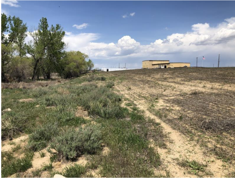
Area 38 (reclaimed soil pile area) on right, and Dugout Pond on left