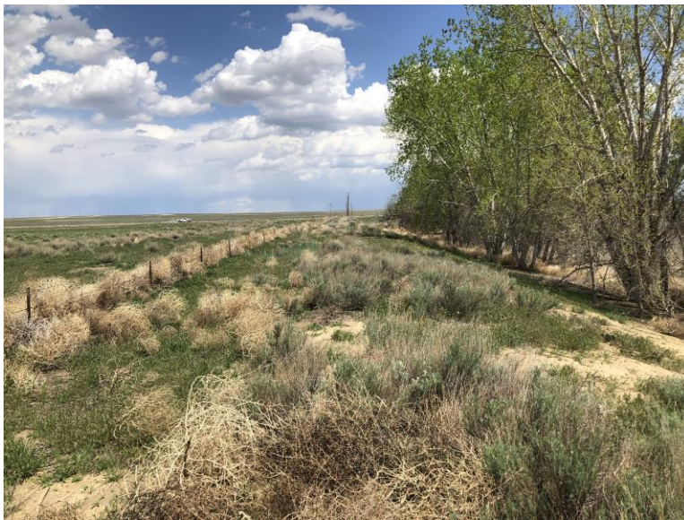
Embankment below Sediment Pond 2

Number of Partial Inspection this Fiscal Year: 6