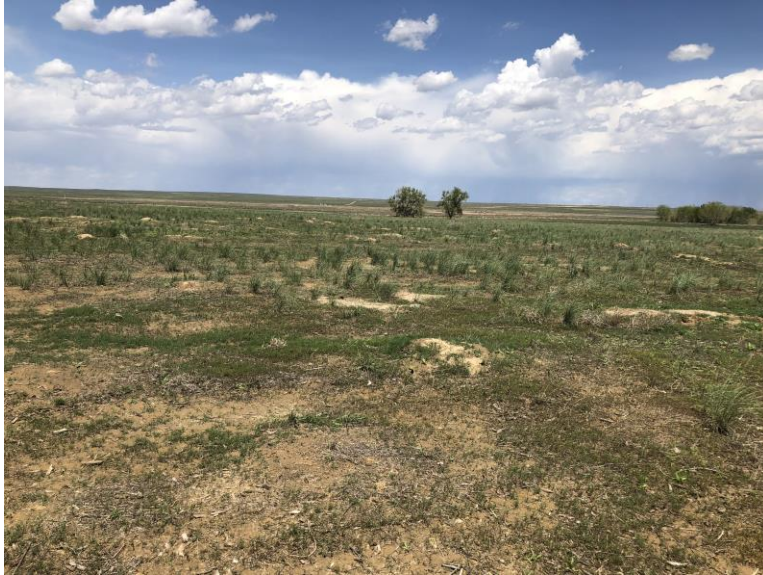
Area 36, reclaimed long-term spoil area – earth mounds likely created by prairie dogs