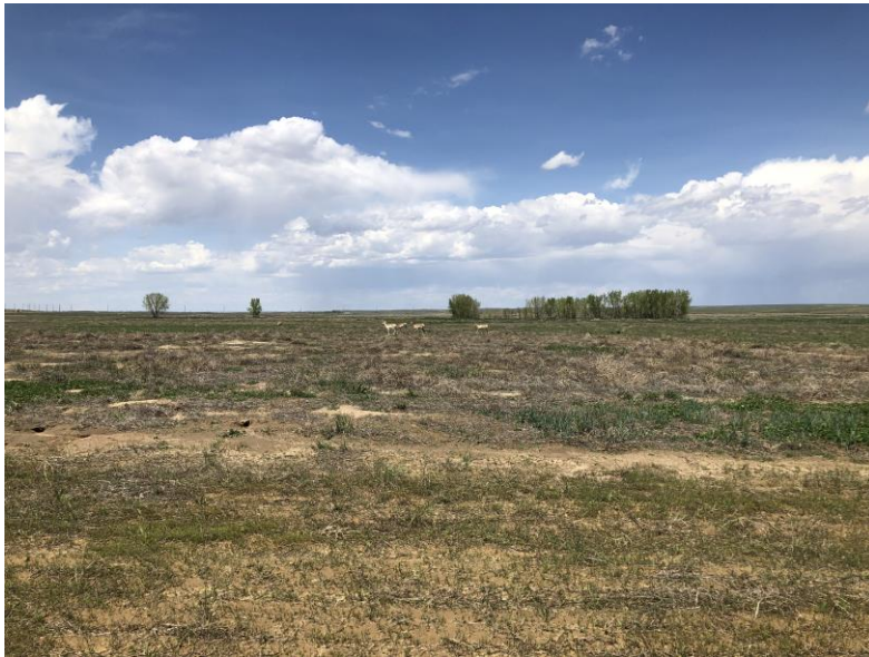
Pronghorn on Area 25

Number of Partial Inspection this Fiscal Year: 6