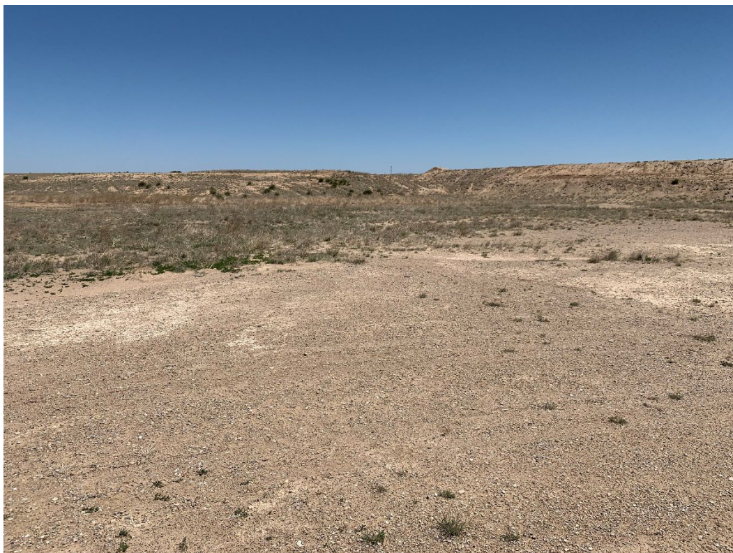
Photo 3- Reclaimed slopes on northern side of pit area